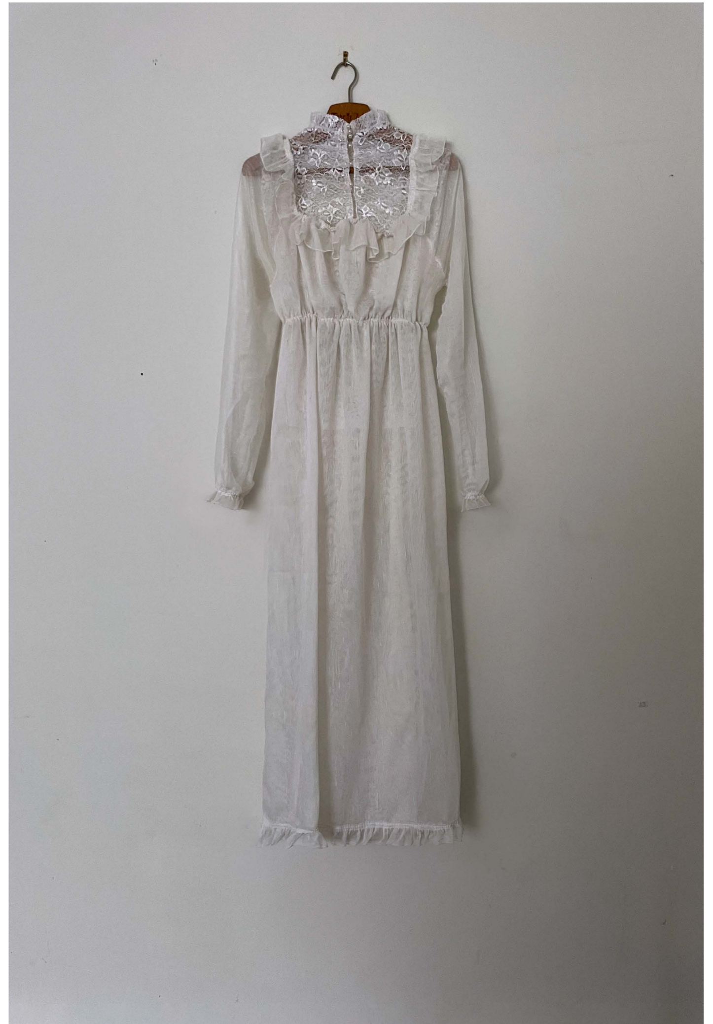
Angel Dress 2021