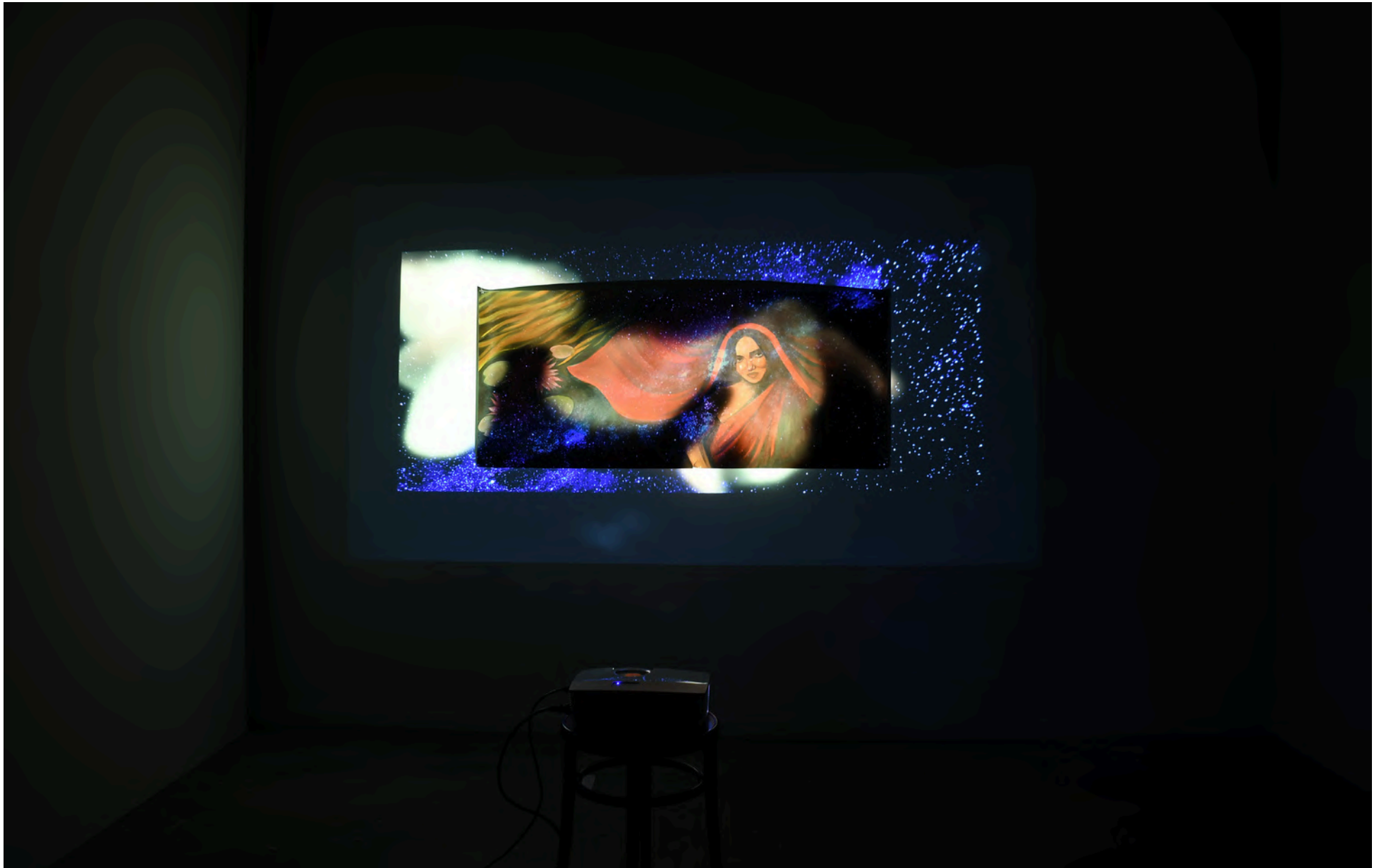
THE LAST JOURNEY "VIA KREIS" 2022 OIL ON PAPER, PROJECTION