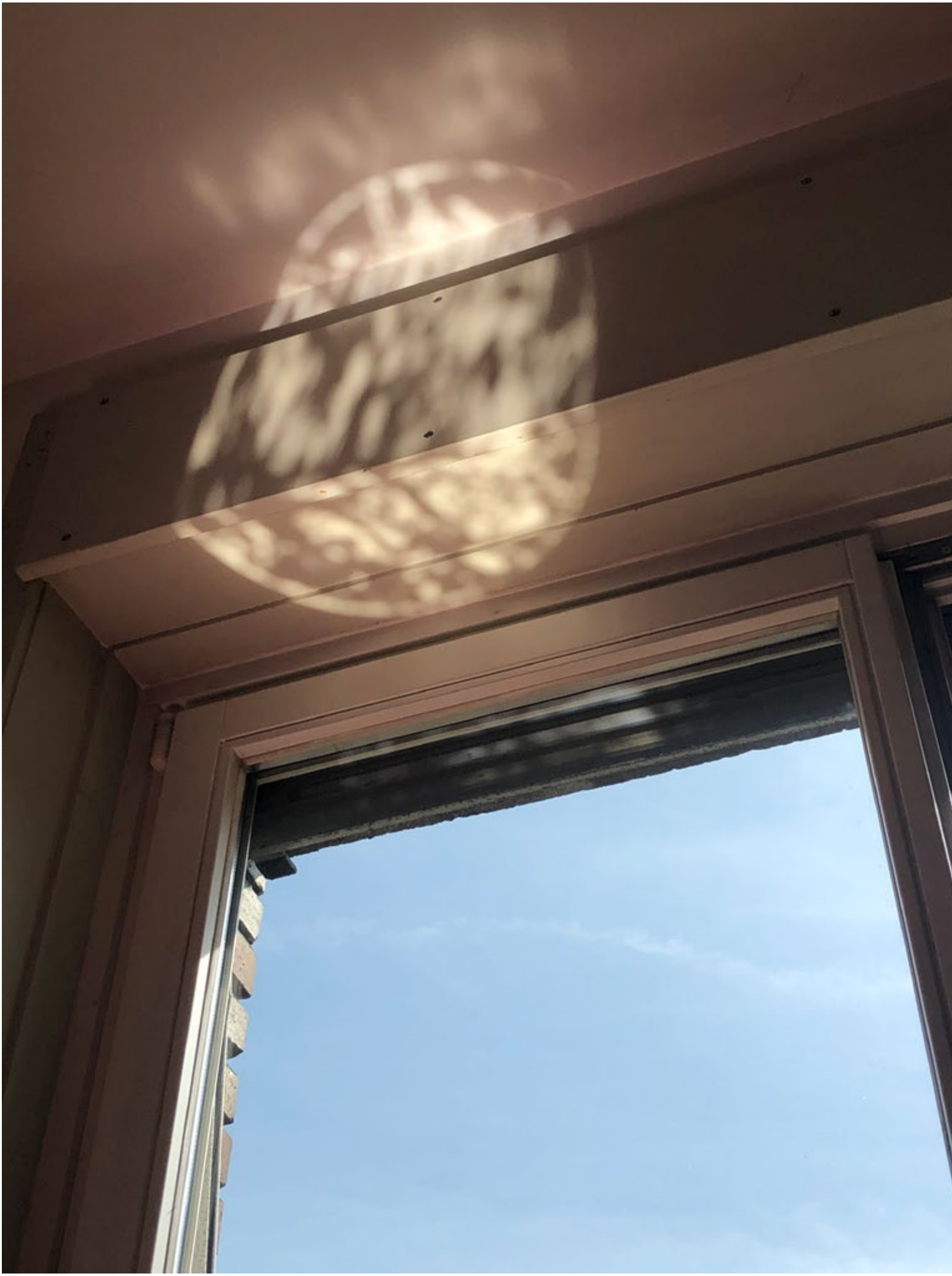
ajourney 2020 installation oil and sunlight on mirror ca. 40 x 40 cm