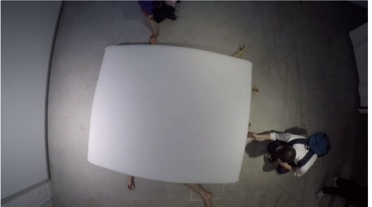
stills from the videodocumentation of untitled 1h 49 min