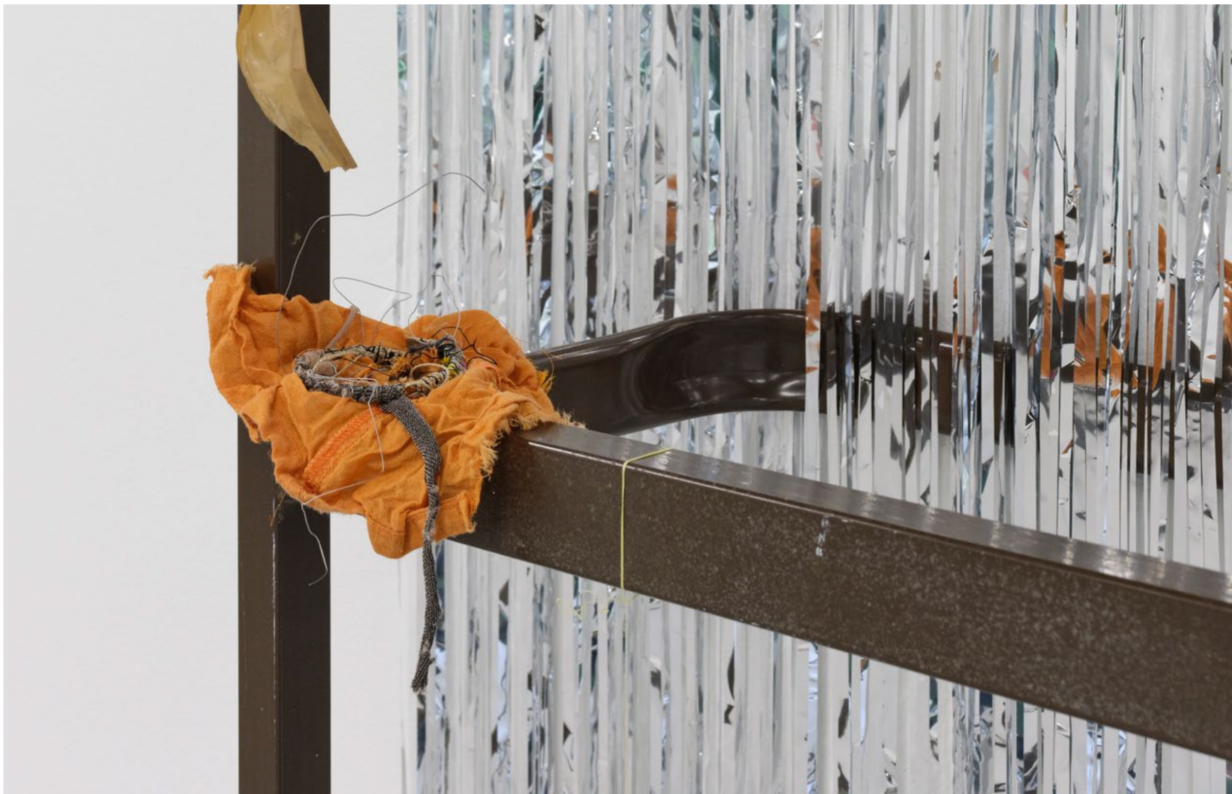
object of my knee told me to fabric, thread, bangle, nylon and other materials