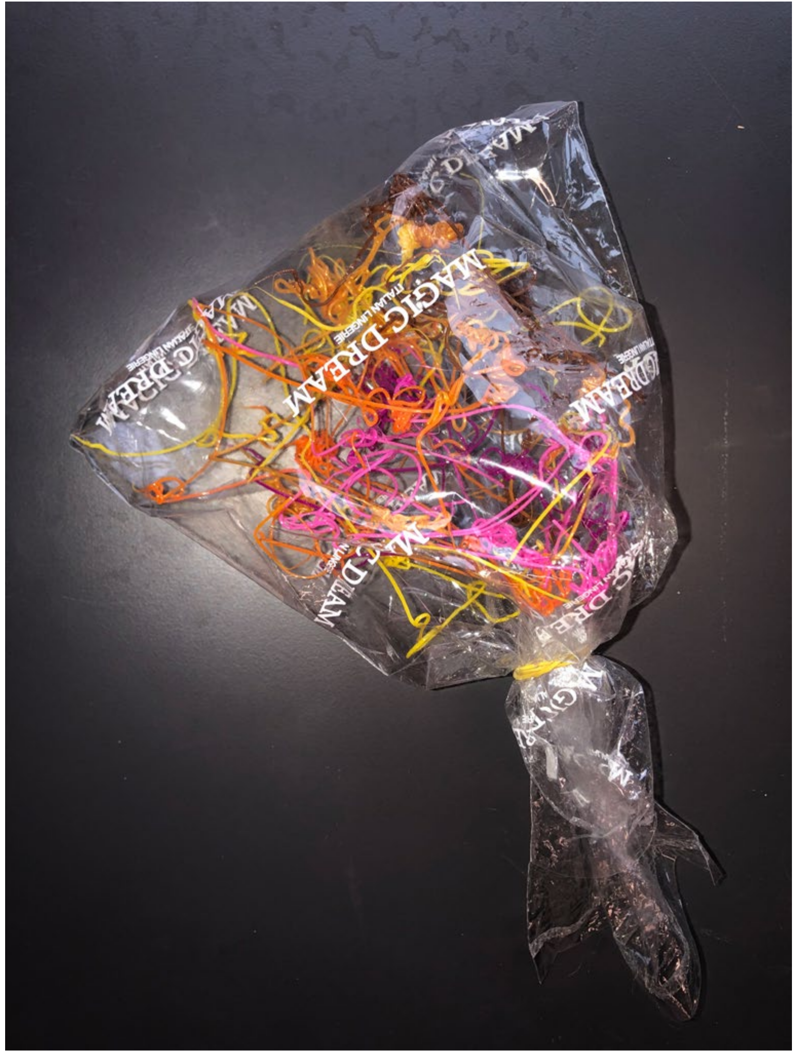
photo got printed as a new year card 2021 by zurich university of arts