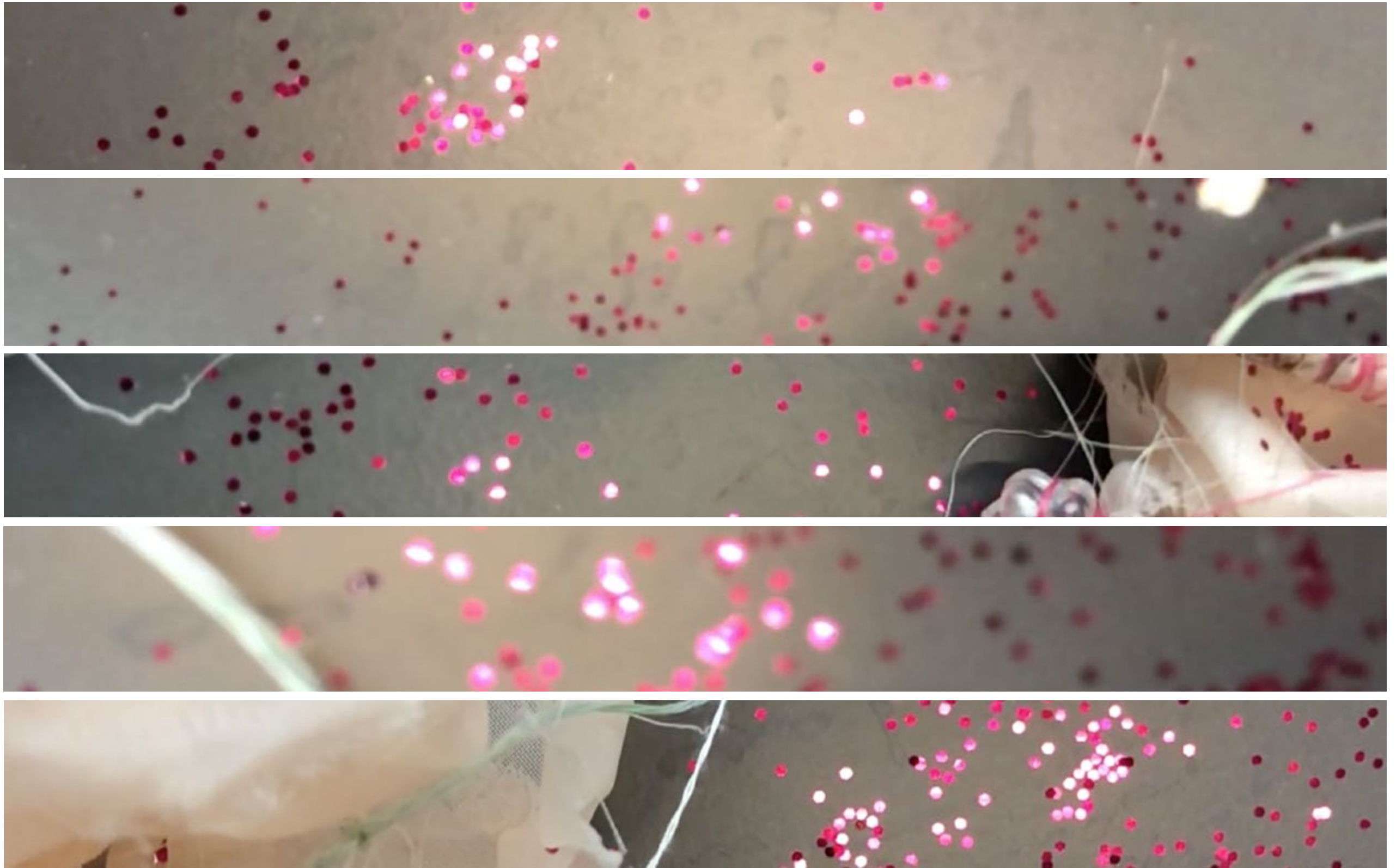
videostills from welcome to the private show