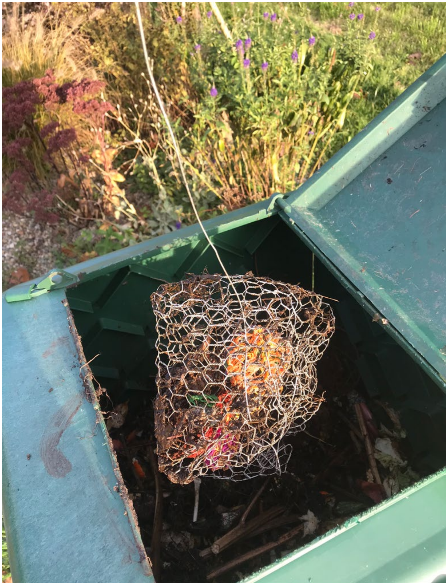
kompost 2020 - ongoing project testing the compostability of 3d-pen-objects