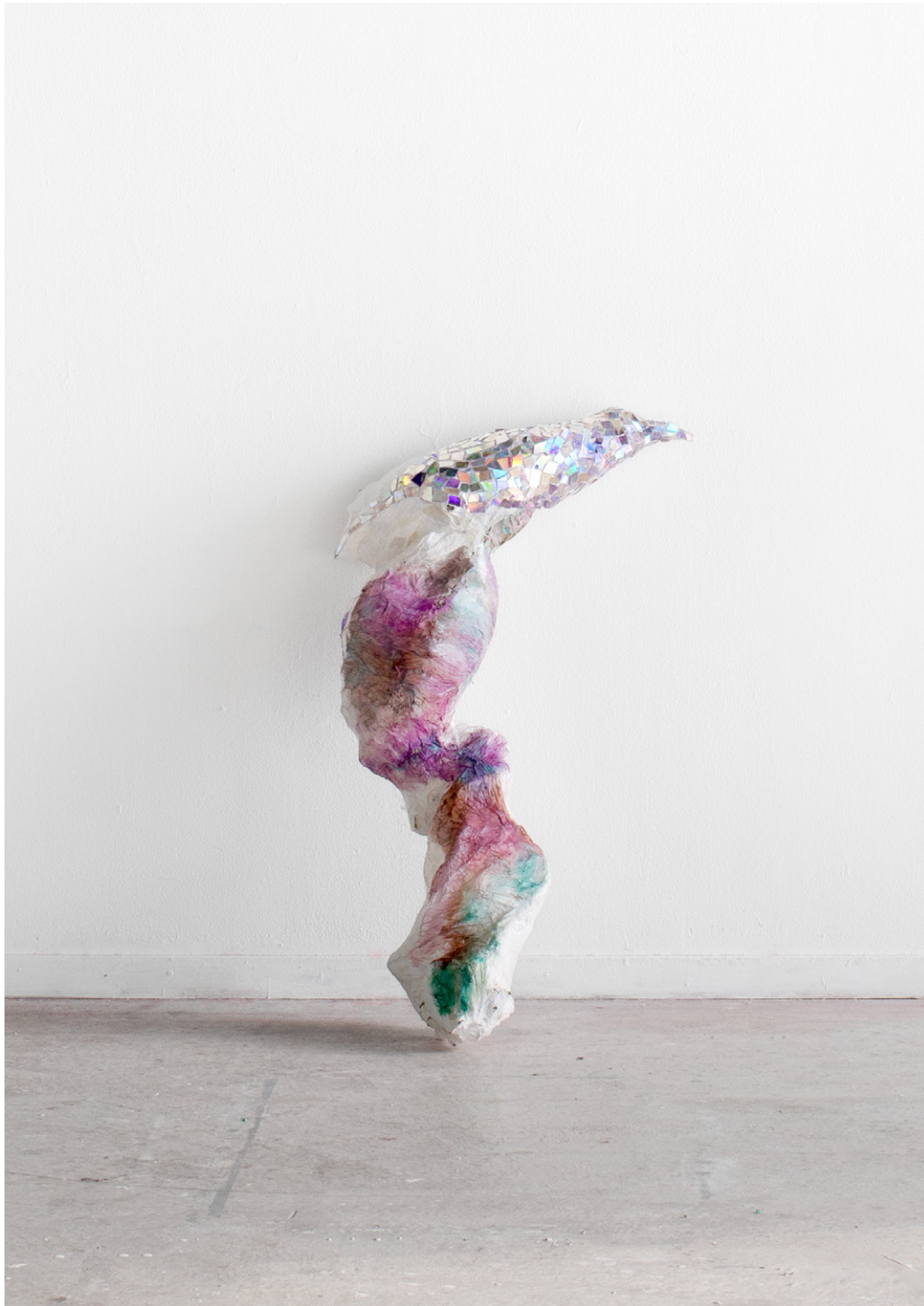
Tu m'abuses, je t'en prie, c'est ma vie chérie , 2023

Paper mâché, chicken wire, compact discs, oil color, gel medium 90 x 20 x 20 cm