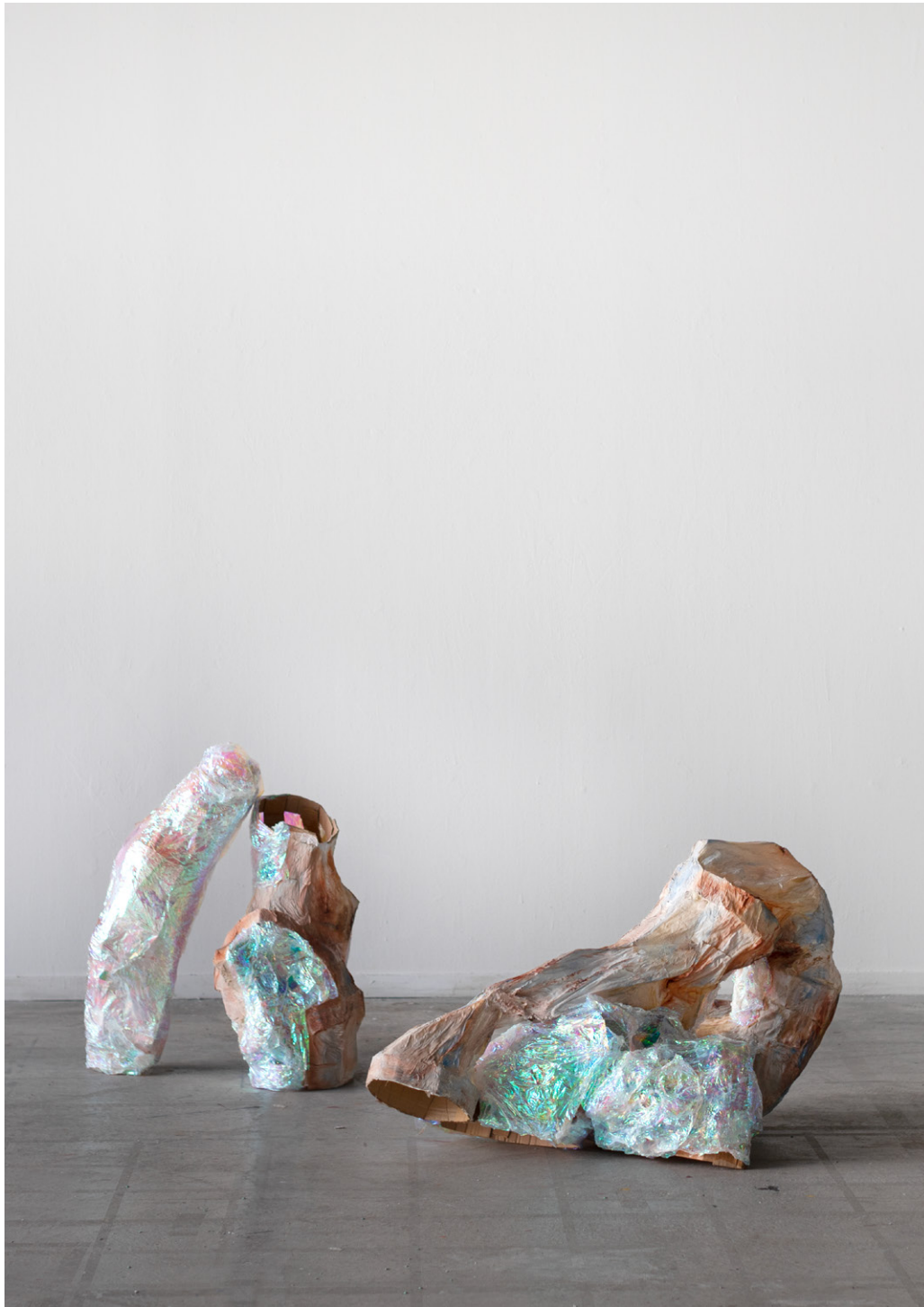
Three days no sleep, floating on fairy dust, 2023 Paper maché, iridescent plastic, cardboard, oil color Approx. 90 x 180 x 100 cm