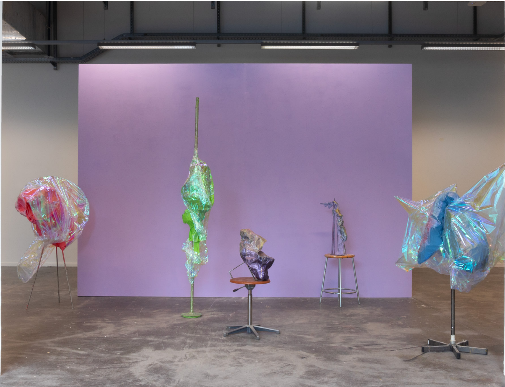
Massive Promises (1-5), 2024

Acrylic paint, plaster, textiles, fiber glass, metal stand