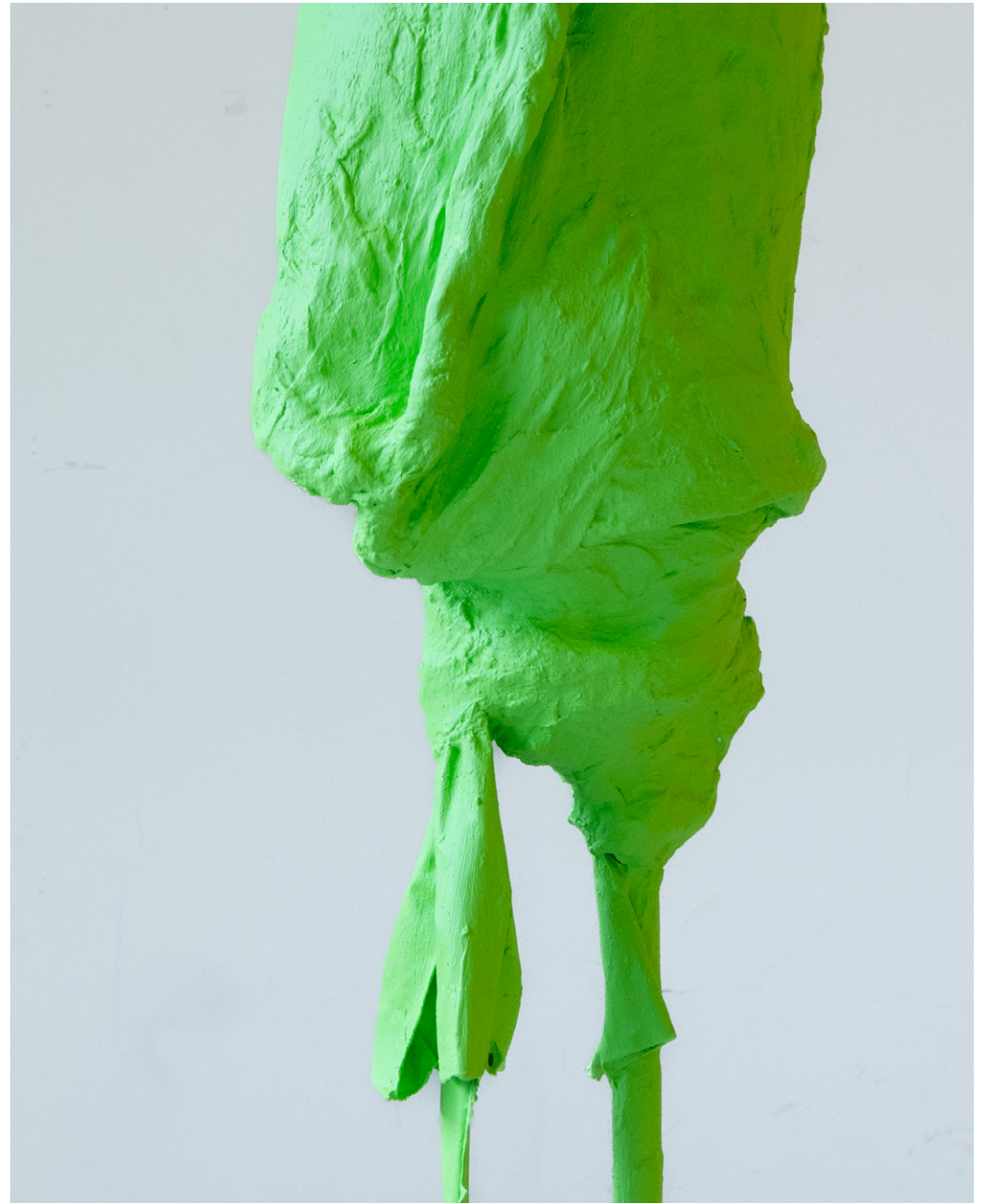
I stand in the absence, 2024

Acrylic paint, plaster, textiles, fiber glass, metal pole 221 x 34 x 23 cm