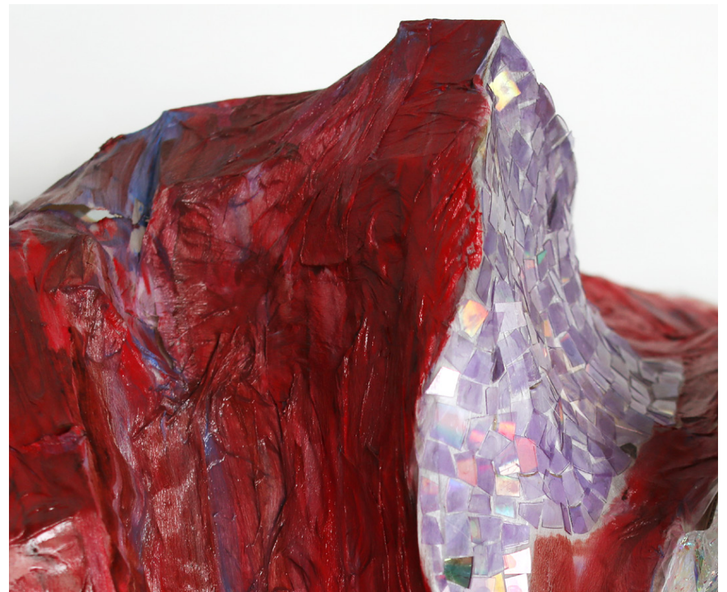
Blue Seas Blue Skies , 2023

Paper mâché, iridescent plastic, cardboard, oil color