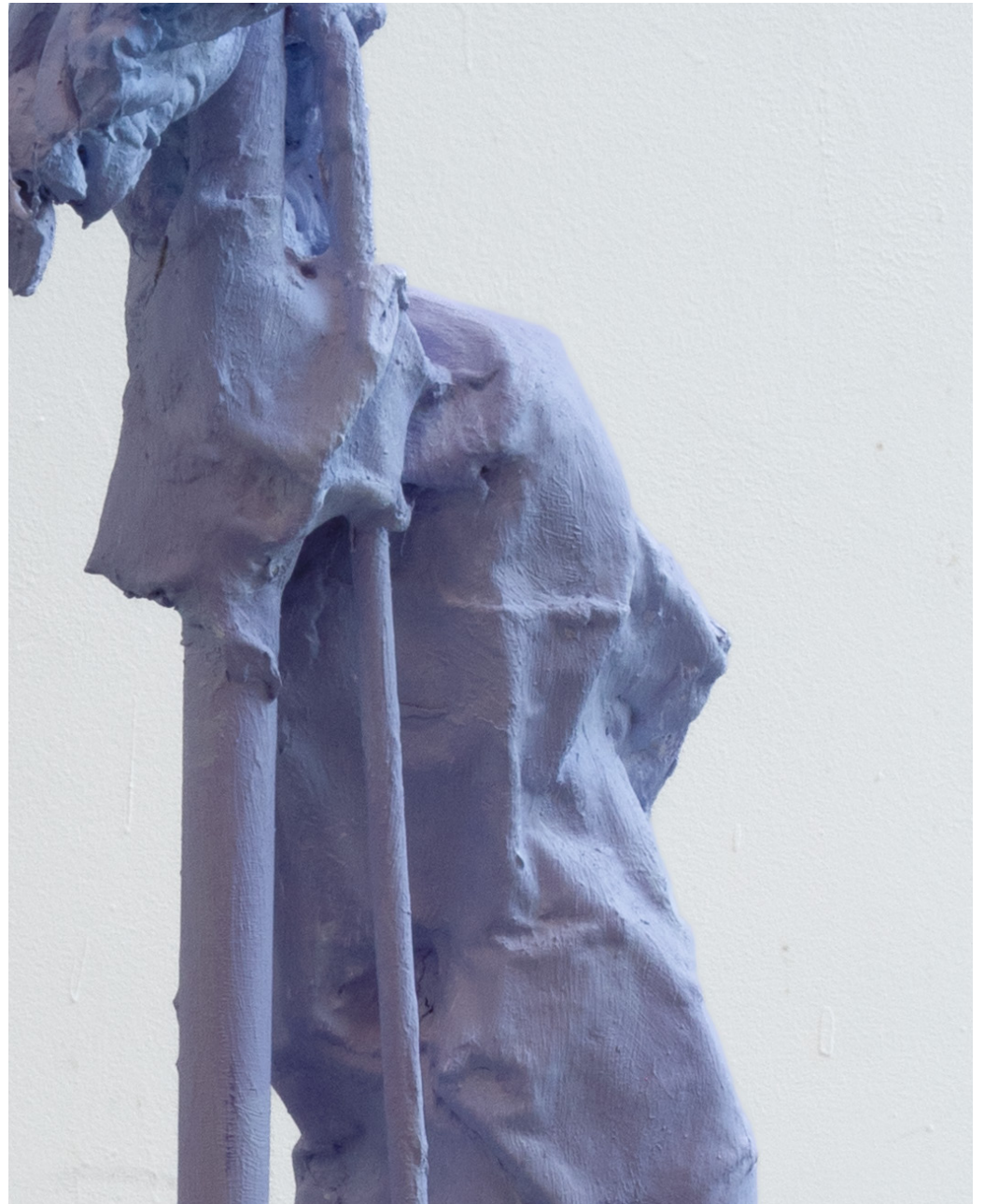
Hope reminds me of her, 2024 Acrylic paint, plaster, textiles, fiber glass, metal stand 63 x 28 x 15 cm