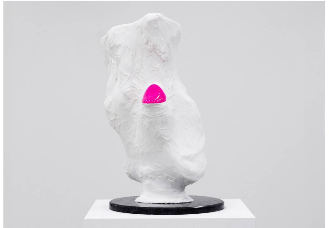
You pissed all over my sandcastles , 2023 Paper mâché, foreign plastic object, acrylic paint, varnish 64 x 32 x 22 cm