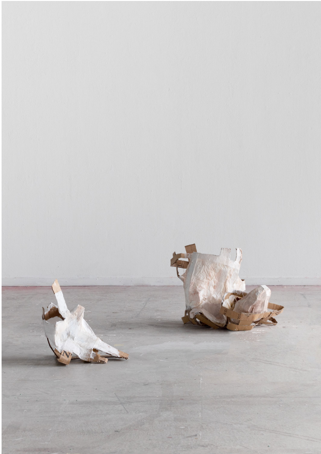
The body as a shell, the sea is my mother, 2023 Paper mâché, cardboard, oil color Approx. 50 x 90 x 70 cm