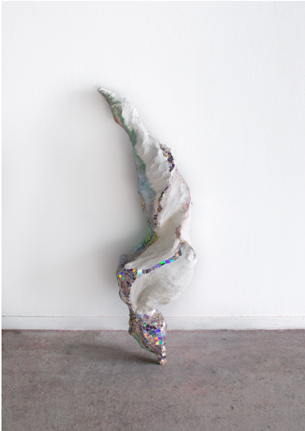
Toxicity is not okay, 2023

Paper mâché, chicken wire, compact discs, oil color, gel medium 90 x 20 x 20 cm