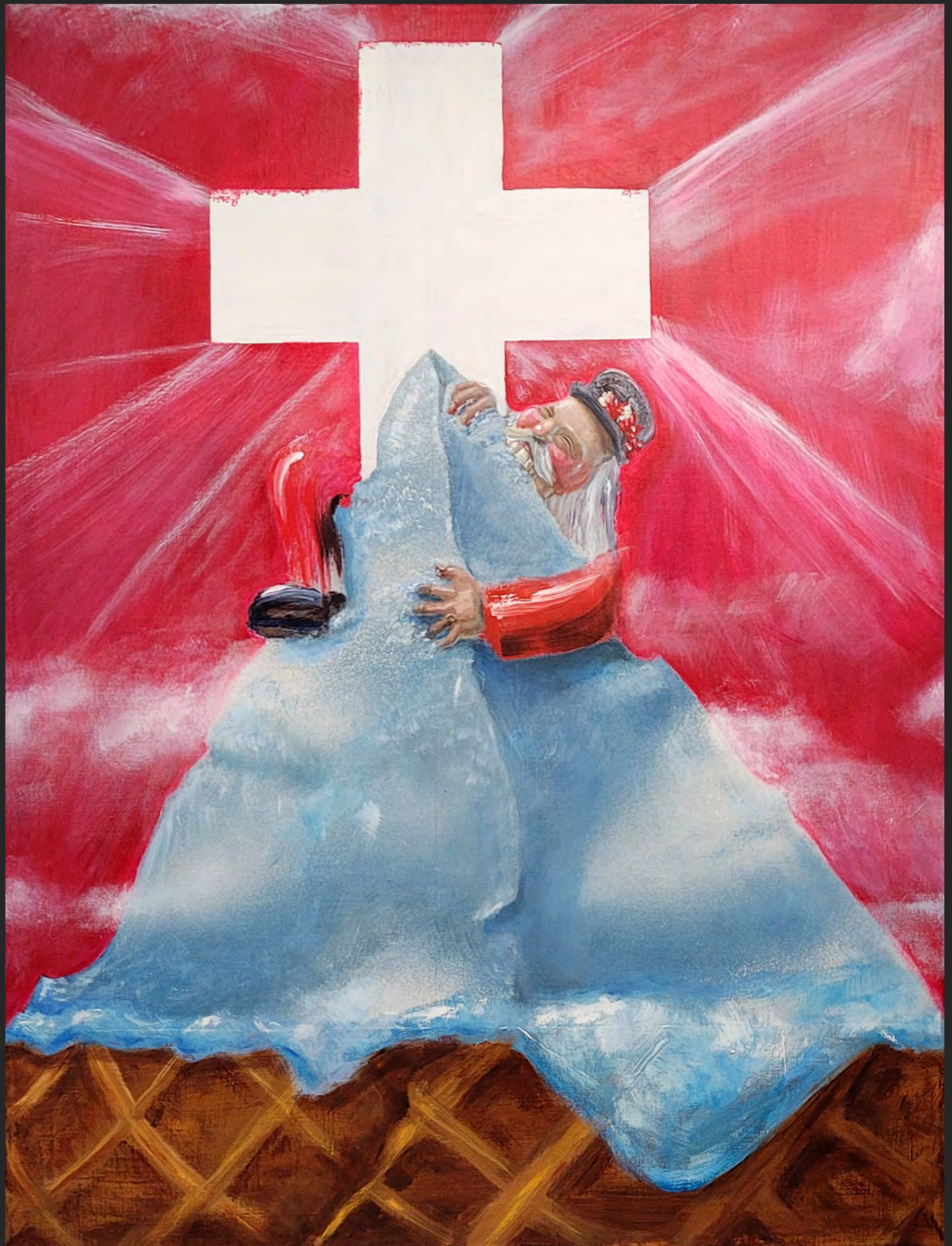
Grüessli vom Himmel, 2022 Acrylic on canvas 100x60 cm