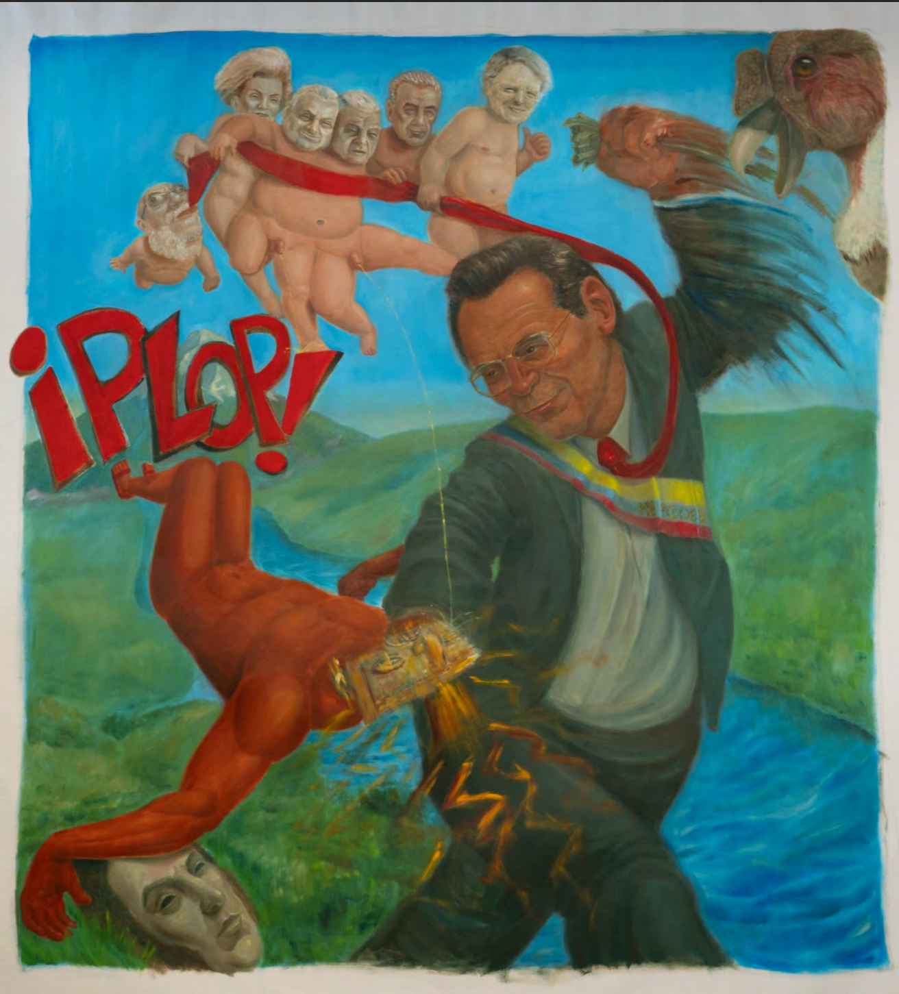
Do bankers dream of fat flying pigs? (Switzerland), 2023 Do bankers dream of fat flying pigs? (Ecuador), 2024 Oil on canvas 199.6x215 cm (each)