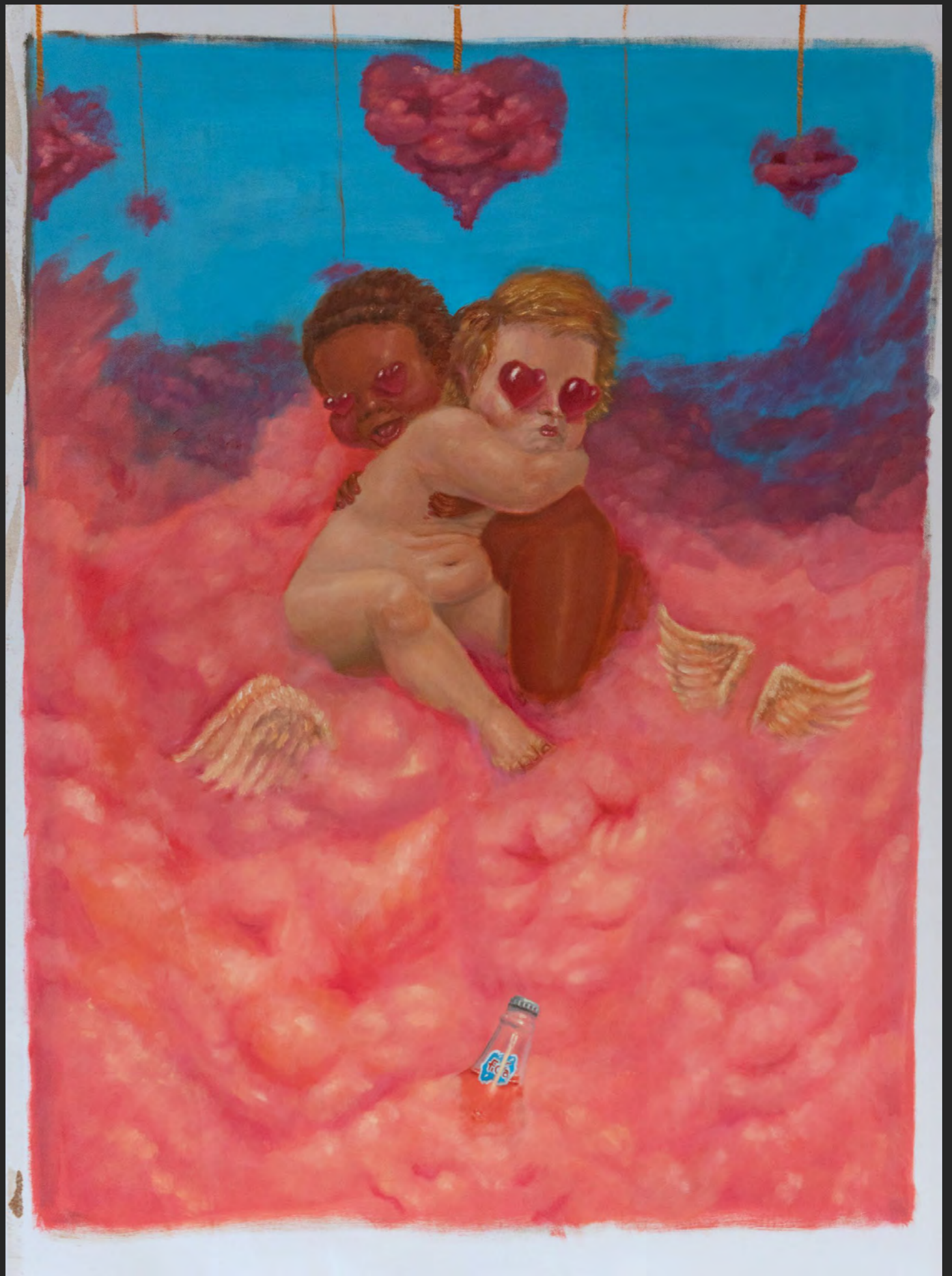
Soft pink clouds, 2024 Oil on canvas 108x78.5 cm