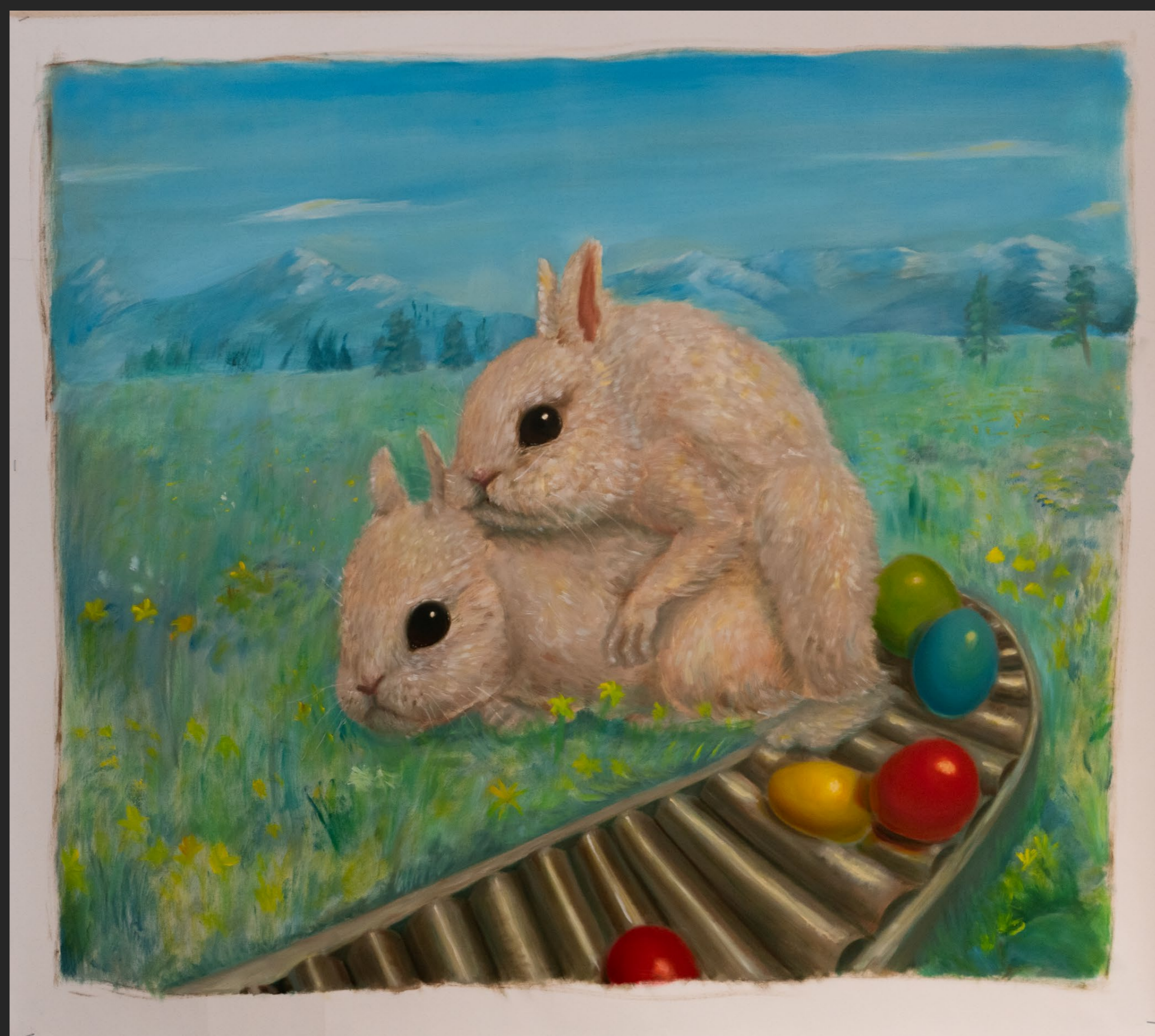
The production must go on, 2024 Oil on canvas 108x120 cm