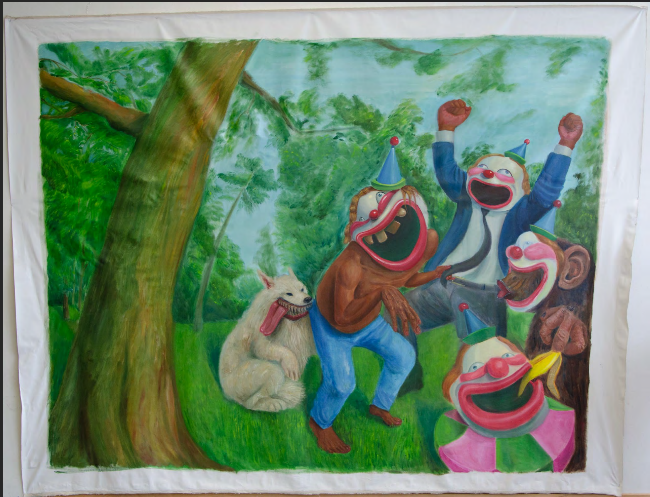
Un día común (a common day), 2023