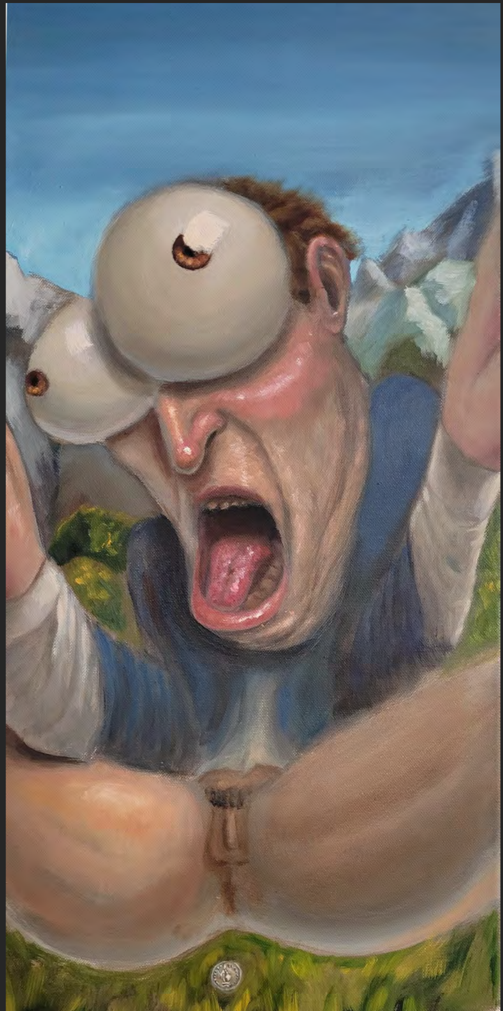
Los buenos vientos (the good air), 2022 Oil on canvas 70x30 cm