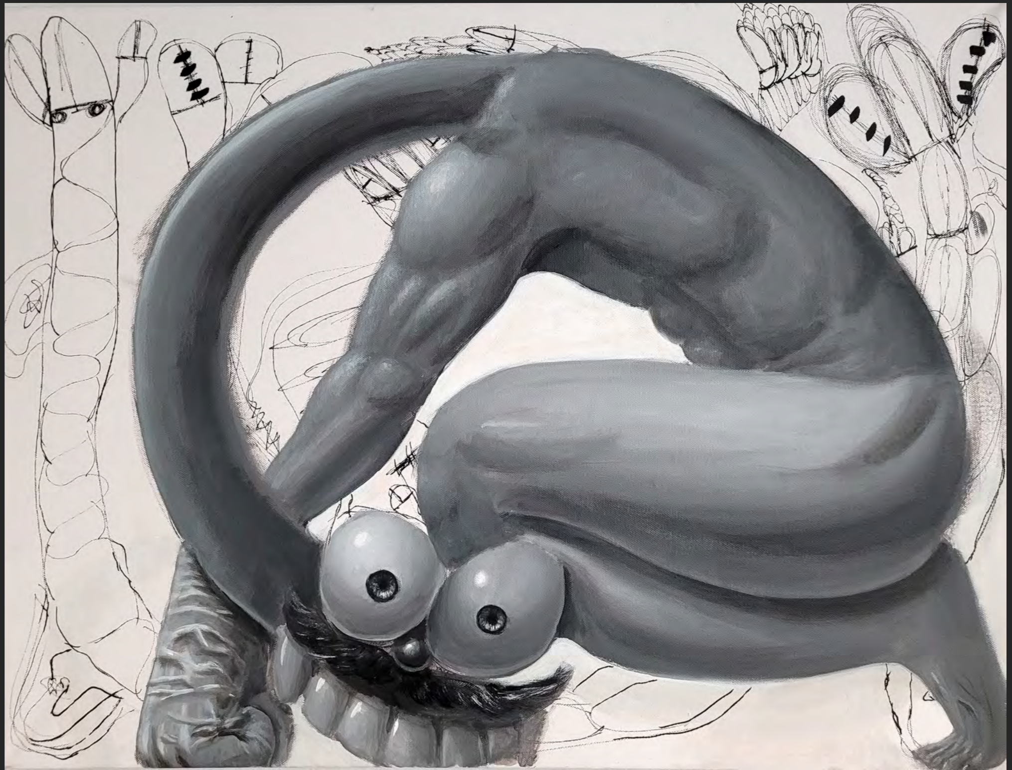
You write me I write you, 2022 Acrylic on canvas 60x80 cm