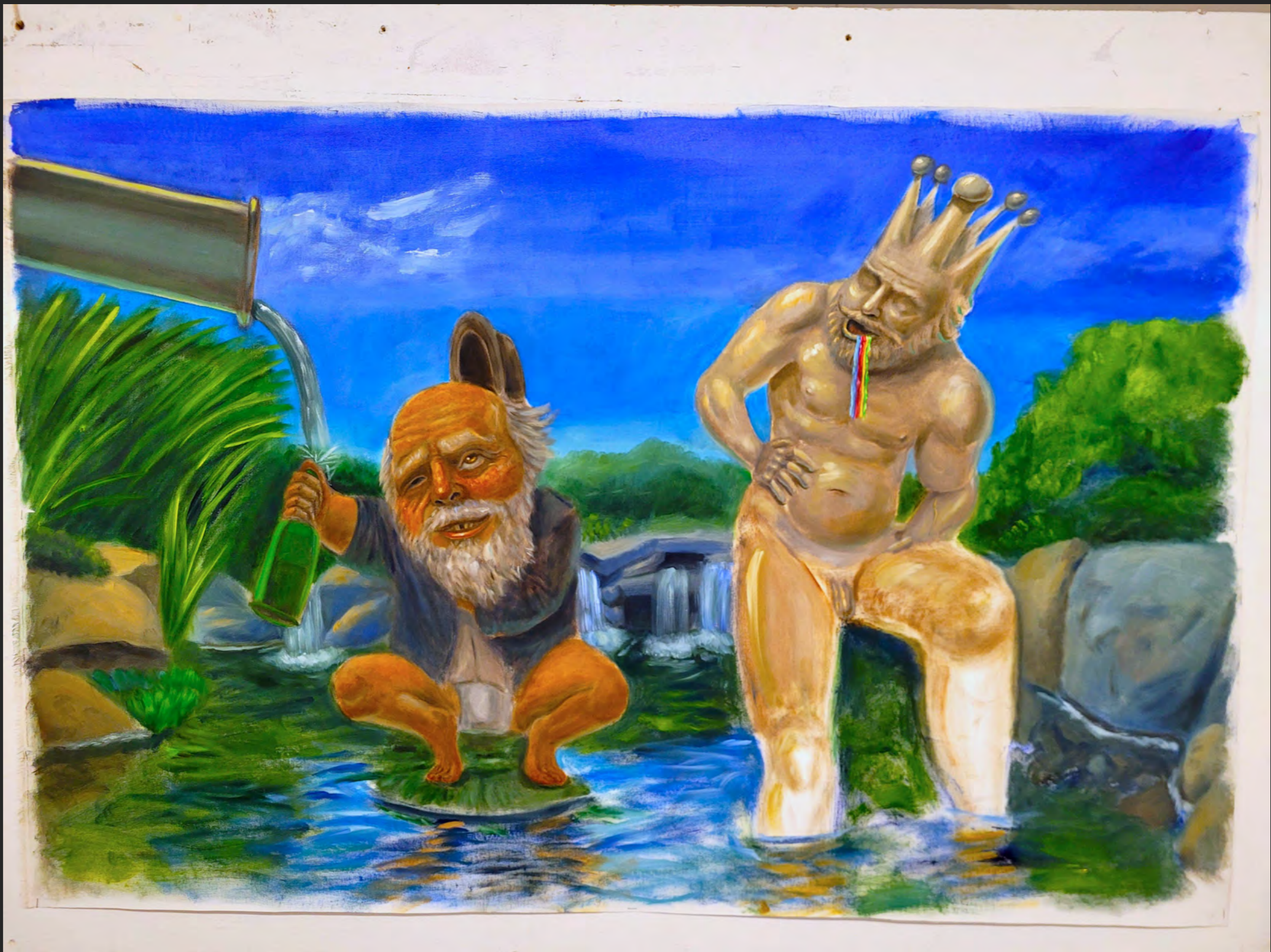
Hola guapo, tienes sed? , 2022 Oil on canvas 100x150 cm