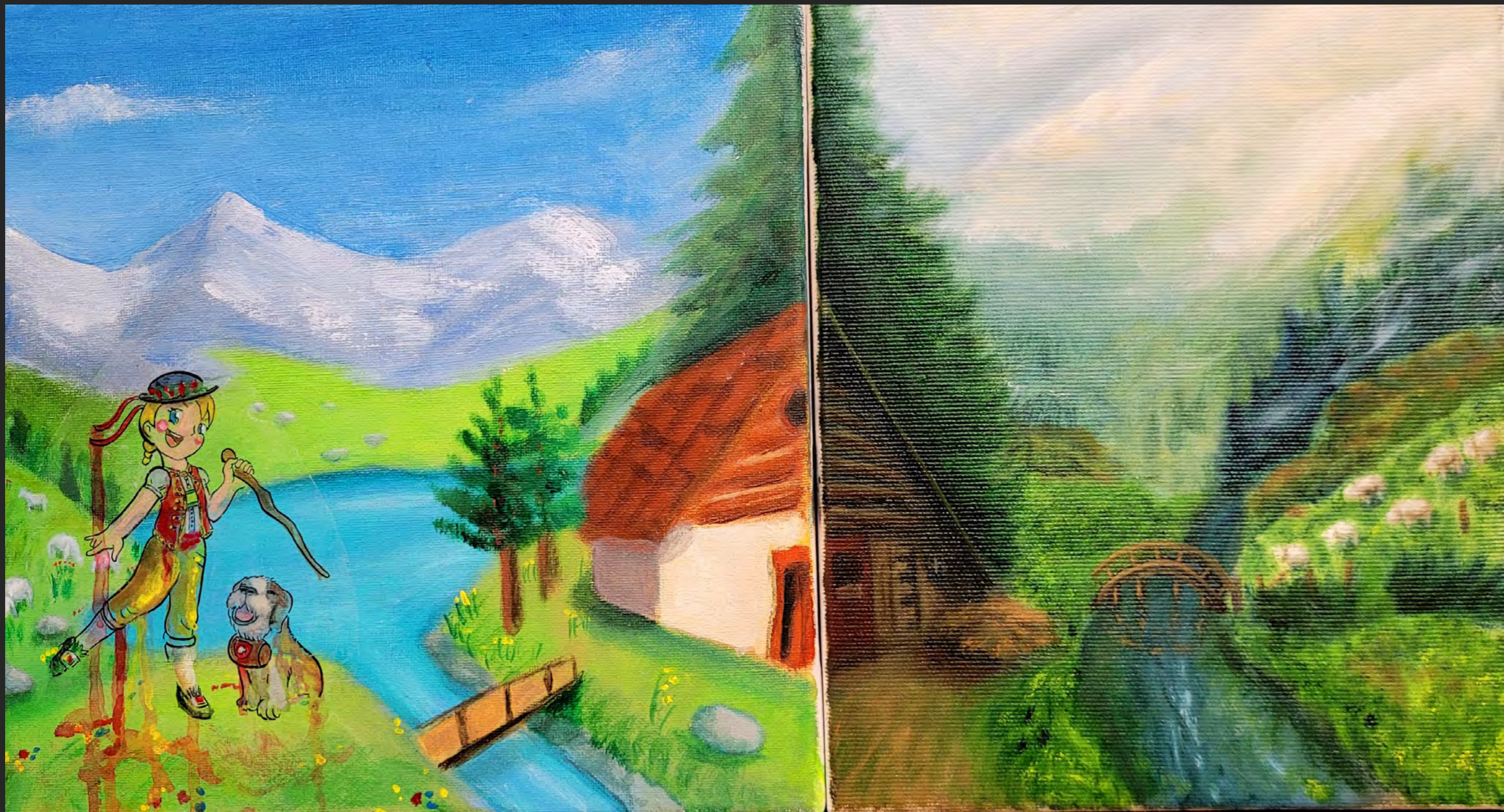
100% BIO Swiss, 2022 Acrylic and oil on canvas 35x20 cm