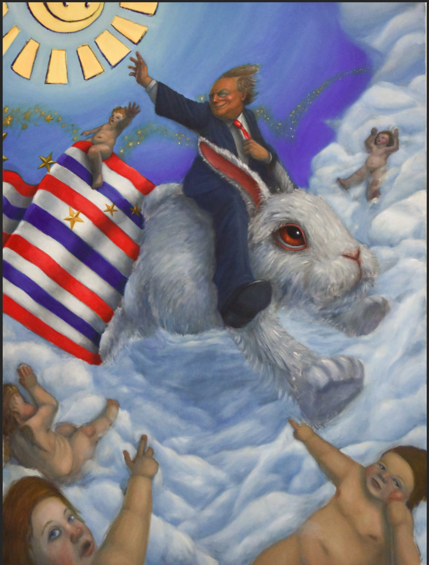
Trump Crossing the Skies, 2021