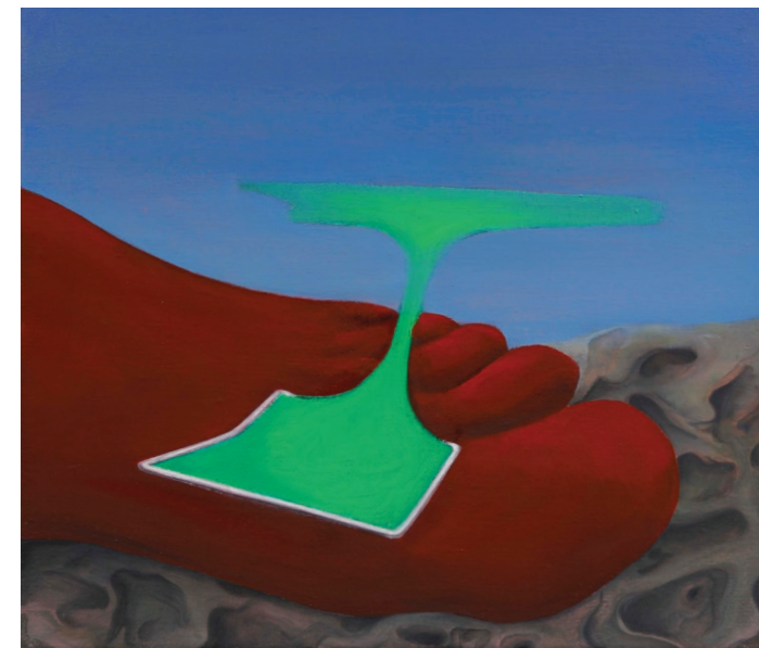
Stay here! (2019) oil on canvas 27 x 31 cm