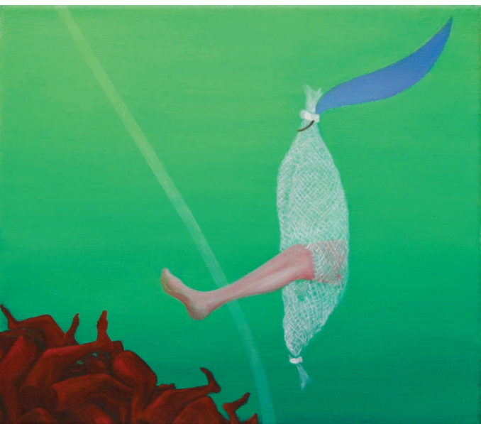
Nice shot! (2019) oil on canvas 27 x 31 cm