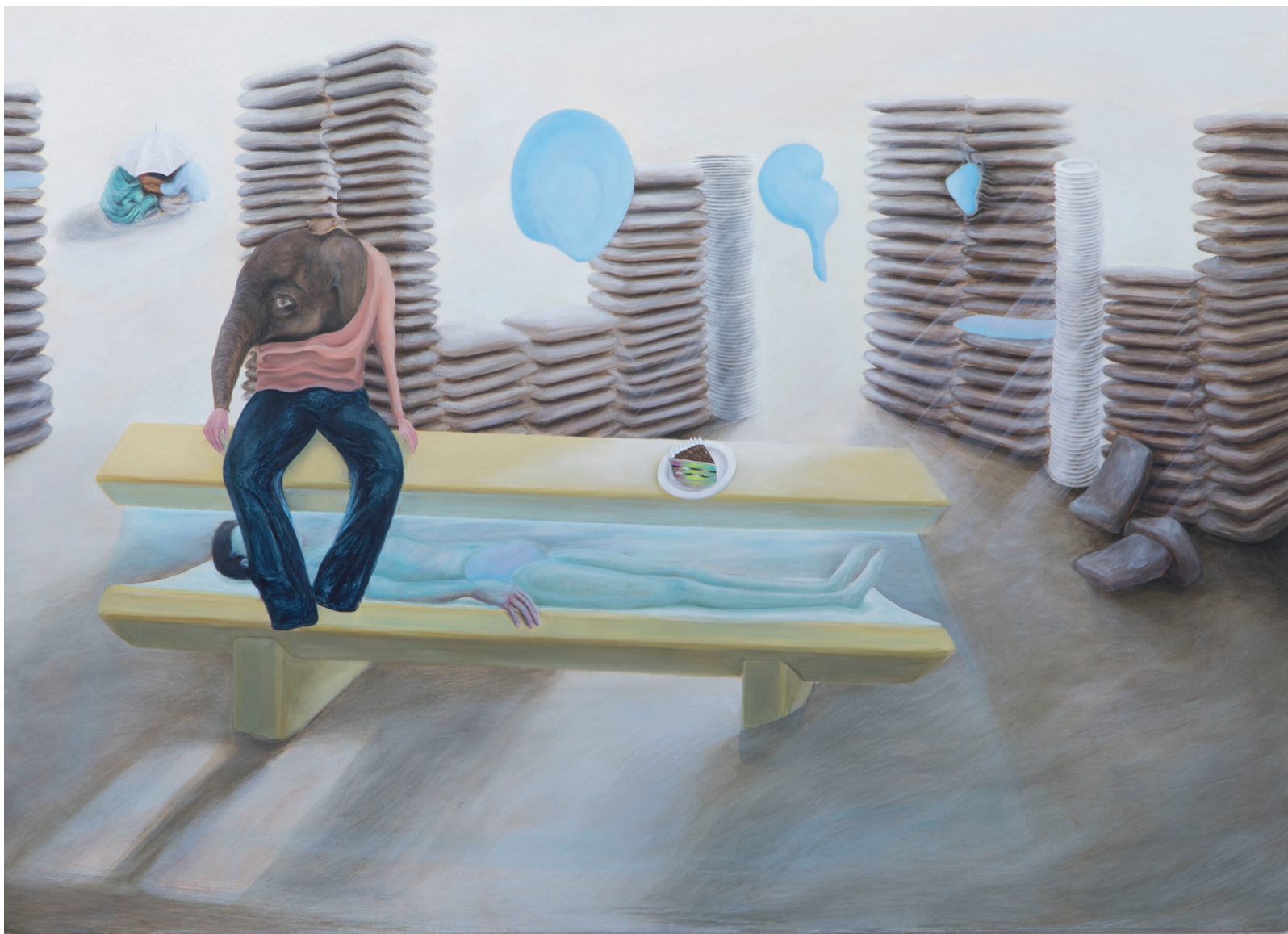
Untitled (2020) oil on cotton 80 x 110 cm