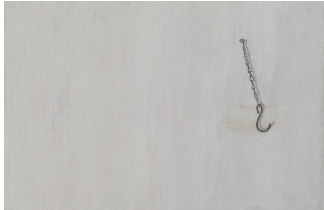
Not titled yet (2017) oil on cardboard 48 x 32 cm