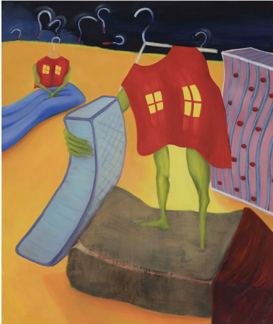
Lay down layers (2019) oil on cotton 77 x 65 cm