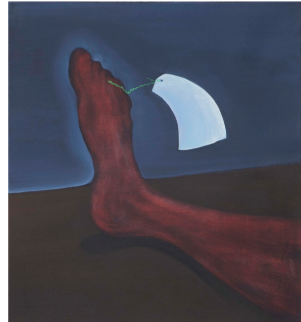
Lay down layers (2019) oil on cotton 45 x 41 cm