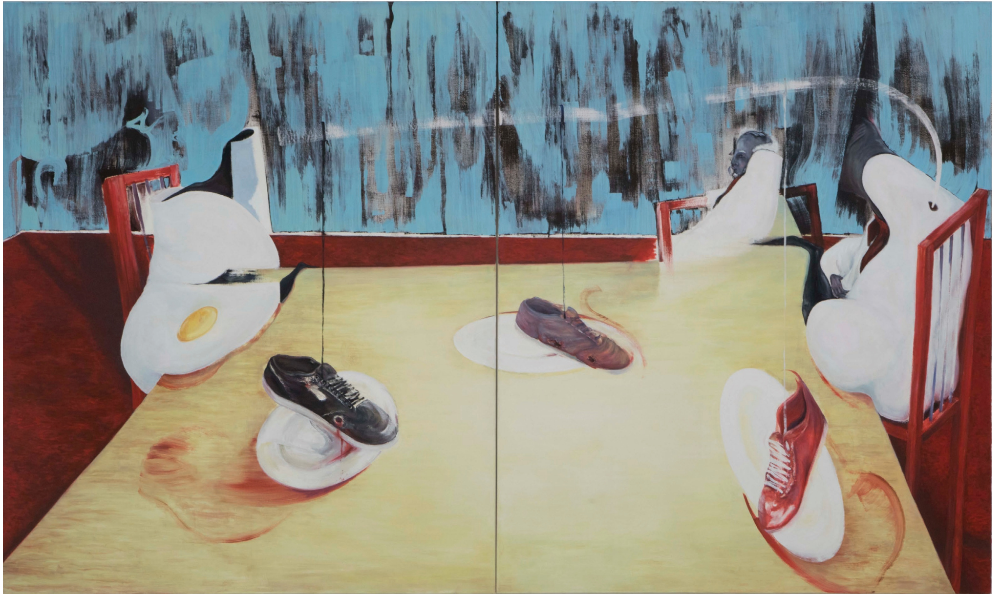
„Die Gegenwärtigen“ (2017) oil on cotton 185 x 310 cm, split