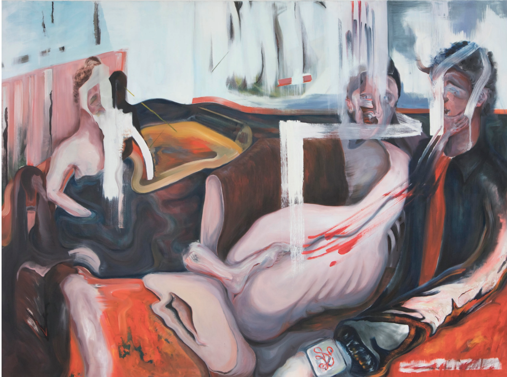
Adapter (2017) oil on cotton 140 x 90 cm