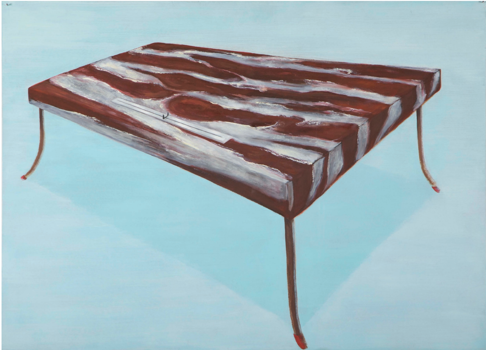
White noise (2018) oil on cardboard 80 x 110 cm