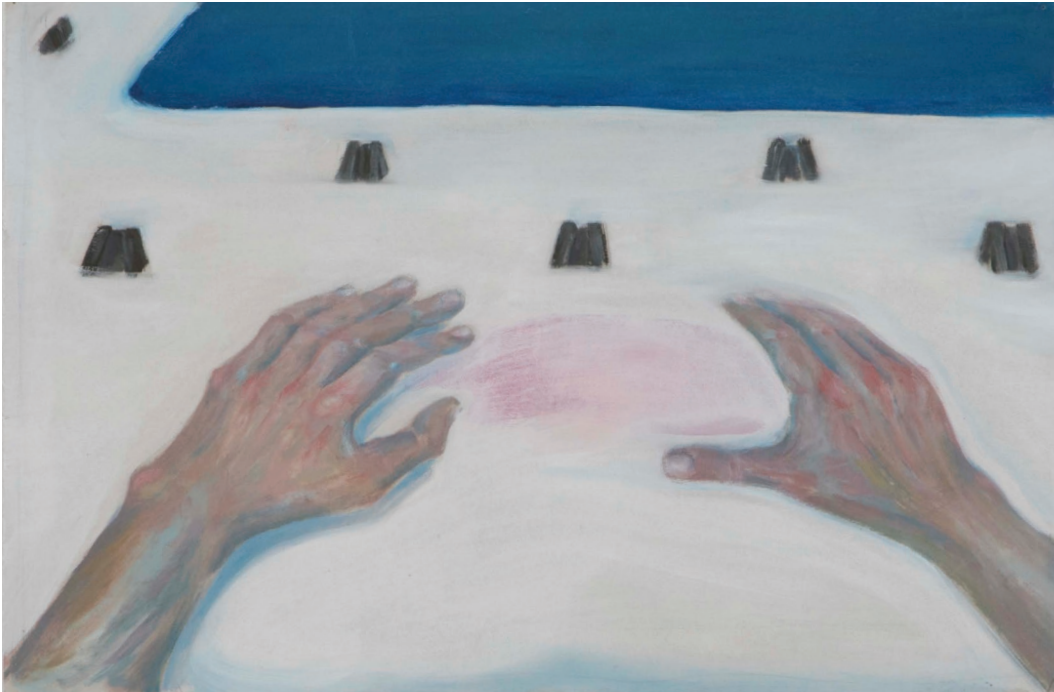
Hello again! (2017) oil & ink on cardboard 48 x 32 cm