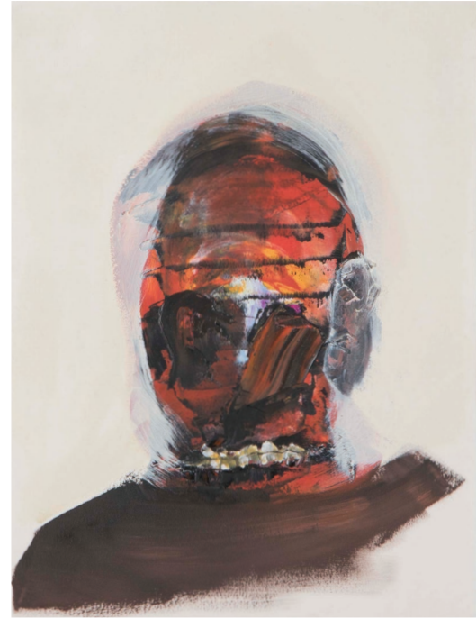
Eiskalte Romantiker (2017) oil on paper 40,8 x 30,8 cm each