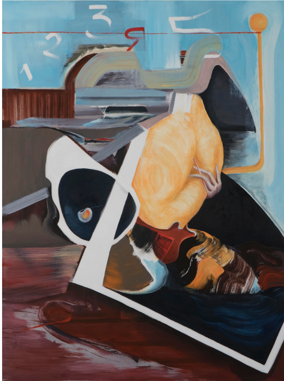
Vollbremse (2018) oil on cotton 120 x 90 cm