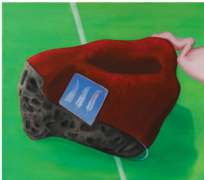
Found your soft spot (2019) oil on canvas 27 x 31 cm