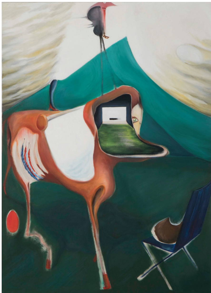
Standgas (2018) oil on cotton 110 x 80 cm