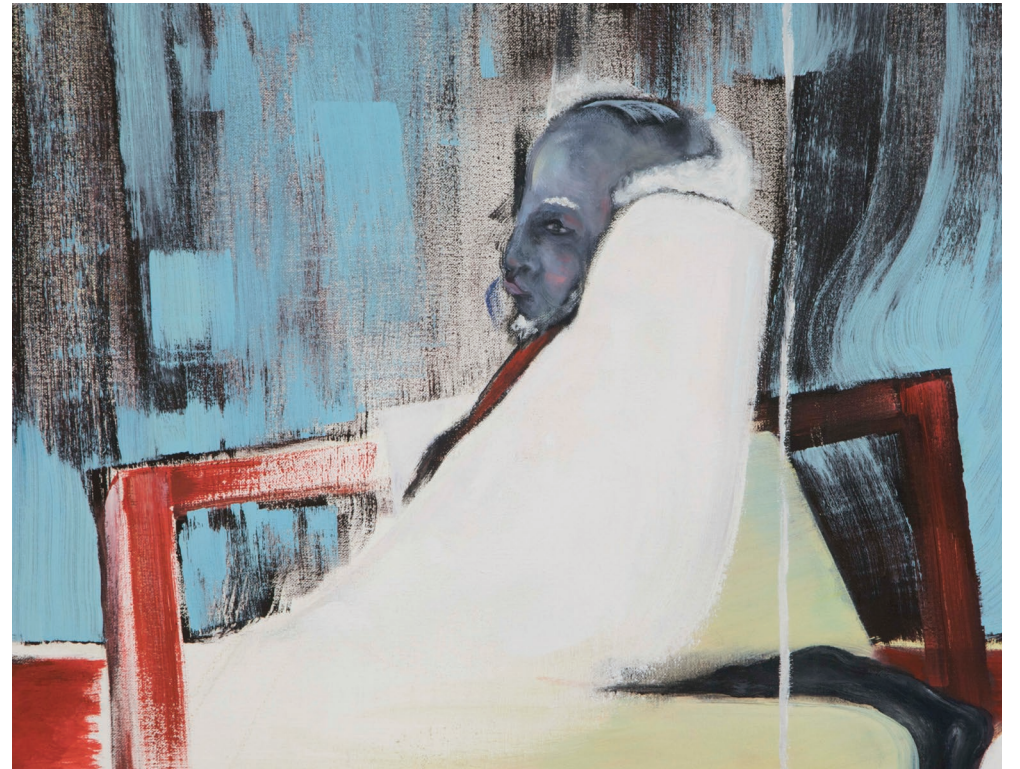
„Die Gegenwärtigen“, details