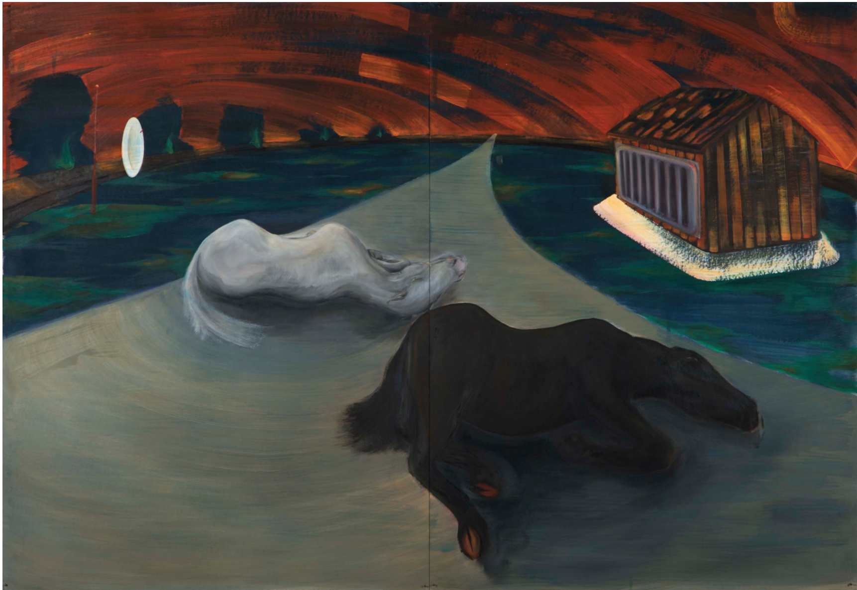
Haarriss (2018) oil & ink on cardboard 110 x 160 cm, split