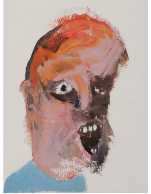
Argumente (2017) oil on paper 31 x 23 cm each