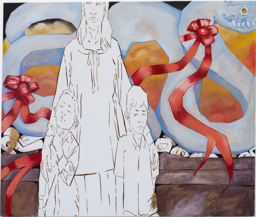
Tastes like a bittersweet mangosteen, 2024 Oil on canvas 190 x 170 cm