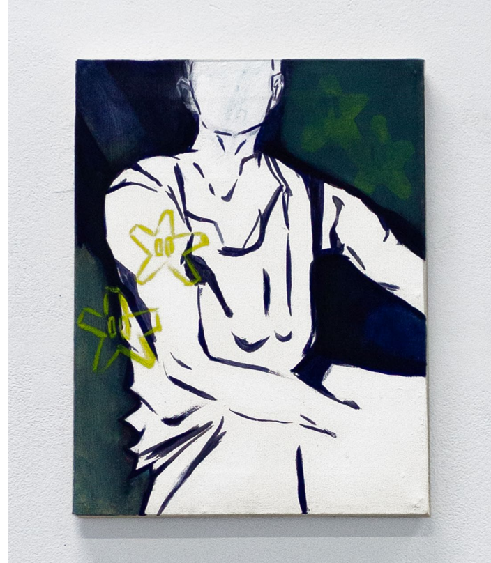
starman, 2023 Oil on canvas 30 x 40 cm