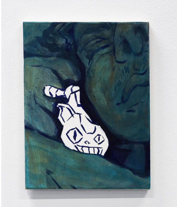
sweet dreams, 2023 Oil on canvas 30 x 40 cm