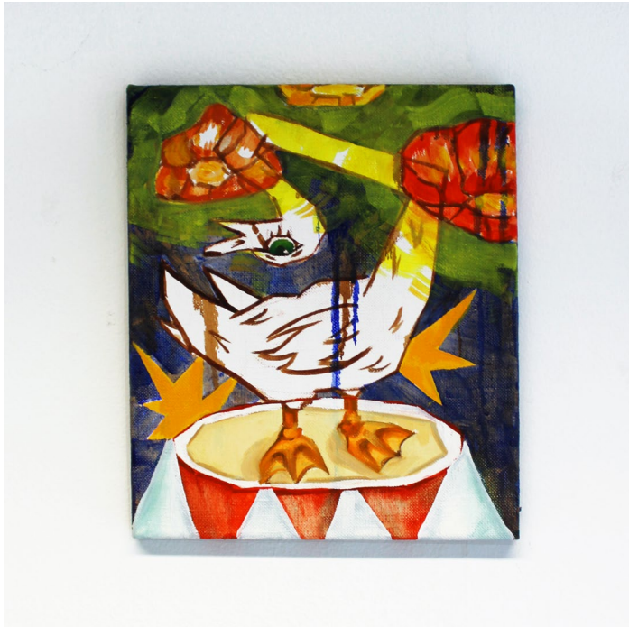
Extravaganza, 2022 Oil on canvas 25 x 30 cm