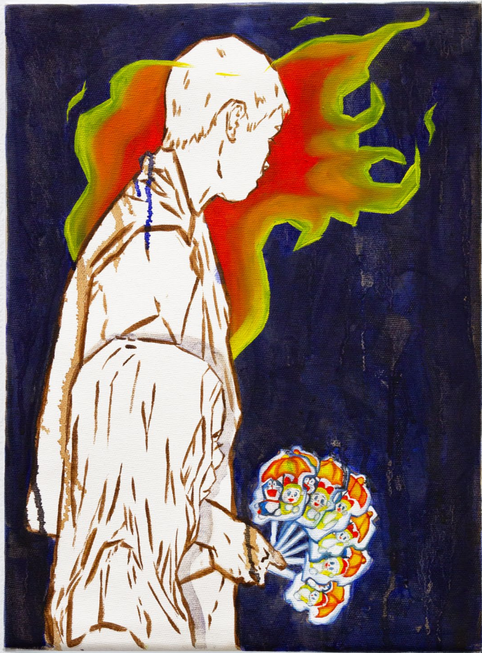
I knew you were a fish on a hook, 2023 Oil on canvas 40 x 50 cm