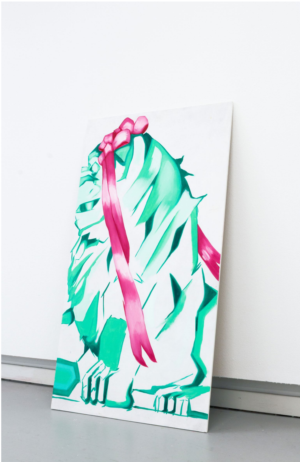
Girlhood (the spirit in me) , 2024 Oil on panel 70 x 30 cm