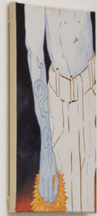
Installation view, 2024 Oil on canvas