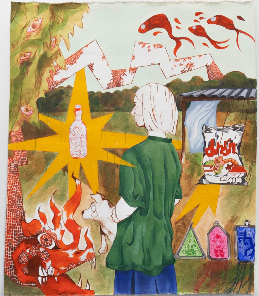
Nong Khai, 2022 Oil on canvas 145 x 170 cm