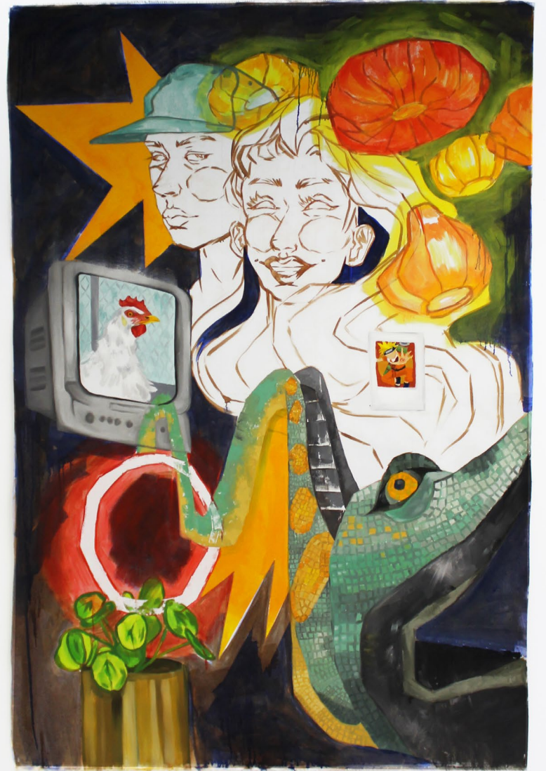
Gruselkabinett, 2022 Oil on canvas 100 x 160 cm