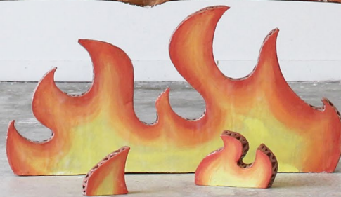
You lasted like a glimpse of light, 2023 Oil on canvas, wood, rope, ceramics 100 x 170 cm, various dimensions