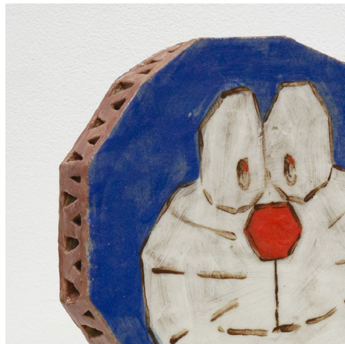
I saw you sin, 2023 Ceramics, Front/Back view 23 x 34 cm