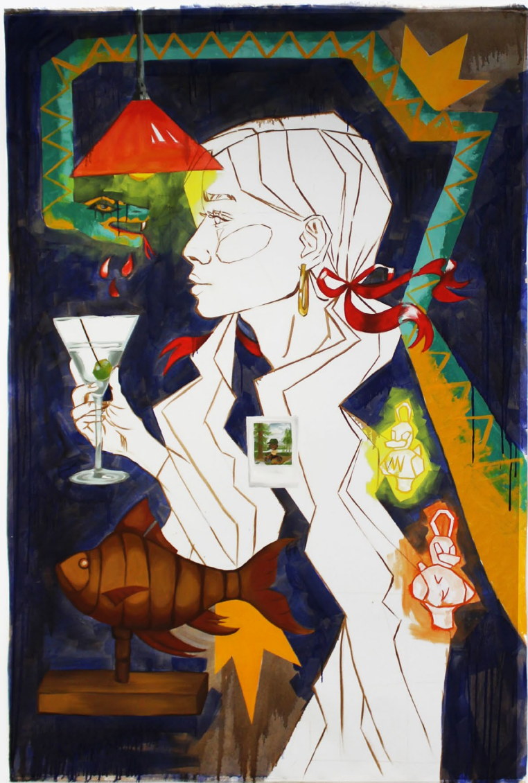
Glücksspiel & kandierte Äpfel, 2022 Oil on canvas 100 x 160 cm