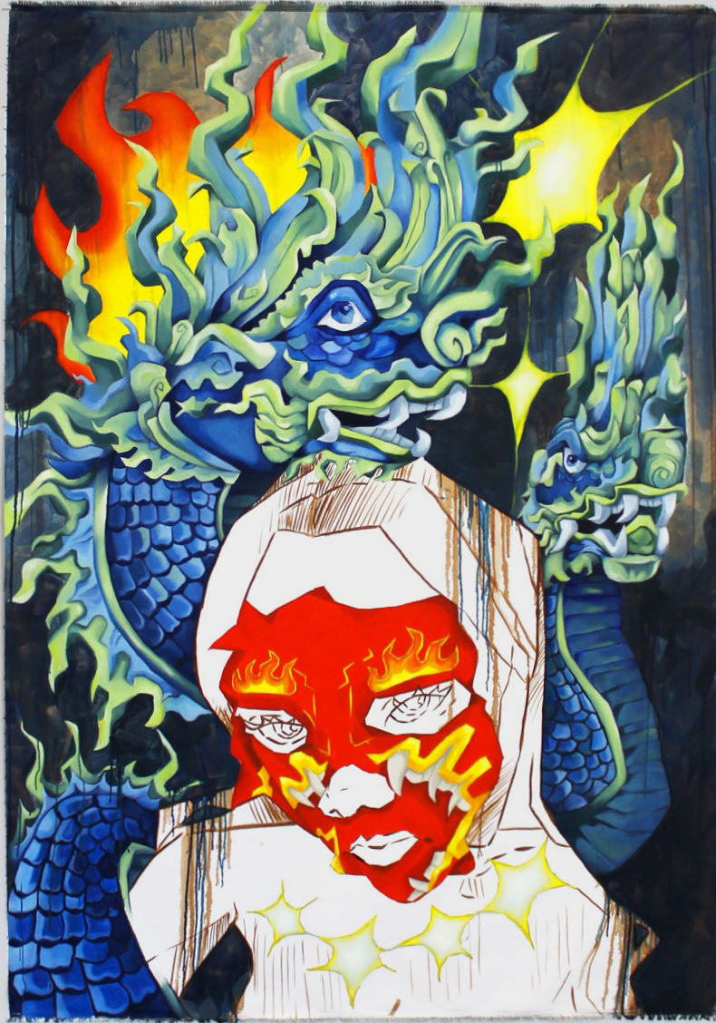
I got my heart an armor, 2023 Oil on canvas 160 x 110 cm