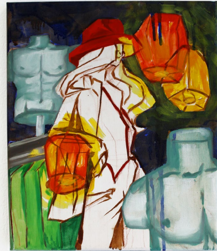
Spiegellabyrinth, 2022 Oil on canvas 25 x 30 cm