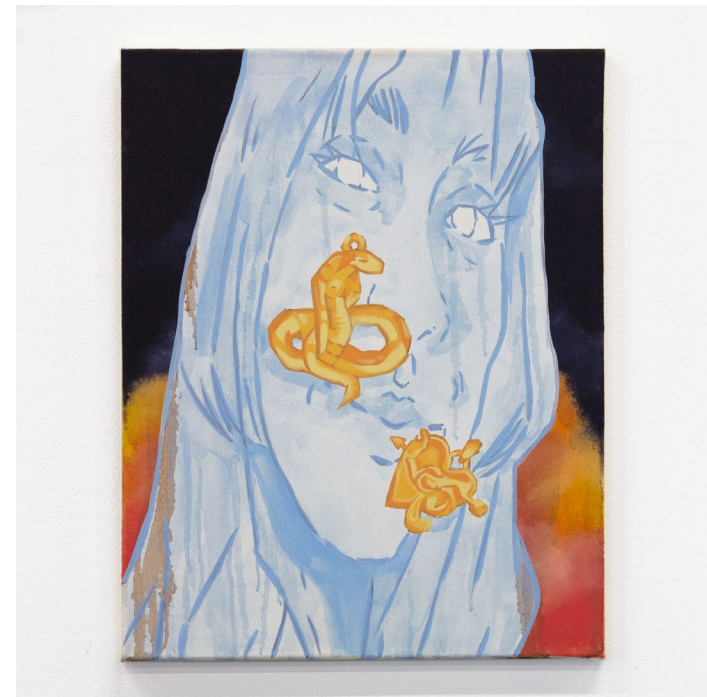
Nong, 2024 Oil on canvas 50 x 40 cm