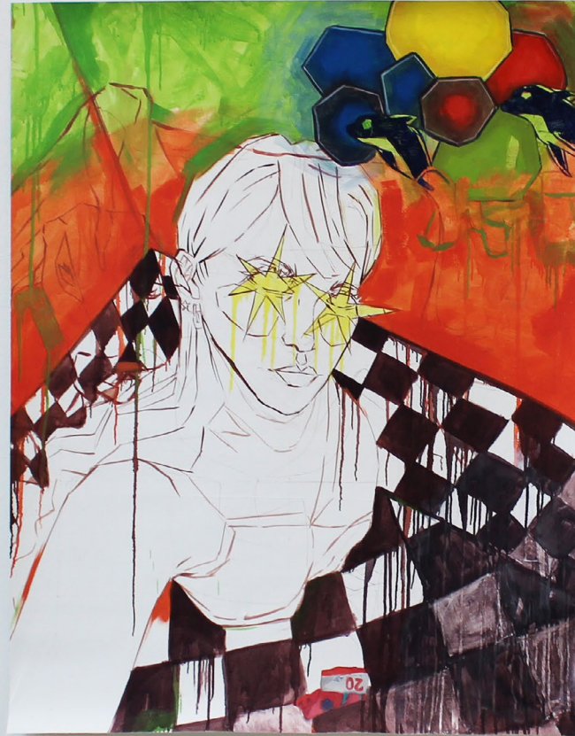
Patong fever dream, 2023 Oil on canvas 100 x 130 cm