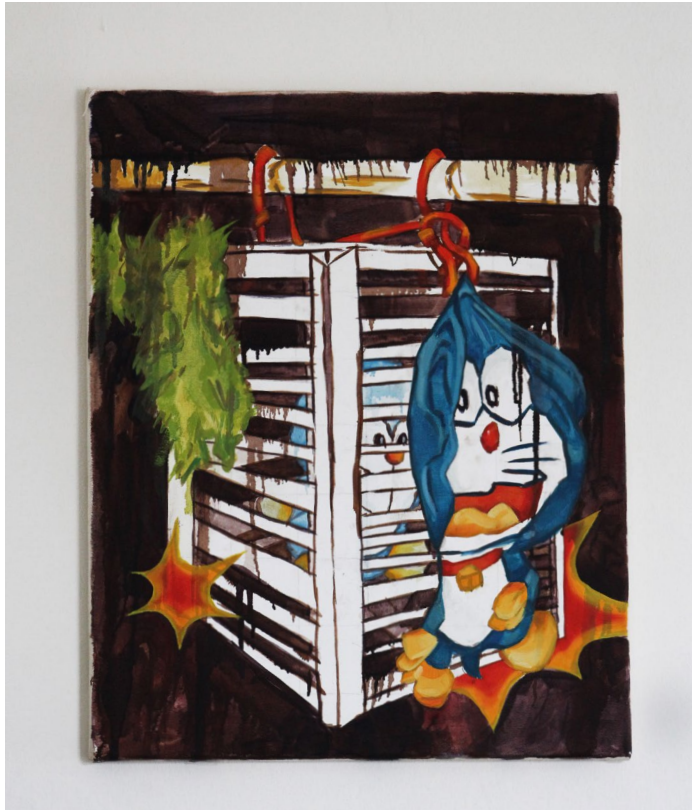
You and your silly secrets, 2023 Oil on canvas 40 x 50 cm