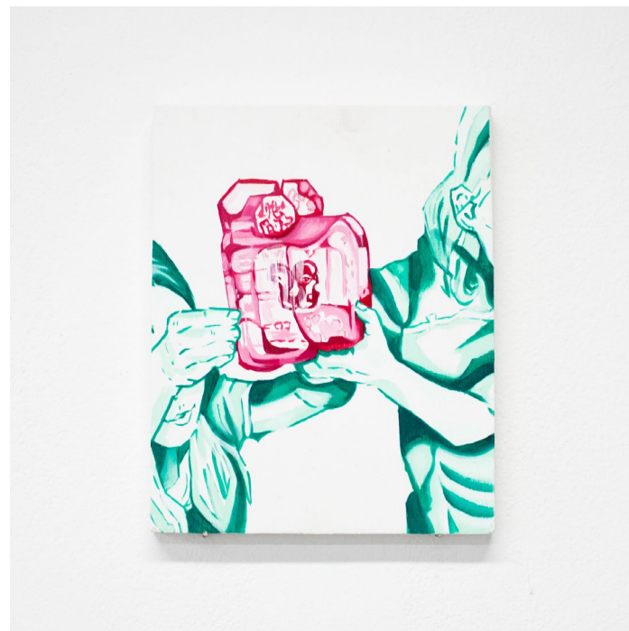
Girlhood (special edition) , 2024 Oil on panel 22 x 18 cm