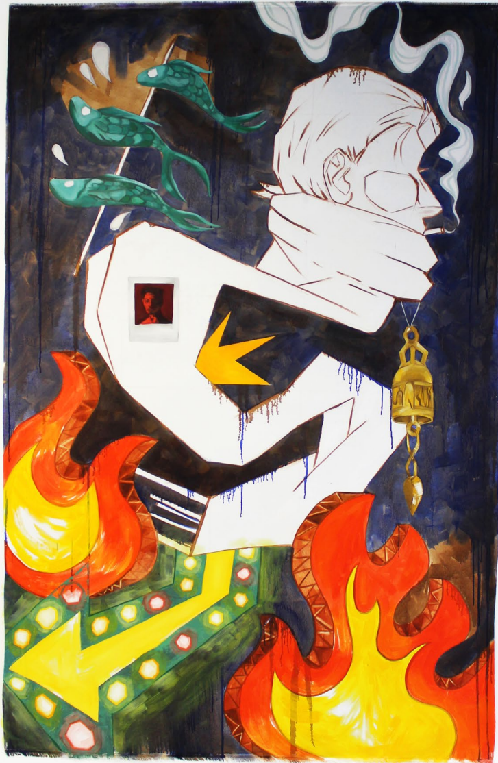
Feuerspucker, 2022 Oil on canvas 100 x 160 cm