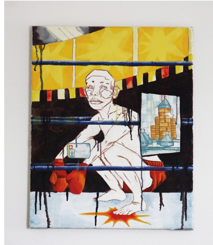
Good Money, 2023 Oil on canvas 40 x 50 cm