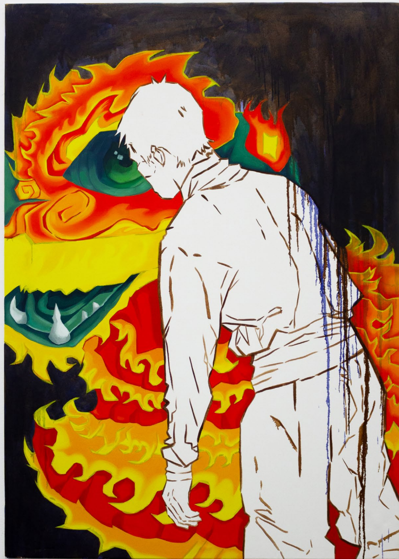
Darling, I'm home, 2023 Oil on canvas 140 x 100 cm