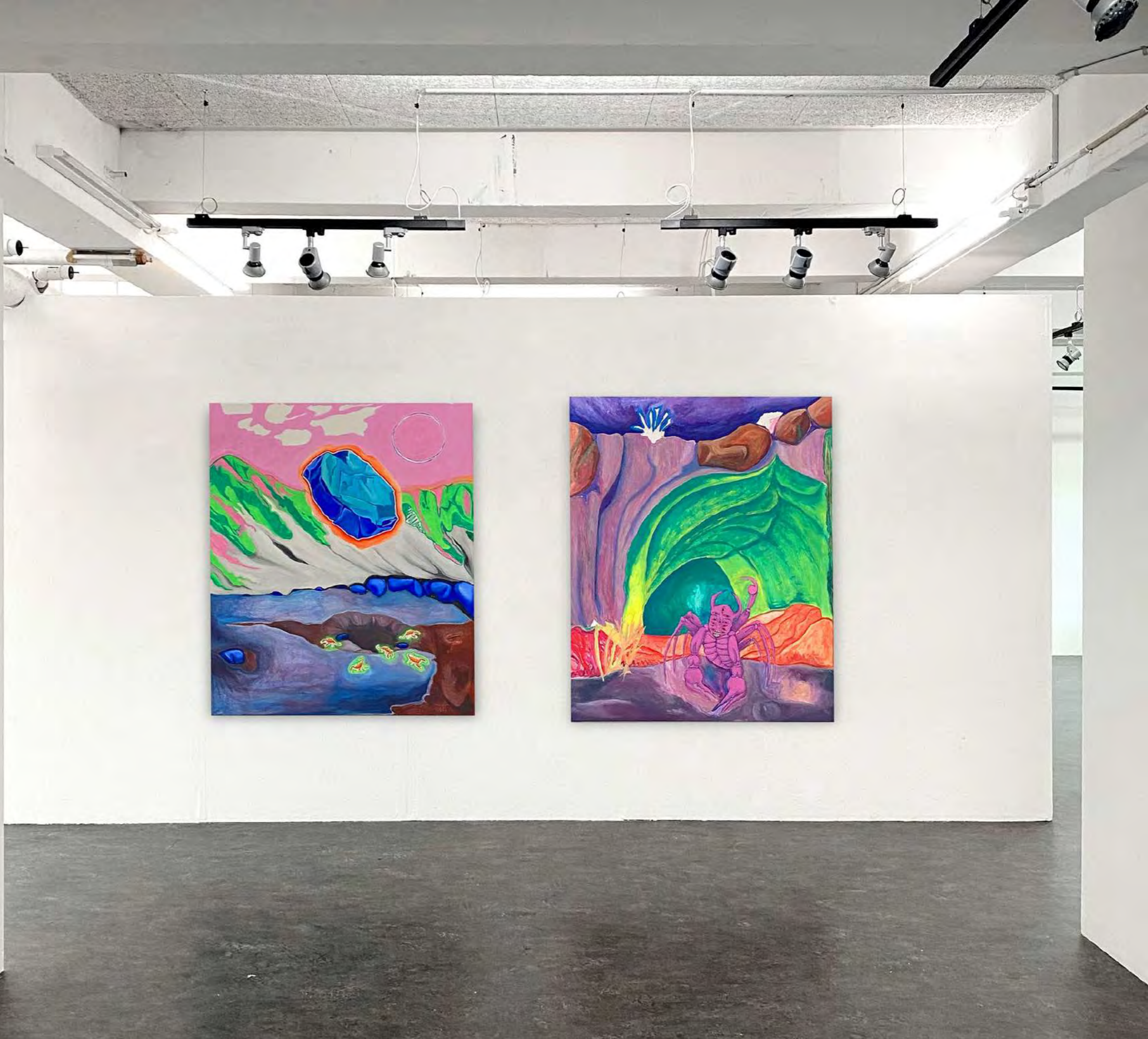
Scorpiogirl 2023 Gouache, oil pastel, coloured pencil on canvas 160 x 135 cm