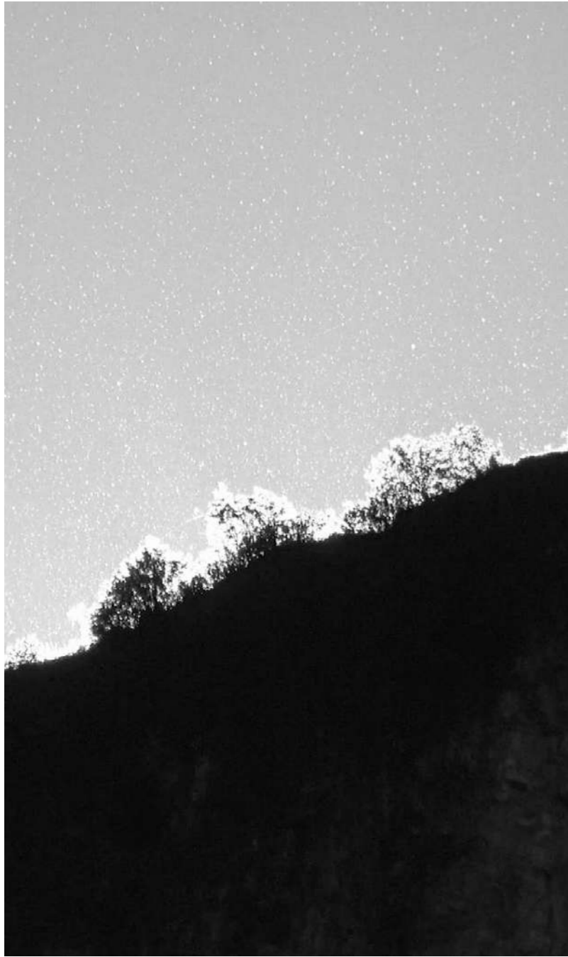
when did we disconnect 2024 (ongoing) Short video (3 min, 4K, 9:16) youtu.be/mat8dIWrwNw