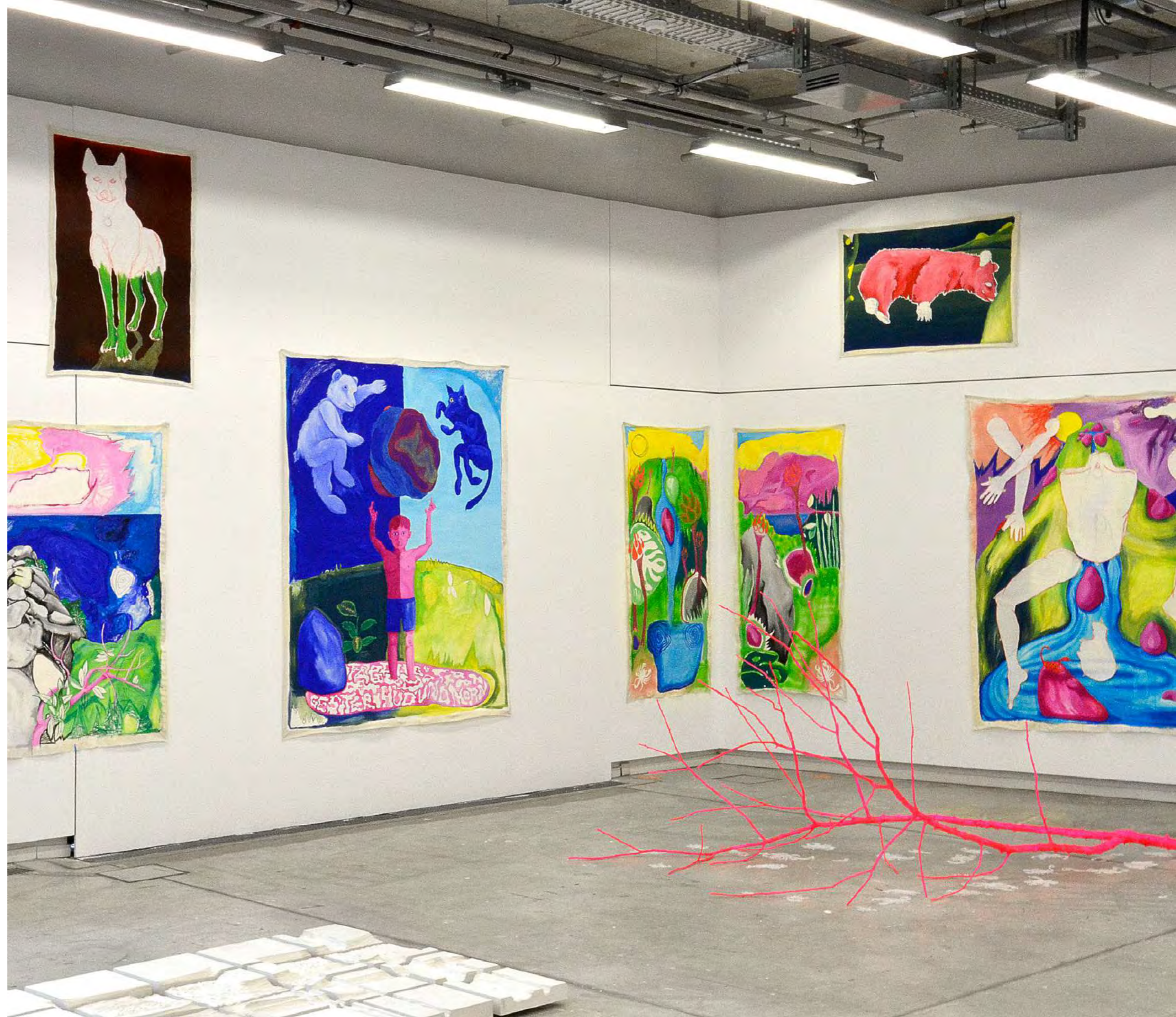
Gester, Hüd und Morn (Yesterday, Today and Tomorrow) 2022 Installation overview, Bachelor Diploma exhibition, Zurich University of the Arts is.gd/sUy3uA