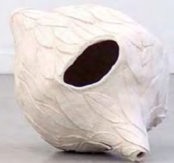
Ceramic sculpture Apprx. 30 x 30 x 40 cm