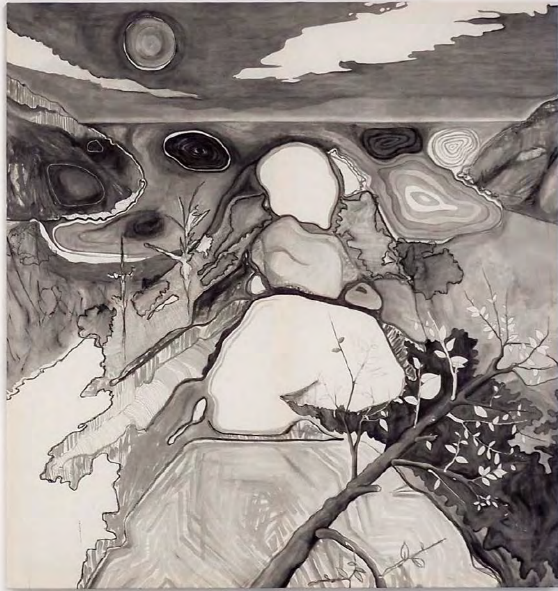
Untitled 2023 Gouache, oil pastel, pencil on unprimed canvas 165 x 160 cm