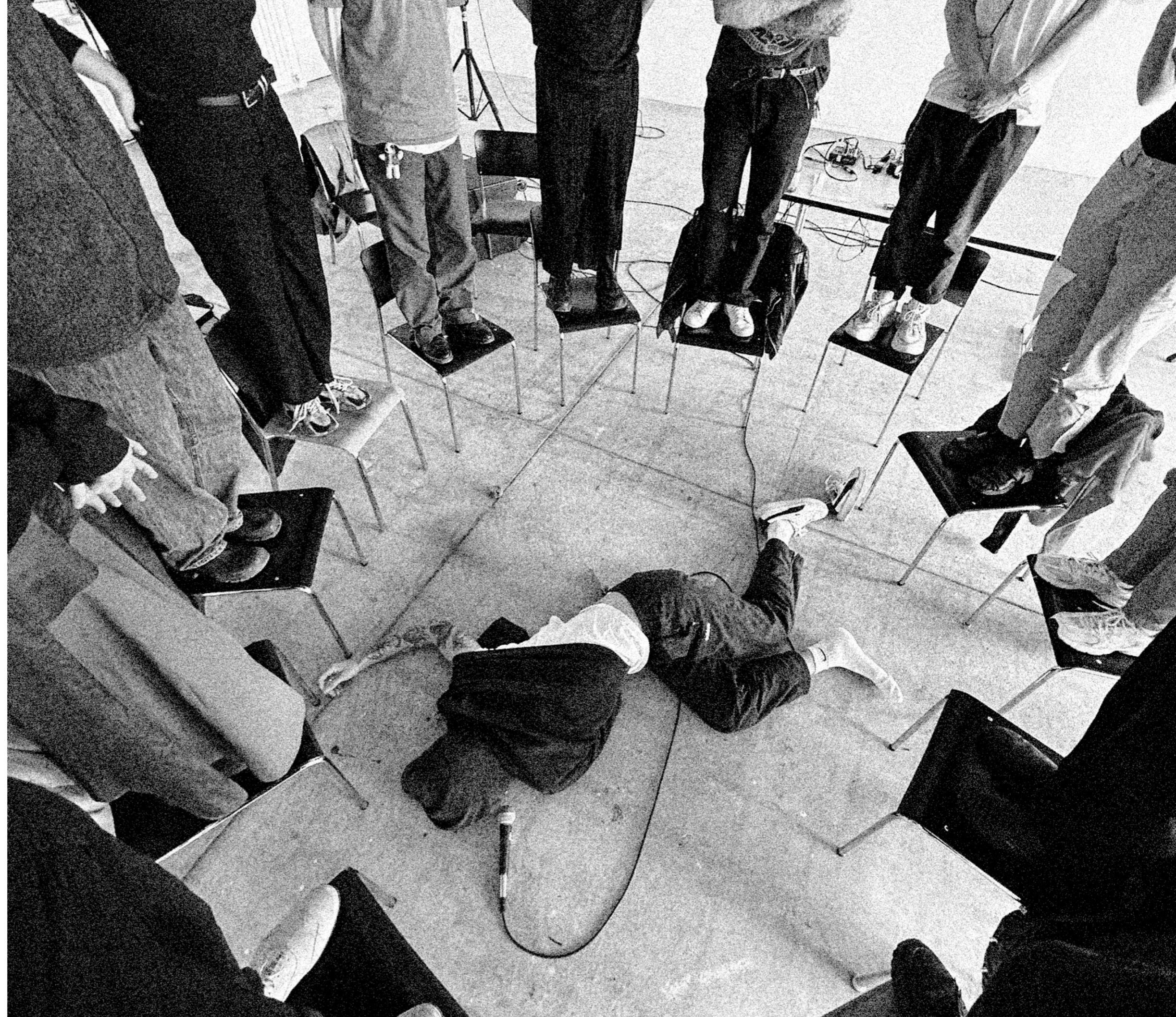
Garden 2023 Reading—Performance