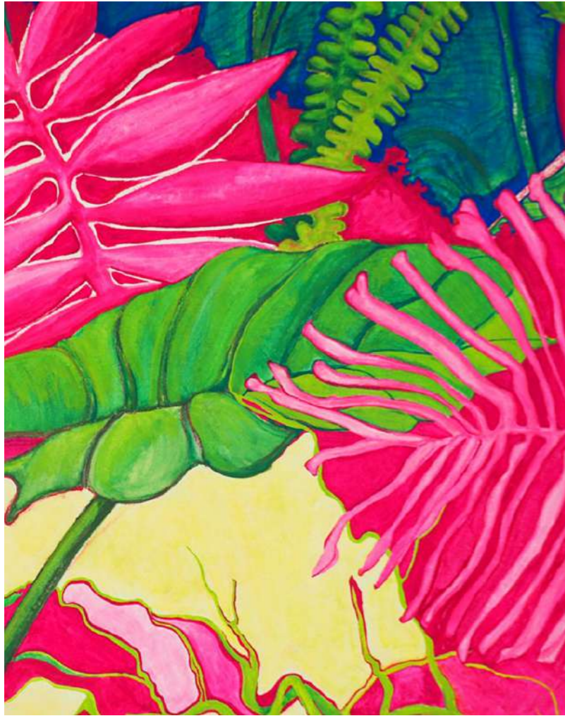
Scorpio Shell 2024 Gouache, oil pastel, coloured pencil, embroidery on canvas Approx. 185 x 95 cm (each)