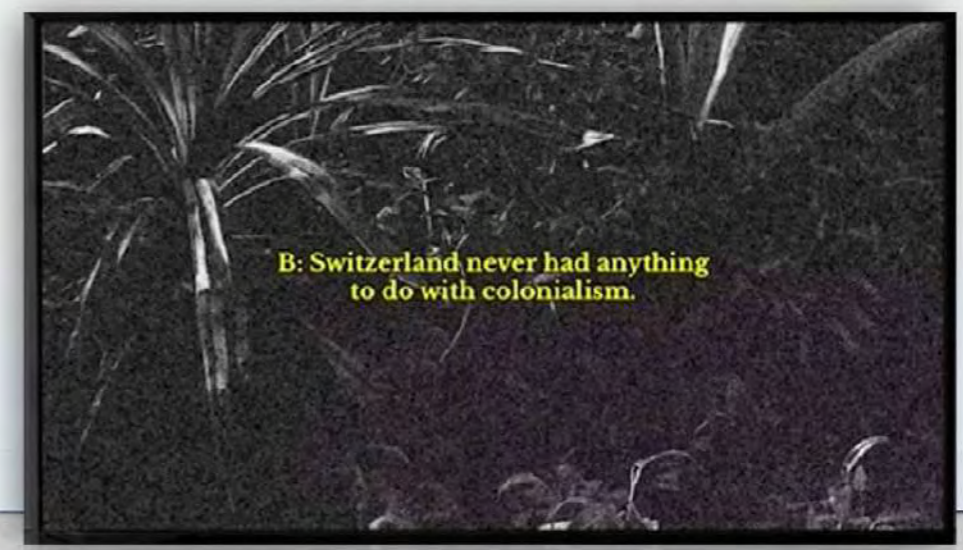
Switzerland – Amnesia of its own colonial past. Interweaving of the Past, Present and Future. 2022 Videoinstallation (10 min, HD, 16:9) youtu.be/1WT0_VFSTWg