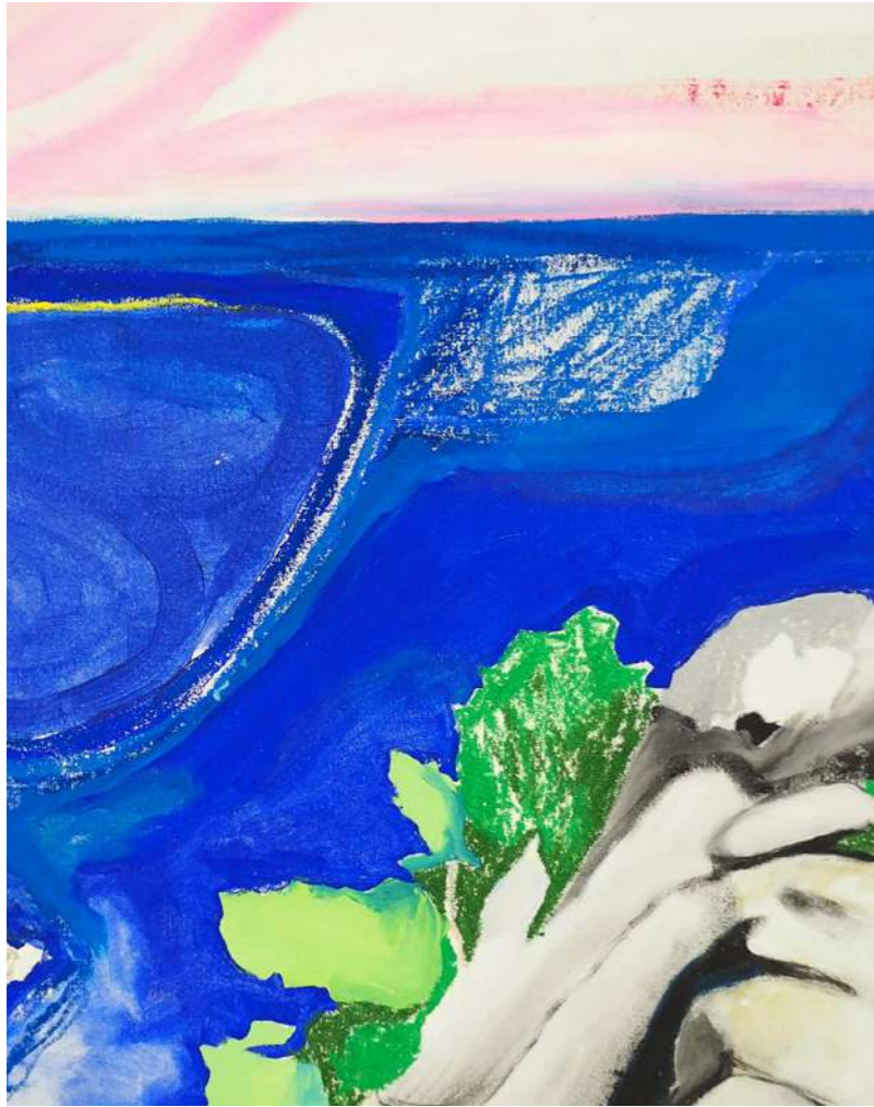
Source 2021 Gouache, oil pastel, coloured pencil on canvas 150 x 150 cm