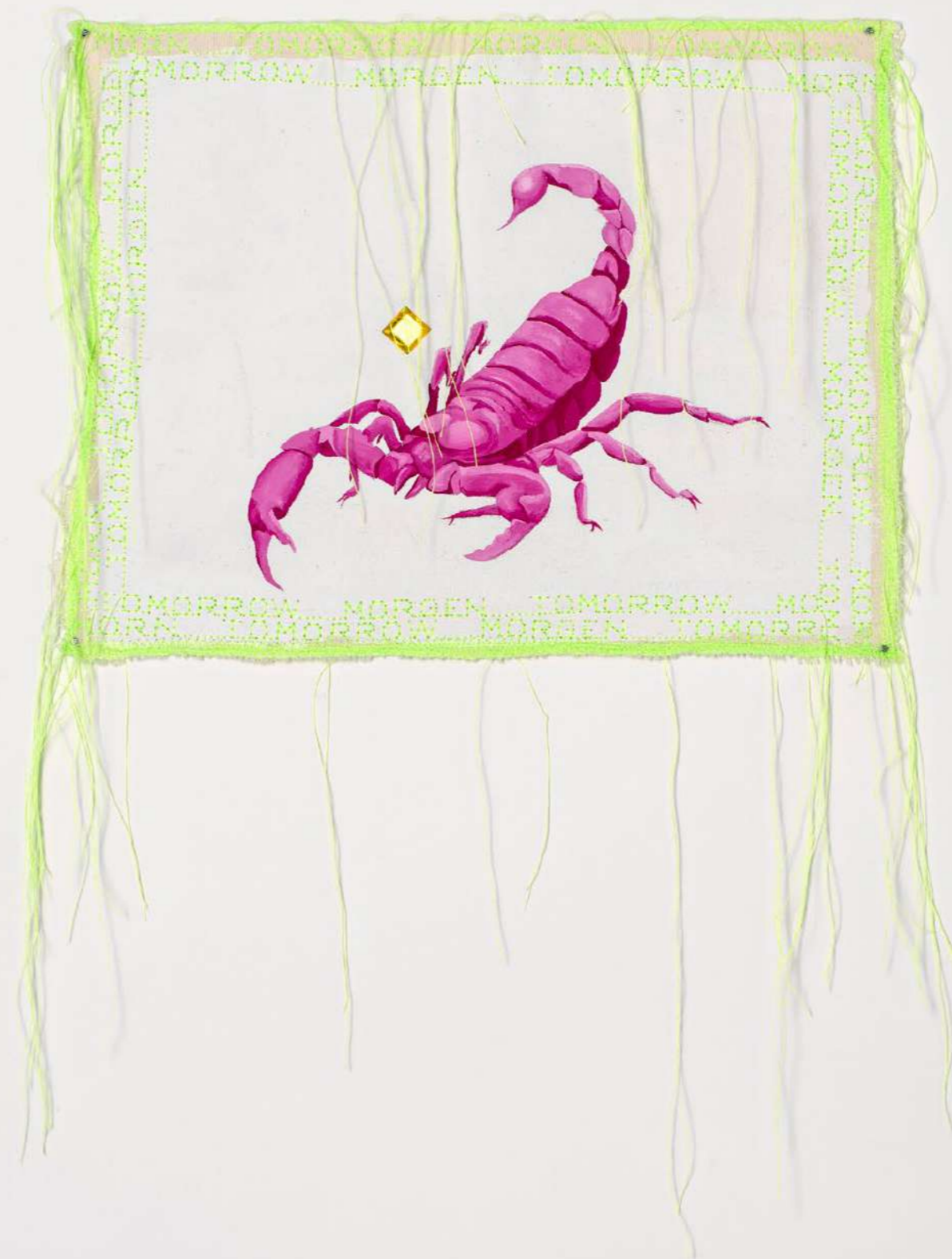
Morn Tomorrow Morgen 2022 Gouache, embroidery, rhinestone on canvas 20 x 26 cm (40 x 26 cm)