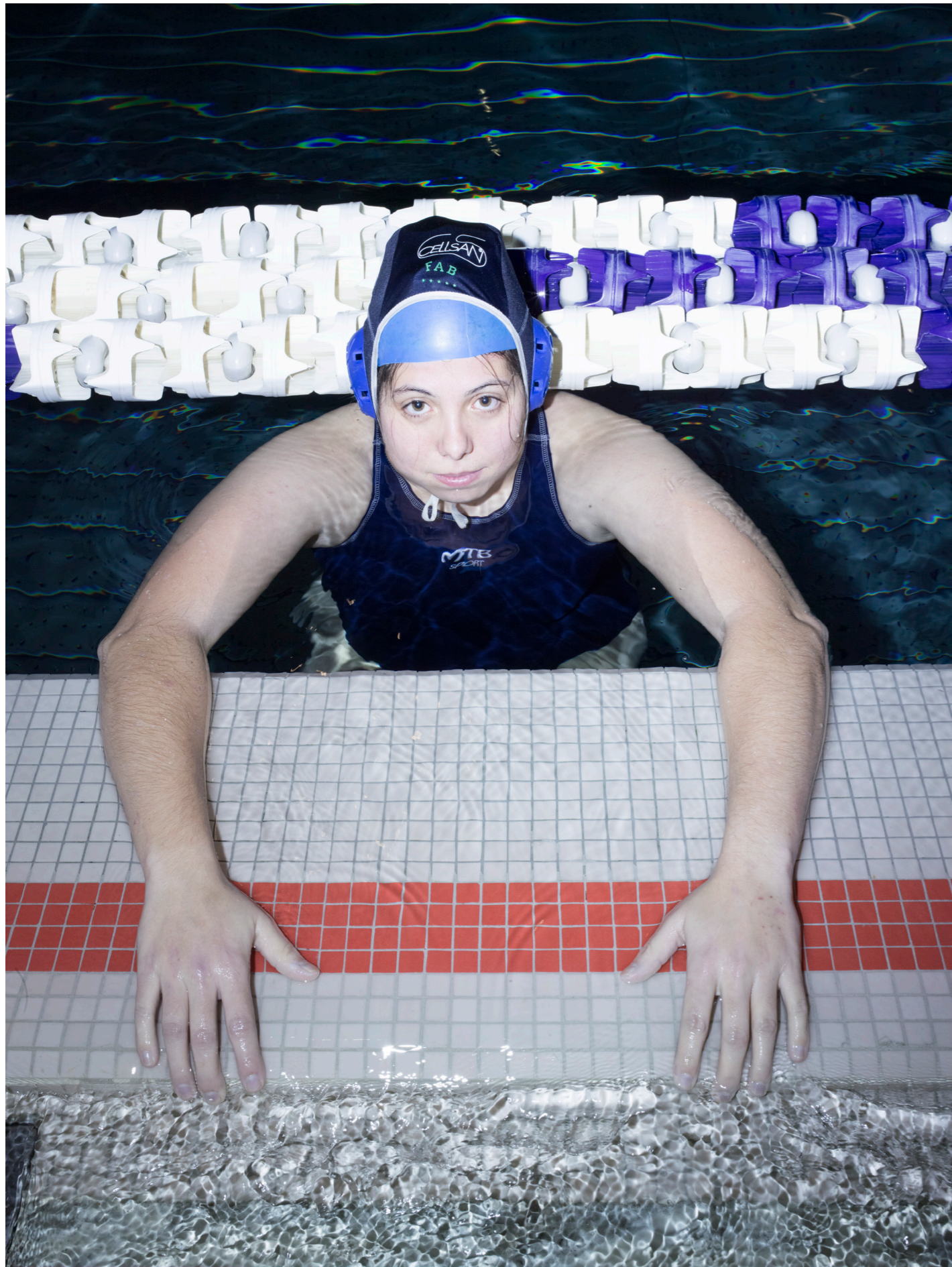
A girl, a woman. Waterpolo. The body.