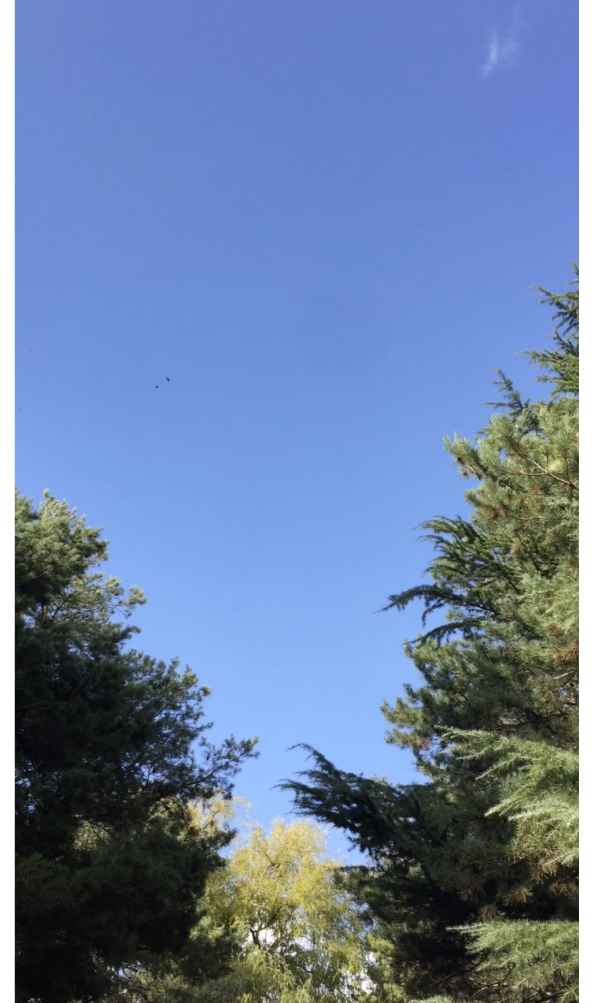
Butterflies freely flying over the unofficial border between the Russian enclave South Ossetia and the little Georgian village Zemo Nikozi. “...Colorful Butterfly, fly away slowly... Don’t fly closer, don’t fly far away.” This traditional children song Chrelo Pepela is well known by all the generations of Nikosi. In an interview they explain the meaning of it.