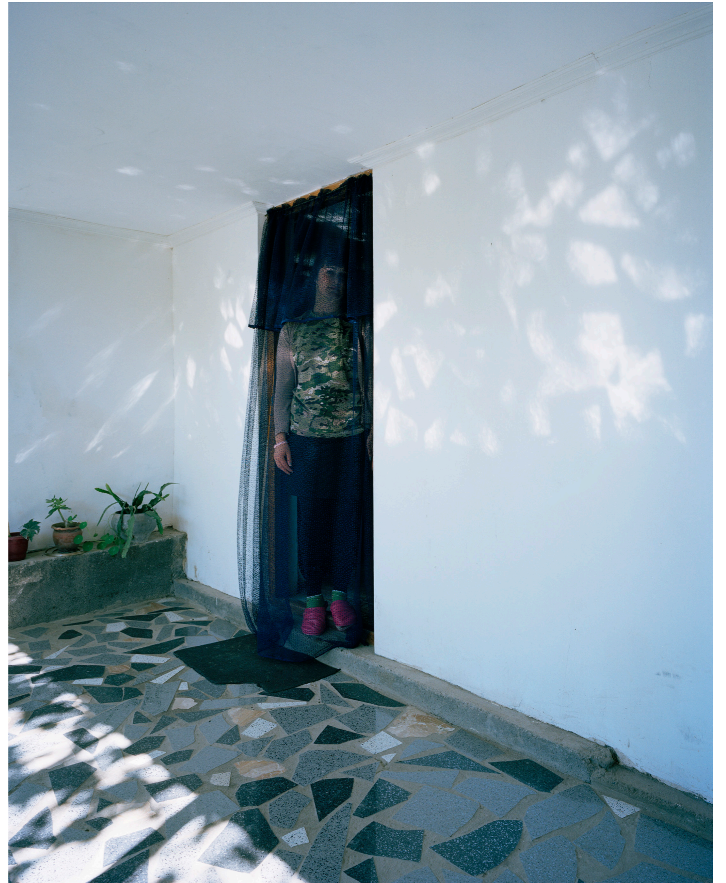
In the province of Georgia, while the husband goes voluntary to Afghanistan, the woman stays... at home.