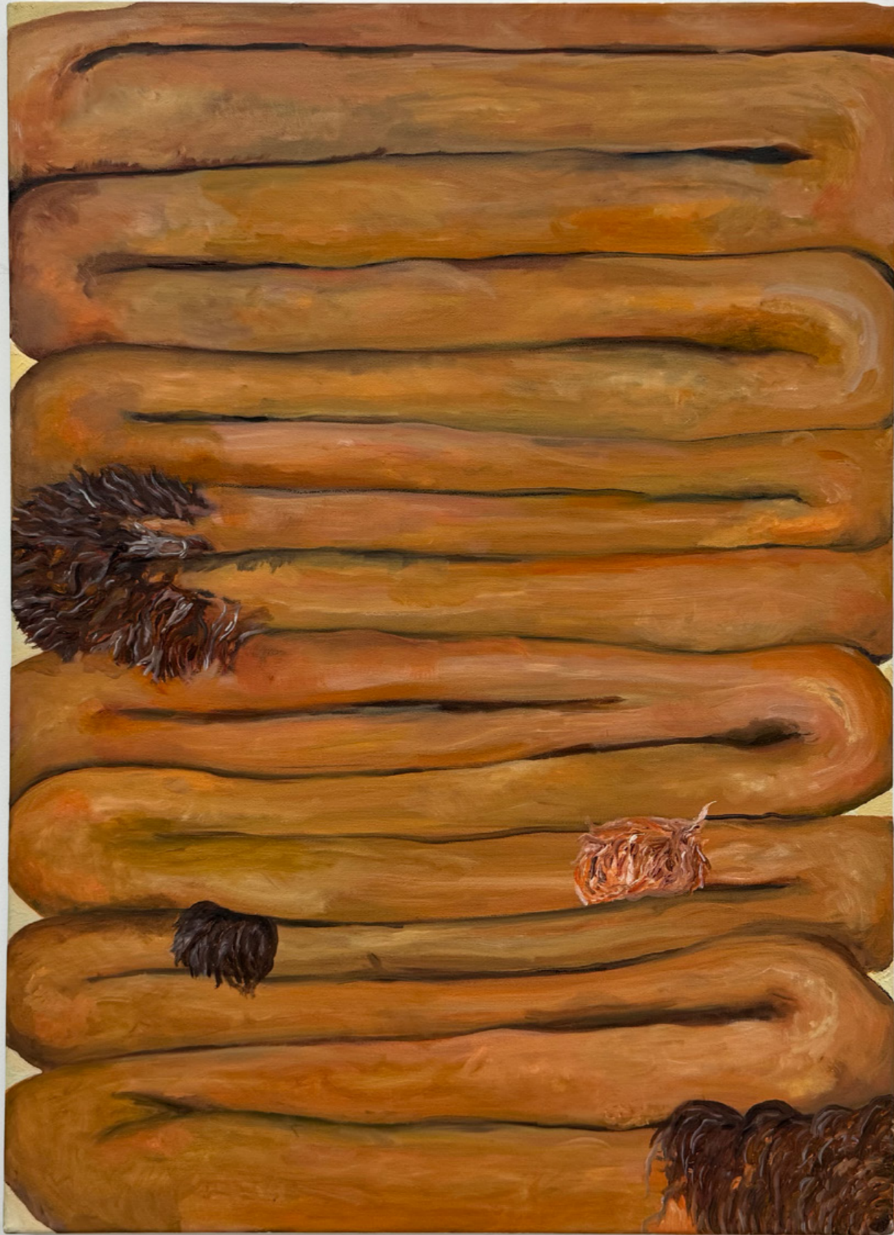
Whirlpool Mom, 2023