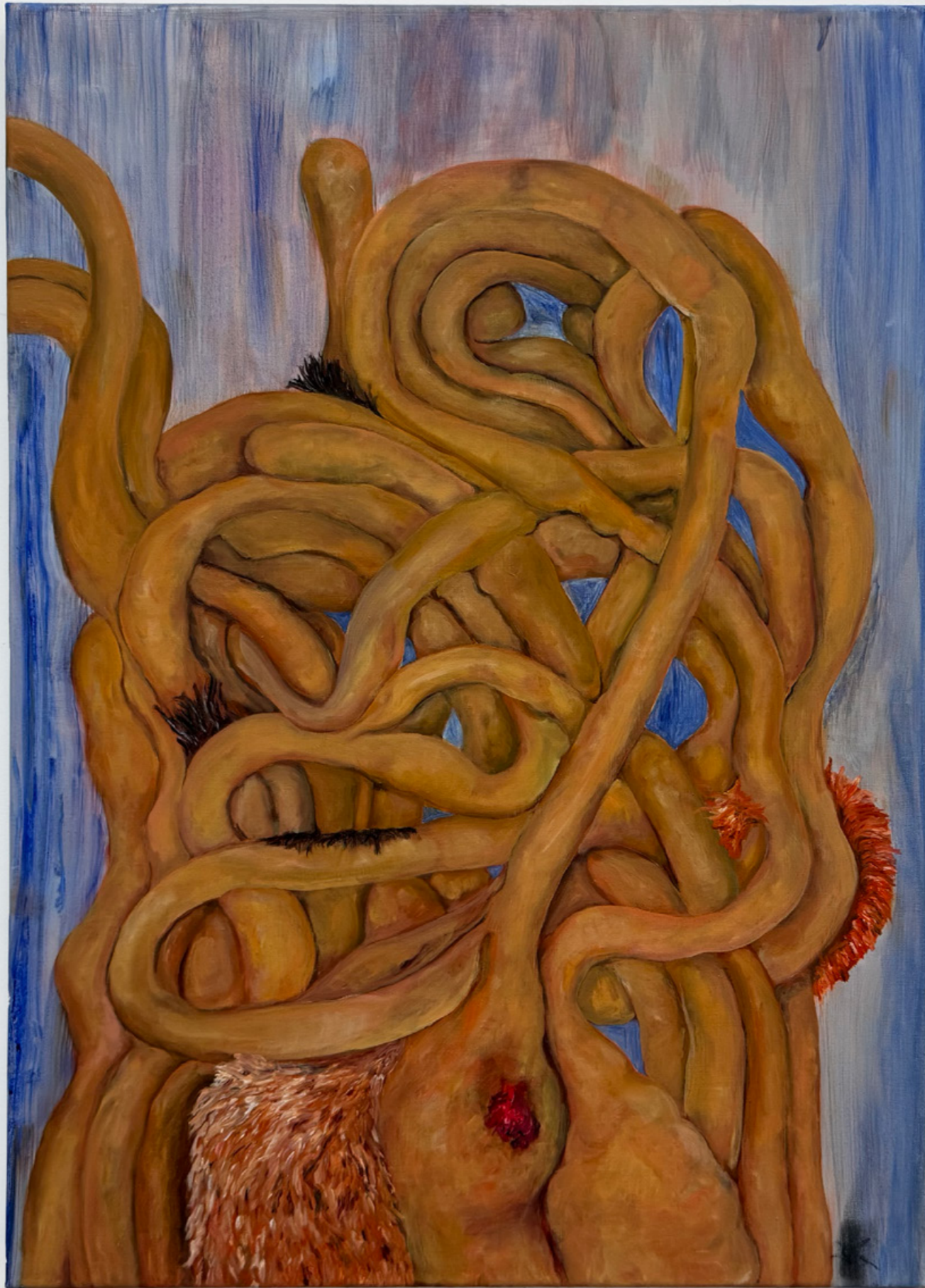
Whirlpool Mom 2, 2023