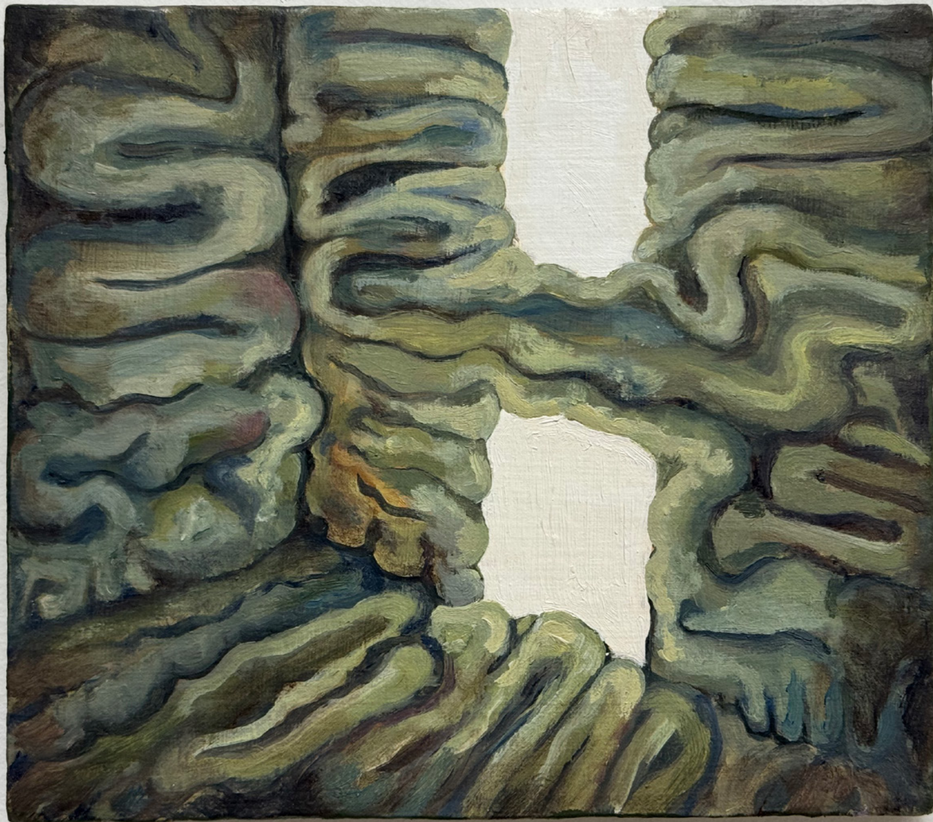
Whirlpool #3, 2023 Oil on canvas on plywood 21 x 18 cm