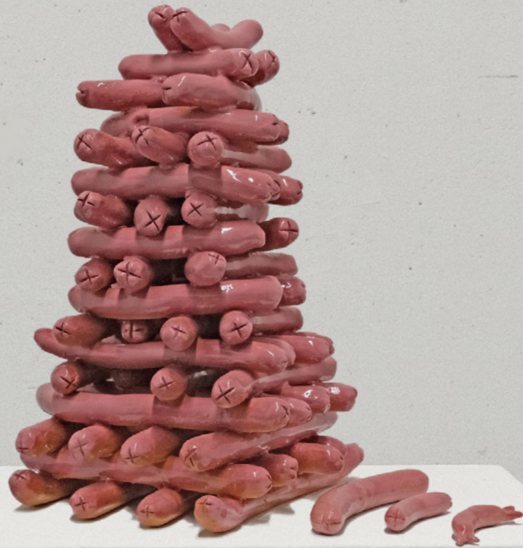
Neighborhood Extract A, 2024 Glazed stoneware 30 x 18 x 18 cm