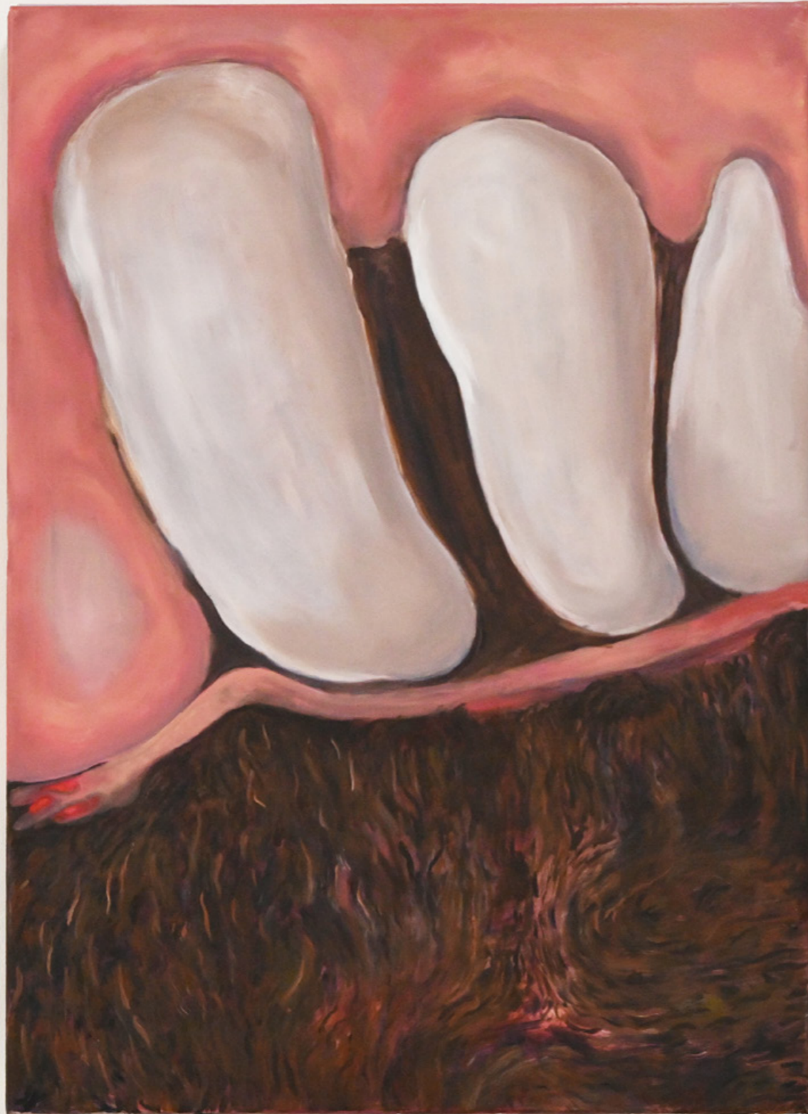
Transversal Paw, 2024 Oil on canvas 70 x 50 cm