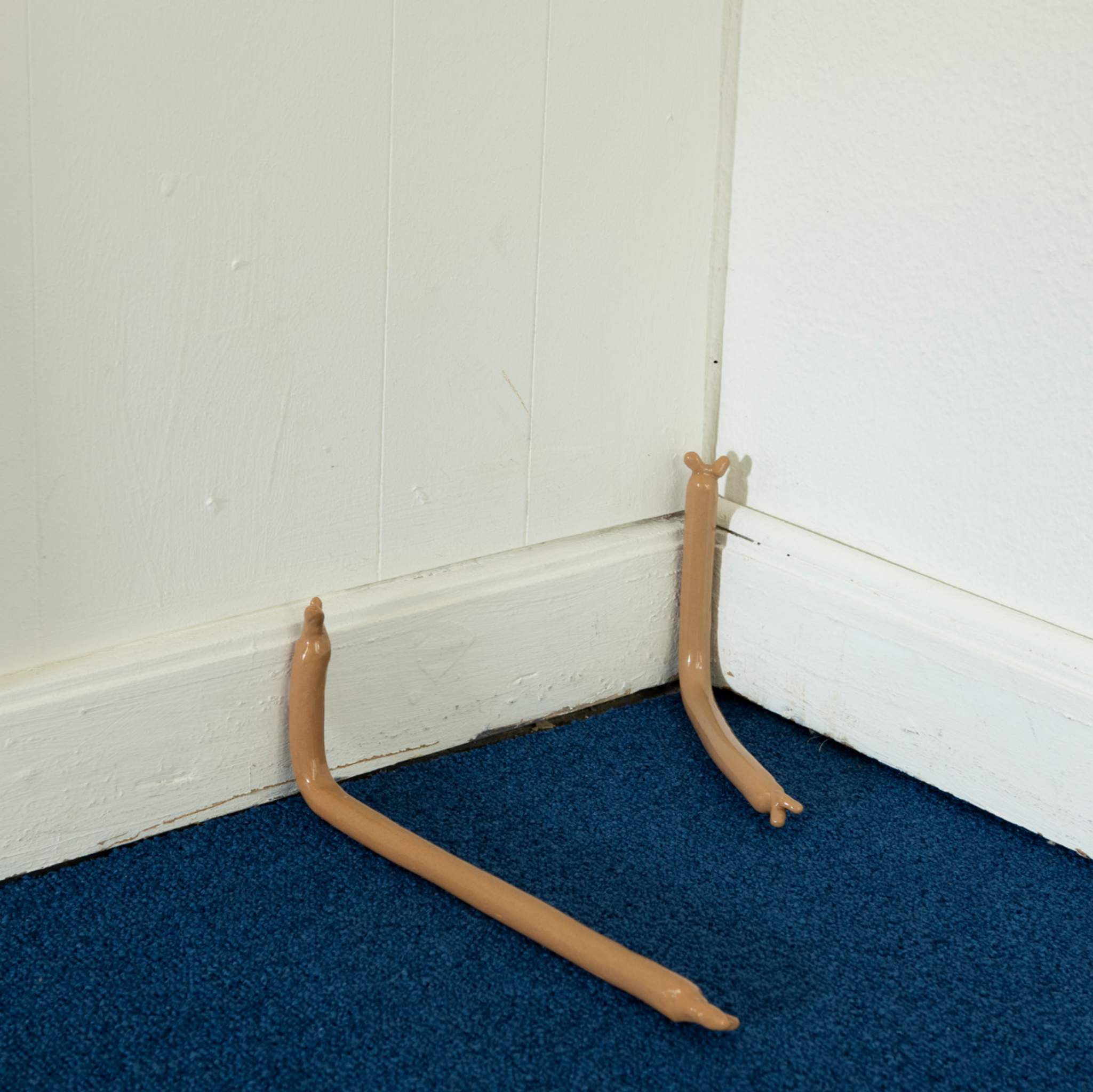
Salchicha 6 & 7 (sunday brunch), 2024 Glazed stoneware Variable Measures Installation view Soup Show , Hotel Tiger