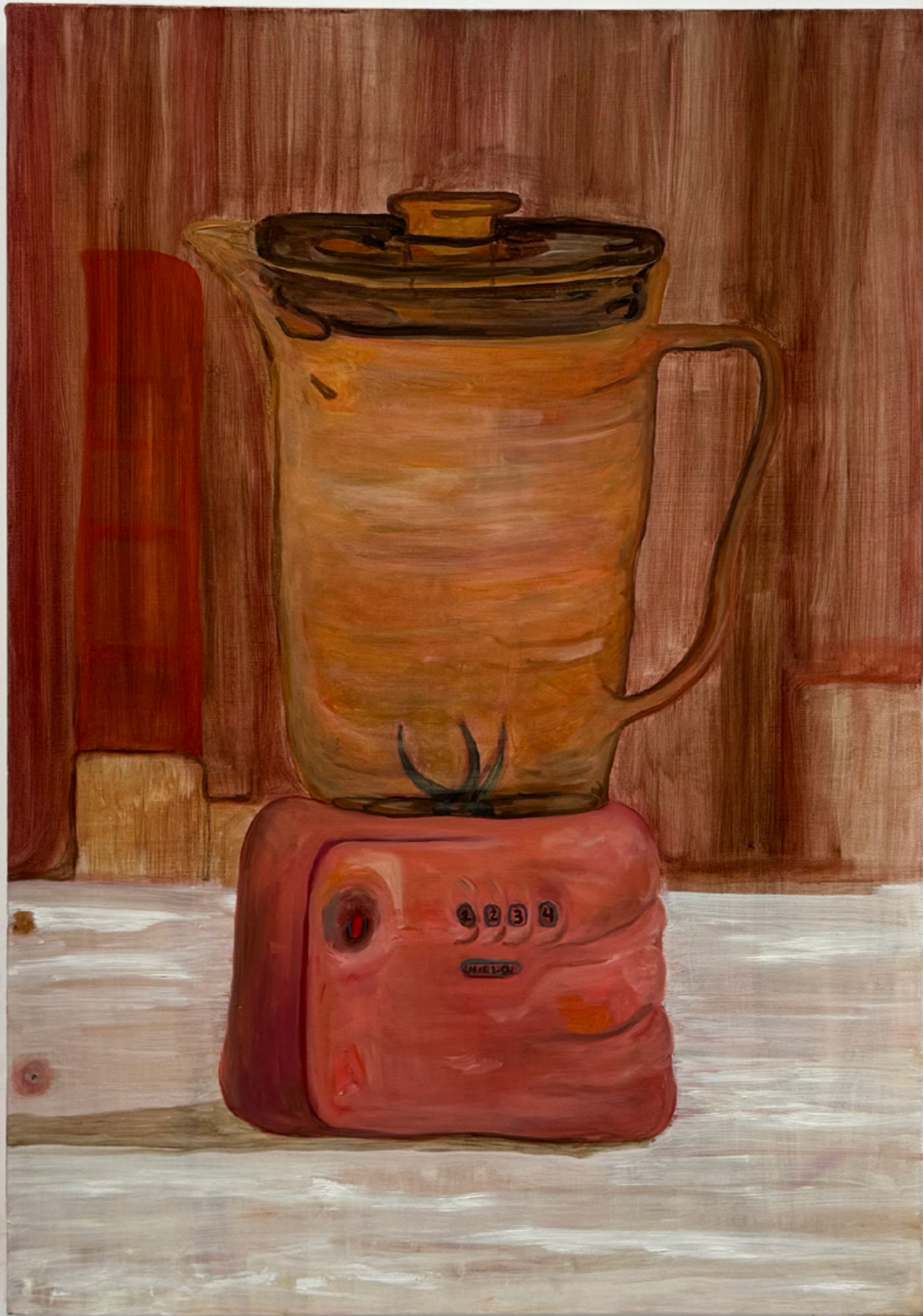
I don't remember who gave me this, 2022 Oil on canvas 110 x 70 cm