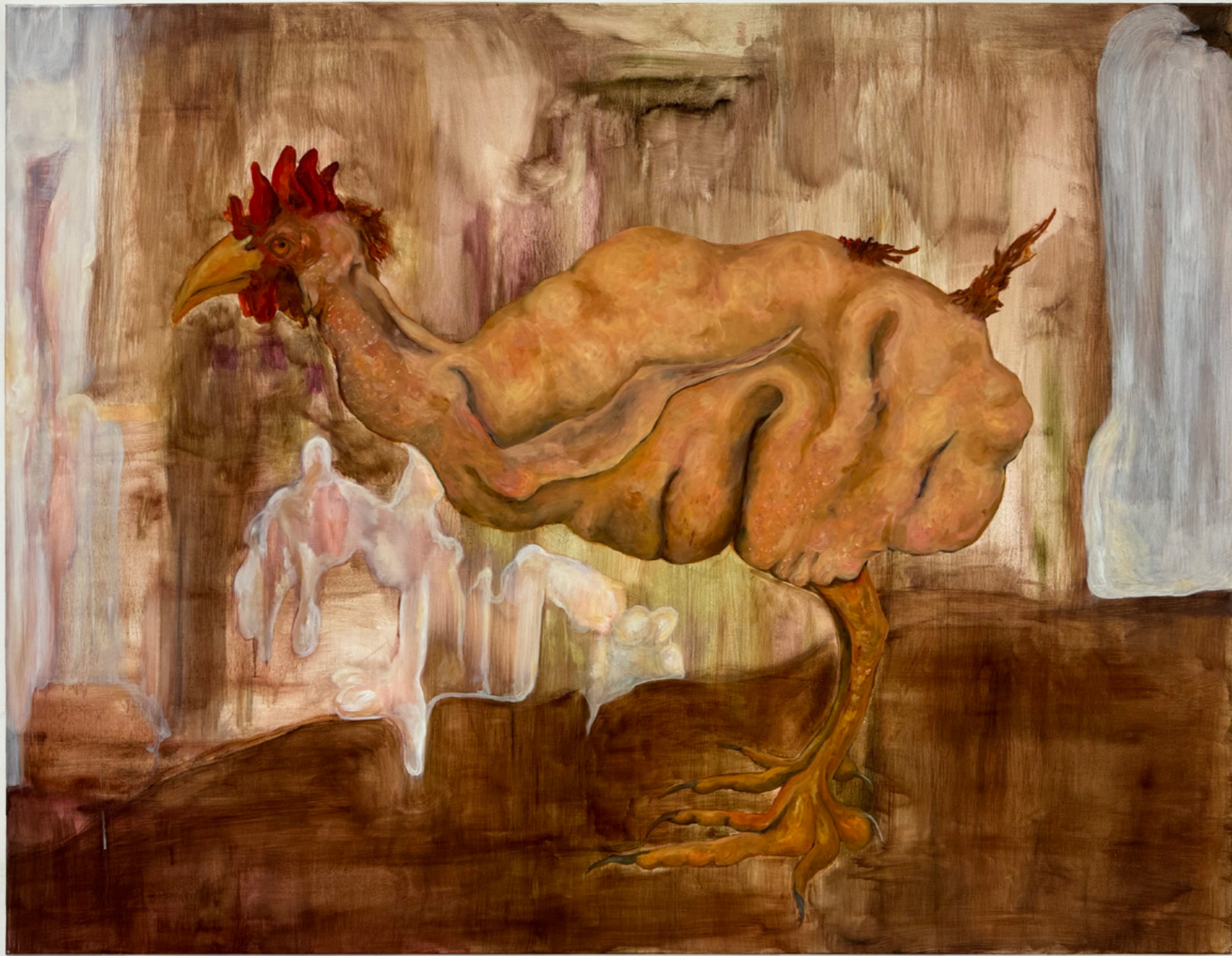
Fried In and Out, 2023