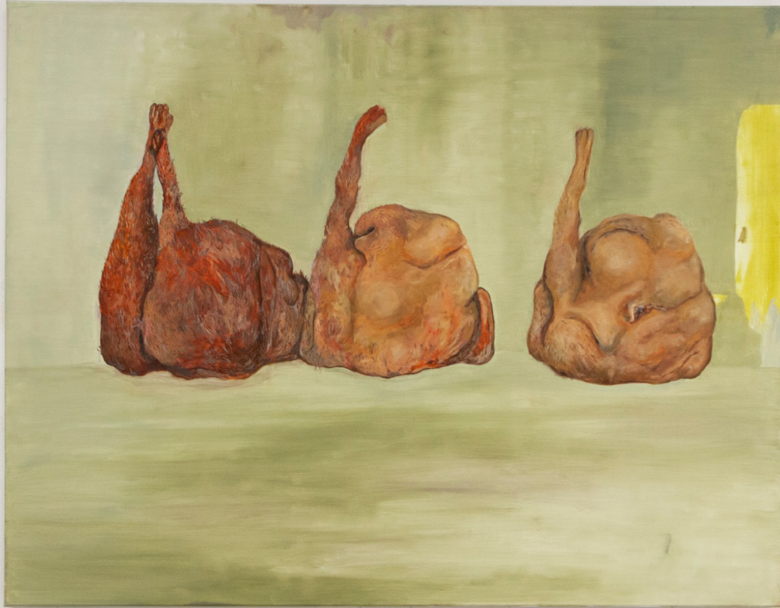
Roasted and Crispy, 2023 Oil on canvas 105.2 x 135 cm