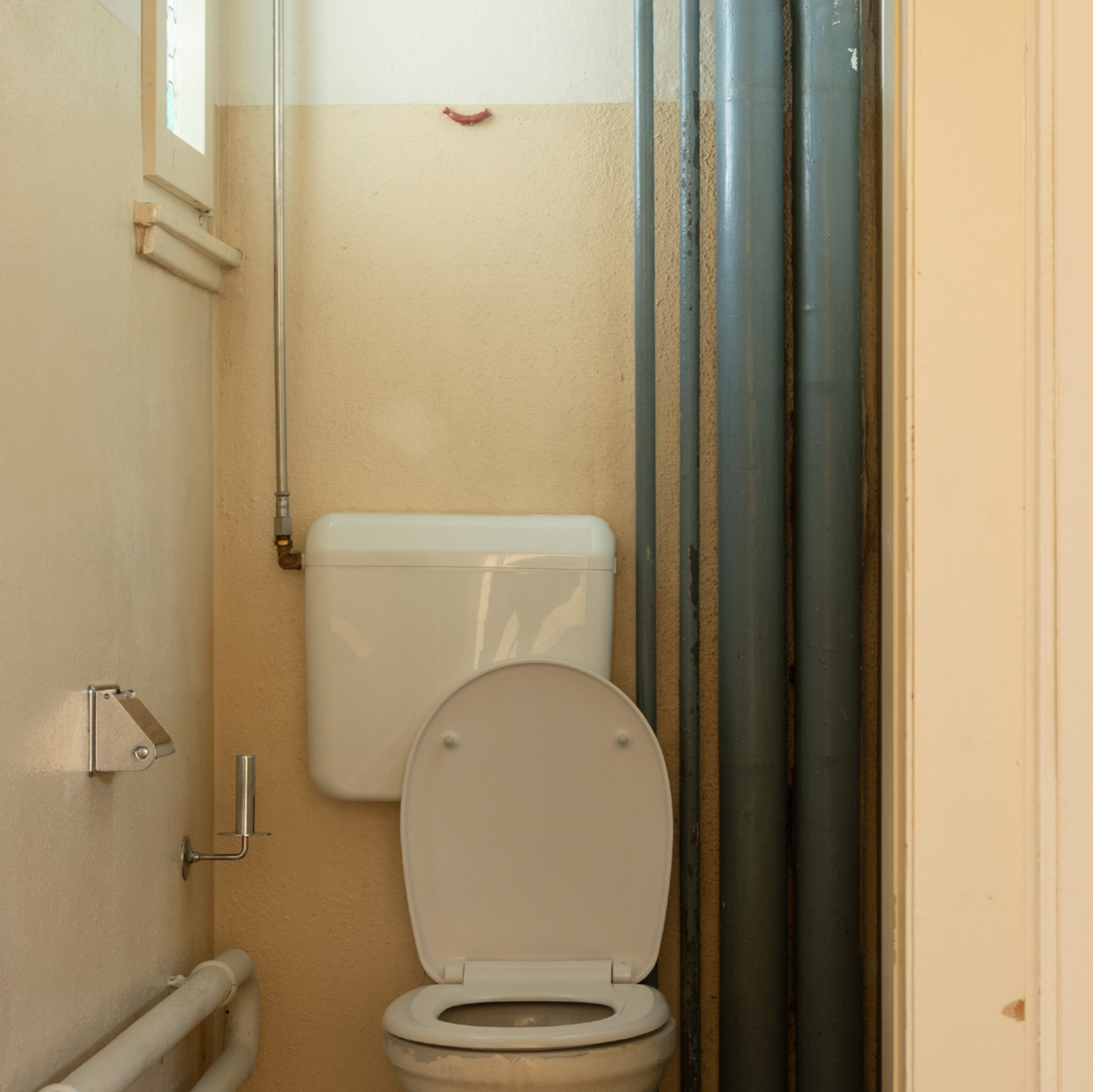
Salchicha 0 (tiny moments), 2024 Glazed stoneware Variable Measures Installation view Soup Show , Hotel Tiger