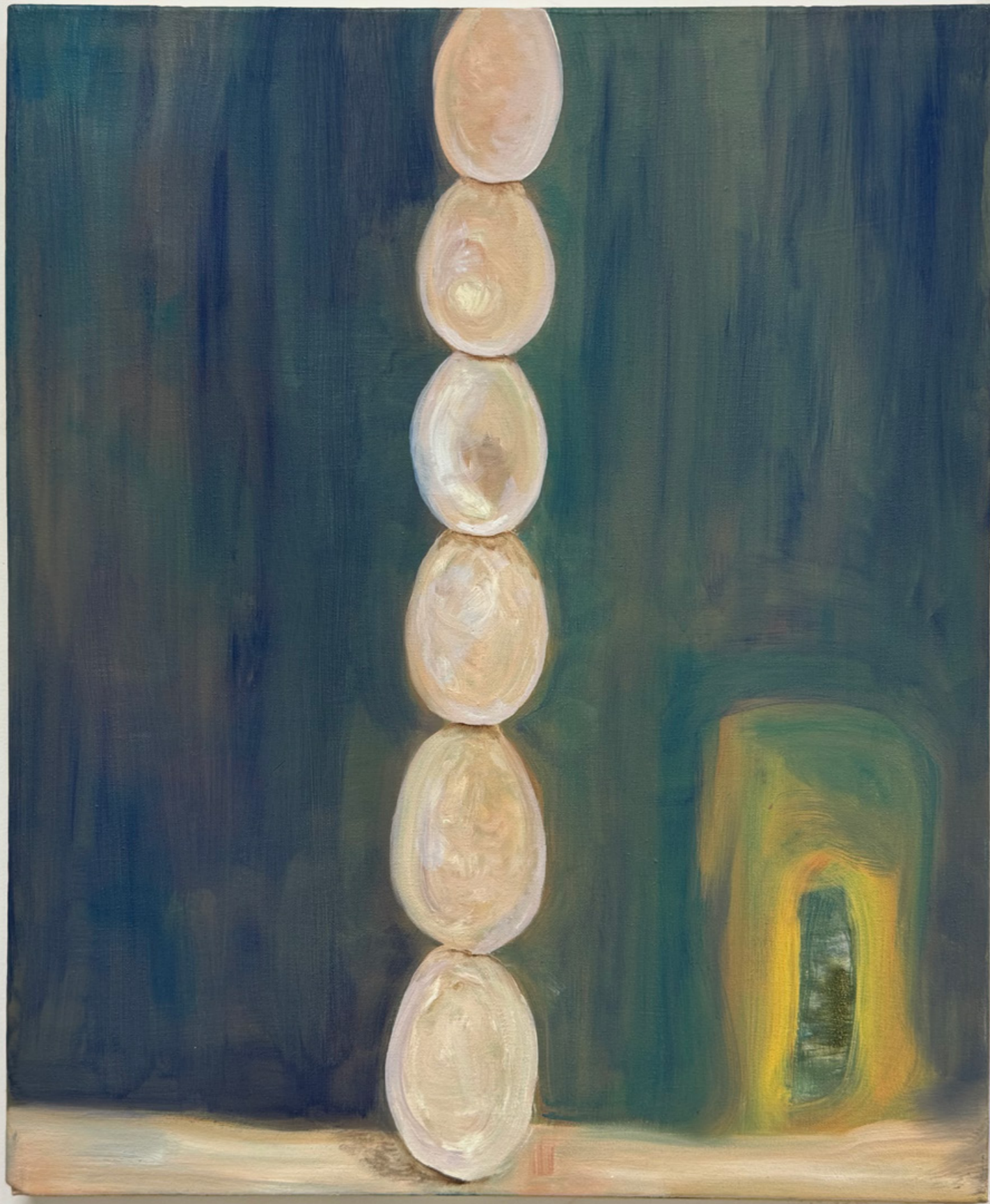
Tower of Egg, 2023 Oil on canvas 40 x 30 cm