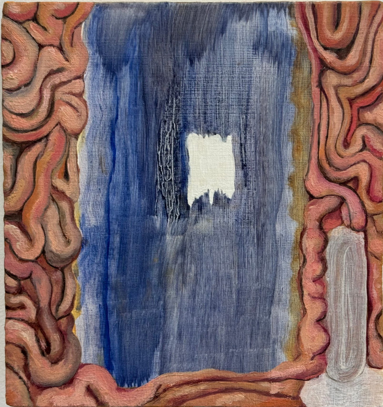
Whirlpool #4, 2023