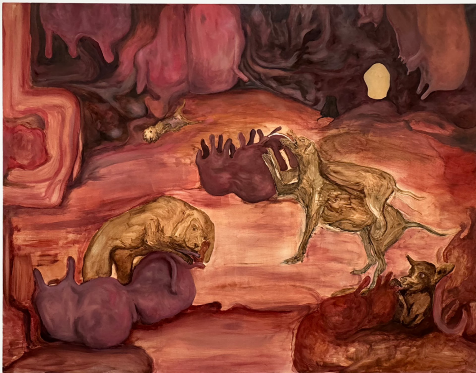
Flesh Anecdote, 2023 Oil and crayon on canvas 170 x 190 cm Studio view