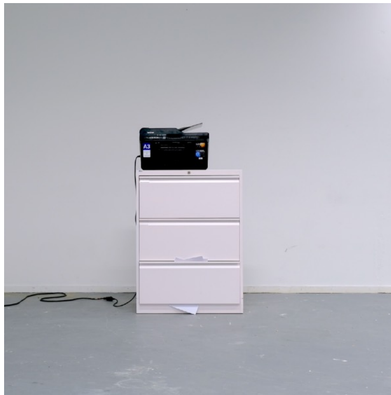
the Bermuda triangle of printed documents

2022 dimensions variable printer, filing cabinet, paper