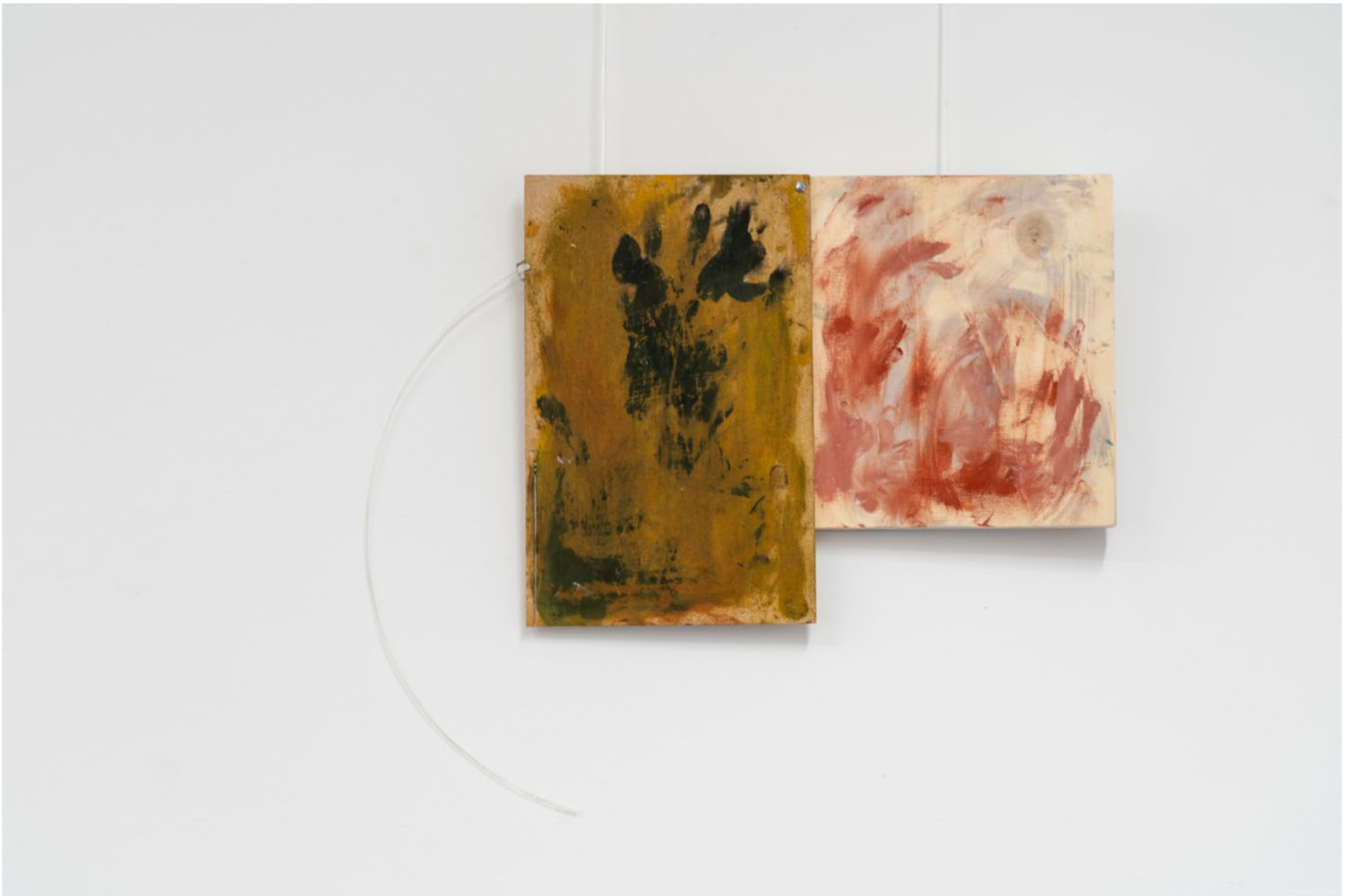
Untitled, 2023 Dimensions variable wood, screw, hooks and cable