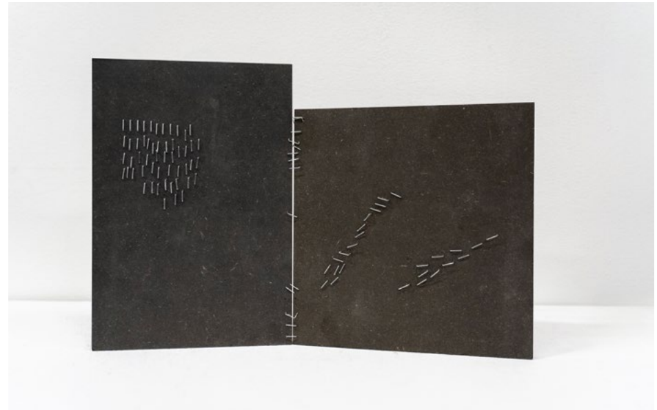
Installation: Untitled, 2022 Dimensions variable wood, staples, wax, primer