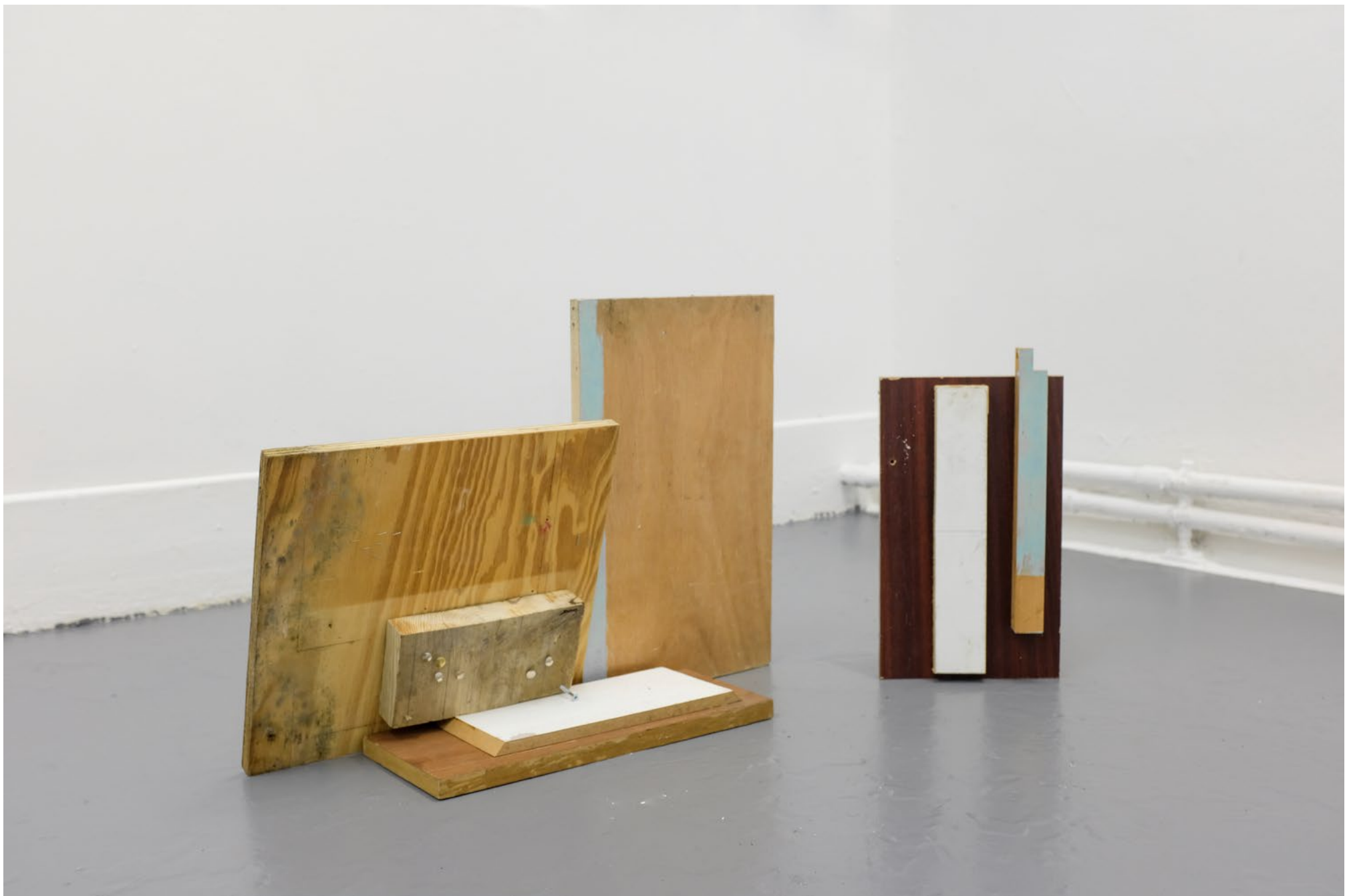
Untitled, 2023 Dimensions variable wood, screws, tacks