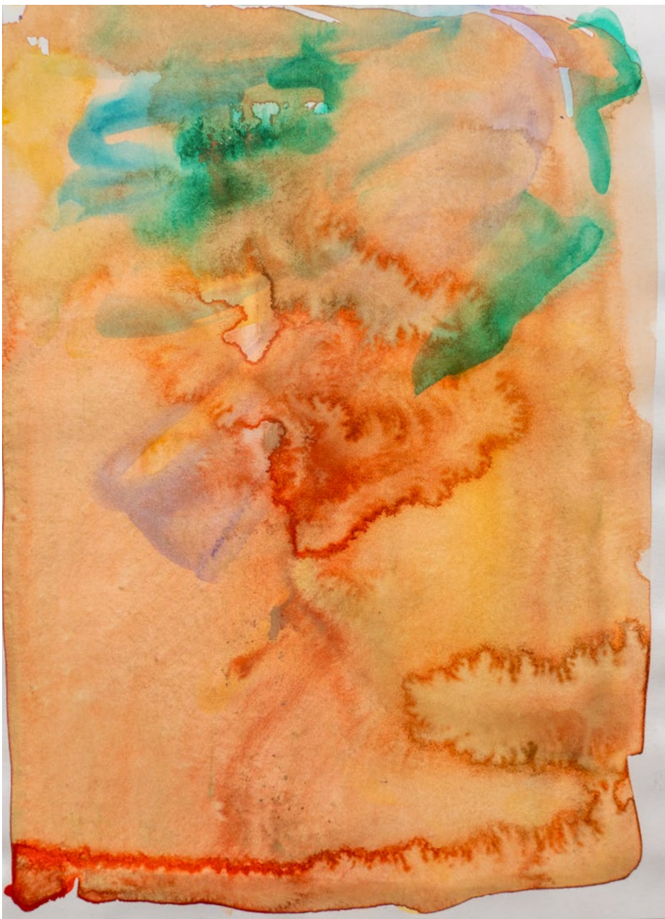
Untitled, 2021 20 x 14,6cm watercolor on paper