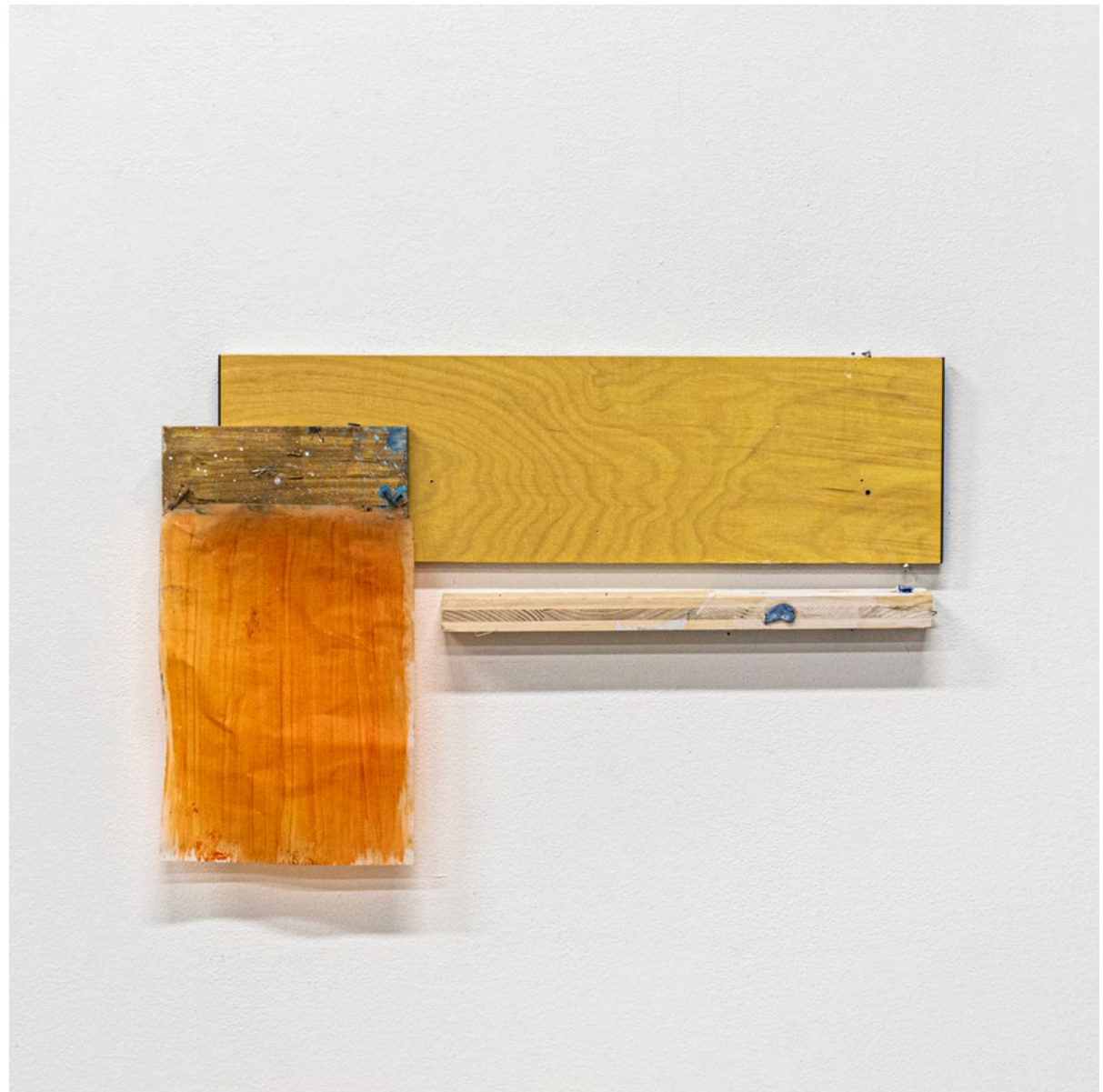
Untitled, 2022 Dimensions variable wood, transparent paper, oil, nails, dried acrylic