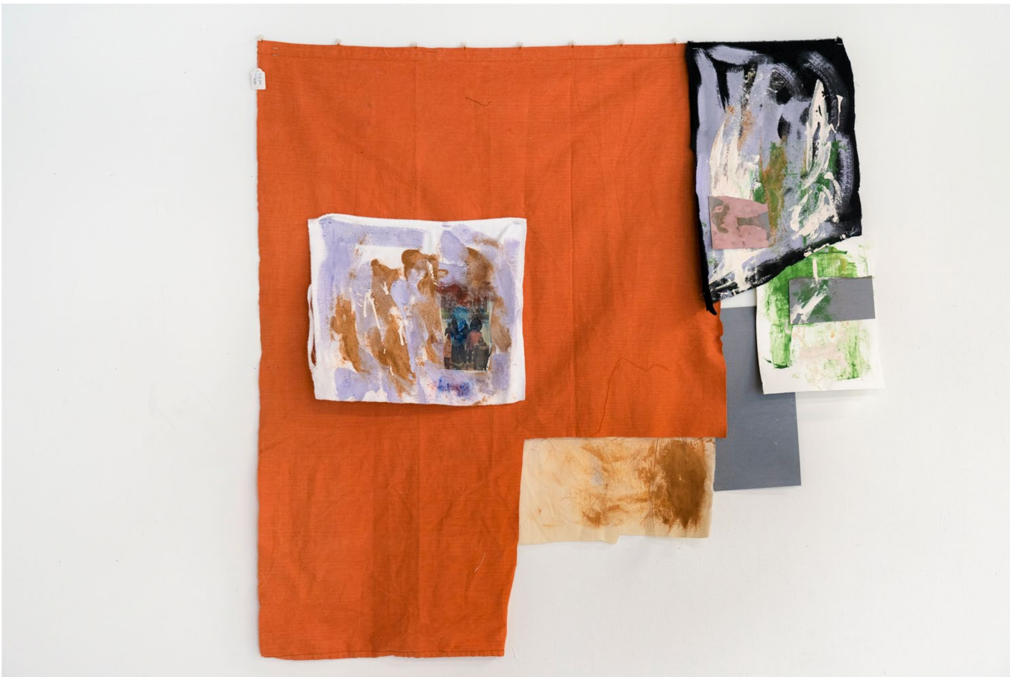
Untitled, 2022 Dimensions variable fabric, oil, pigments, paper, news paper