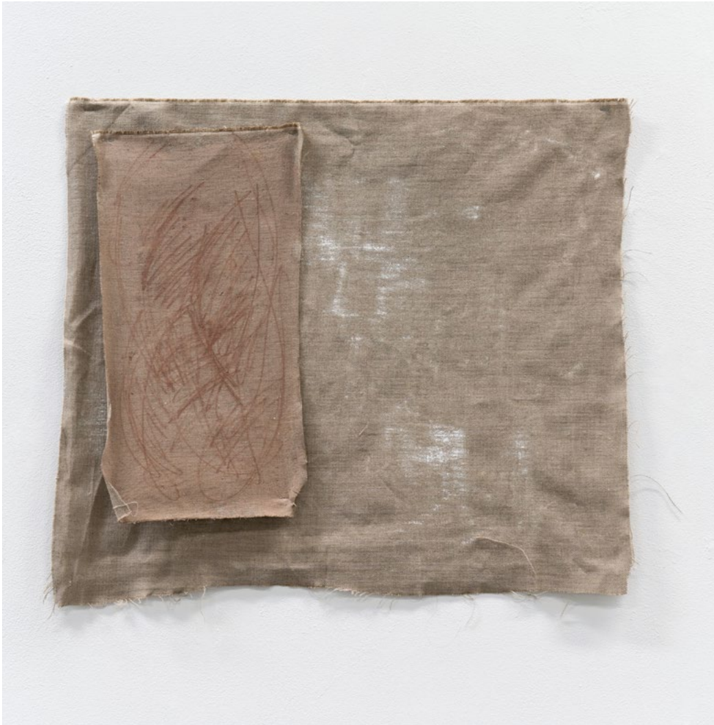
Untitled, 2022 63 x 71cm pencil, acrylic, canvas