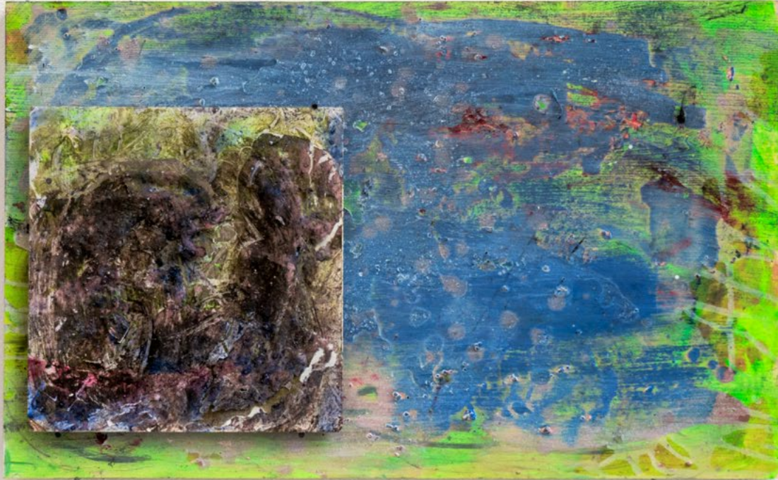
Untitled, 2022 35 x 57,2cm primer, acrylic, gelatine, pigments, wood, nail