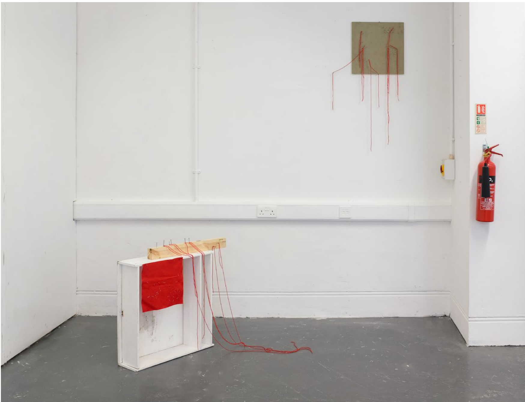
Installation: it is something, it is nothing., 2023 Dimensions variable wood, thread, nails, staples, fabric