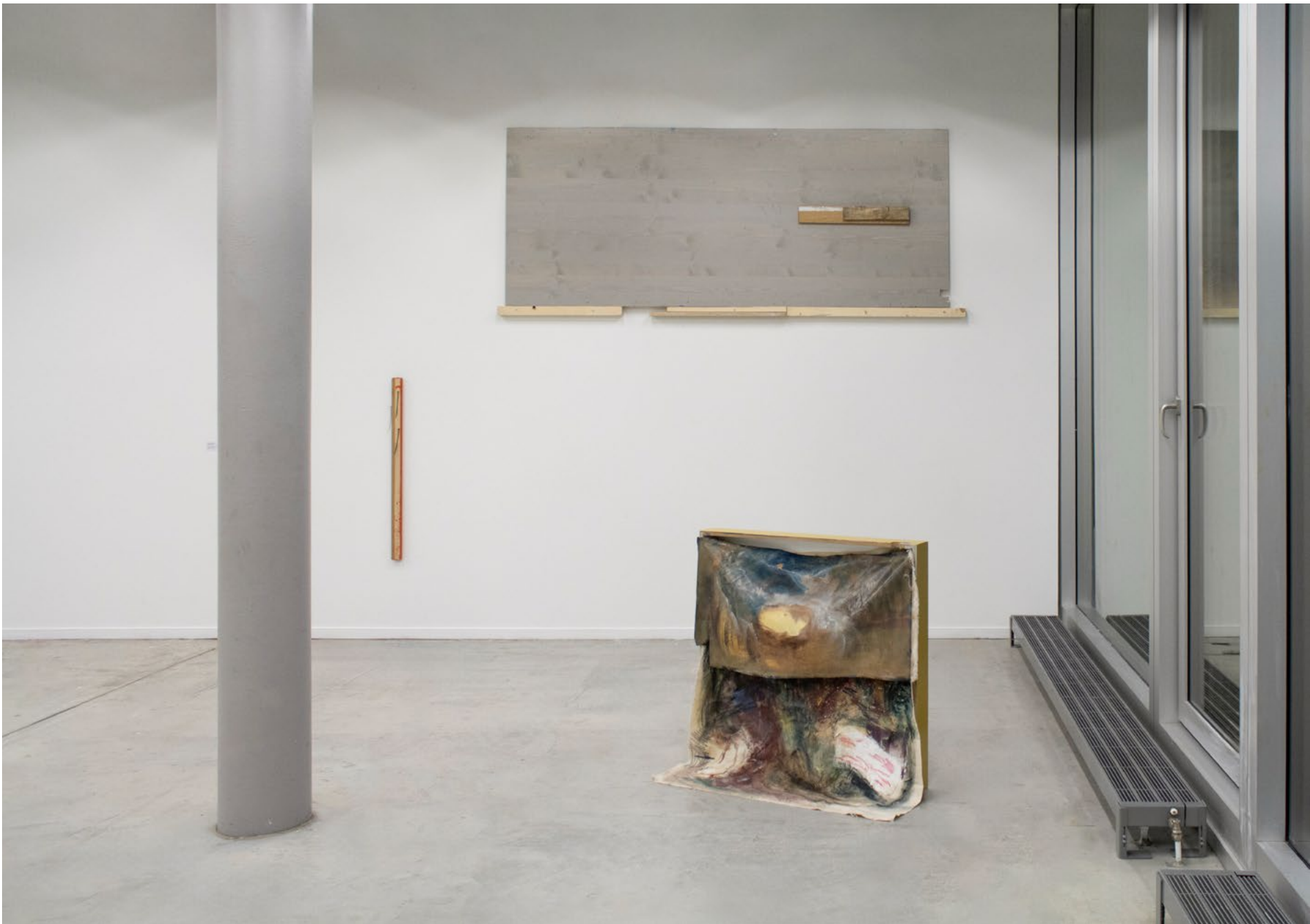
Installation: Untitled, 2023 Dimensions variable wood, nails, screws, cable ties, oil, canvas