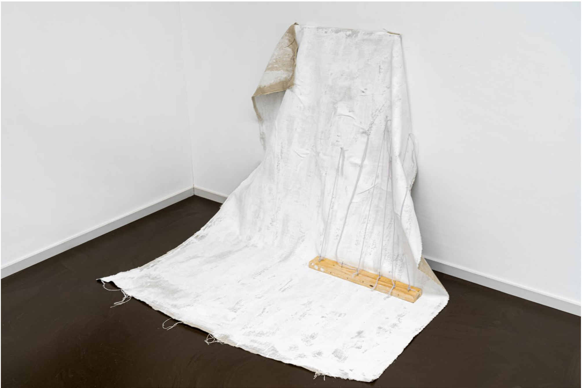
Untitled, 2023 Dimensions variable canvas, acrylic, threads, wood, nails, staples