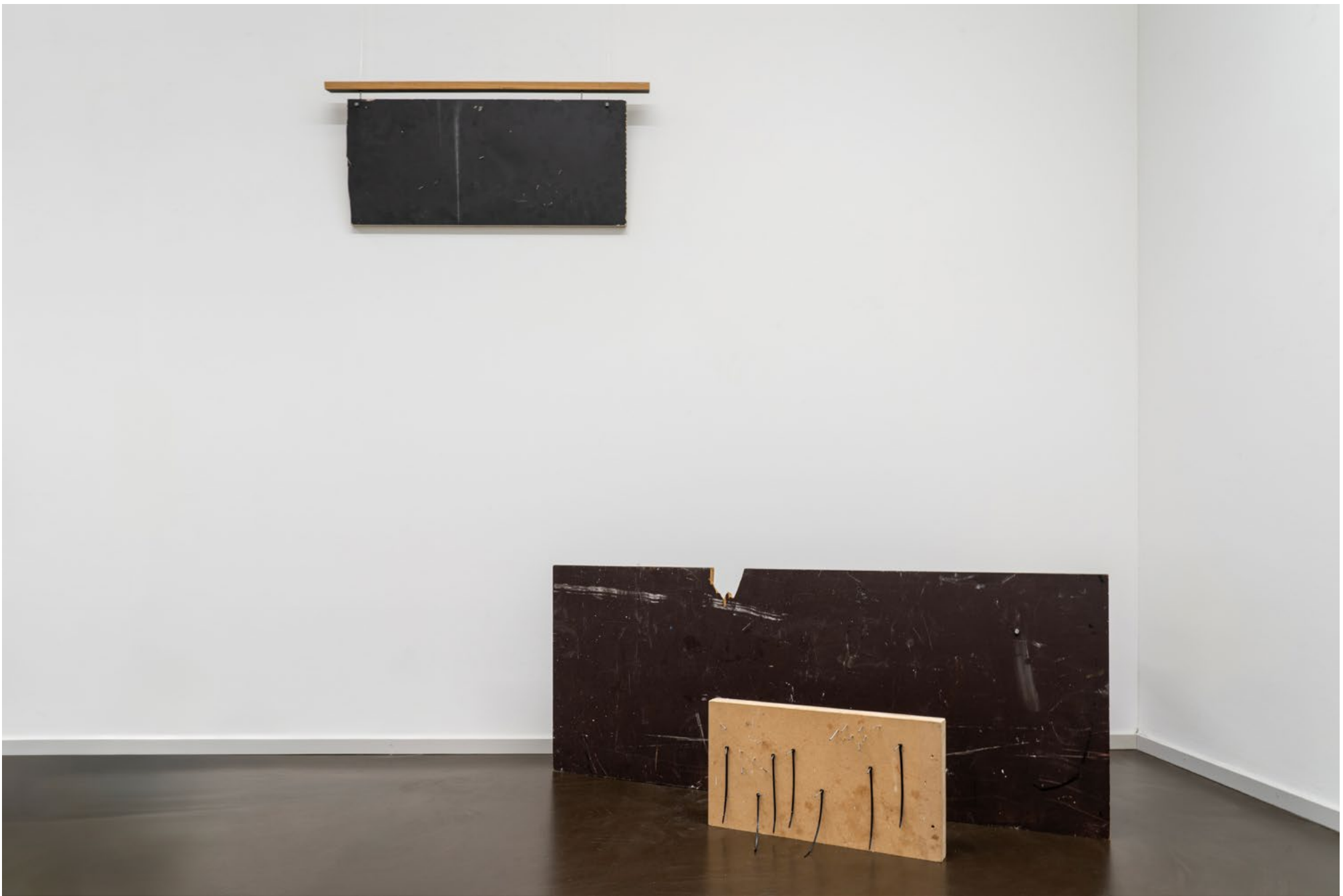
Untitled, 2023 Dimensions variable wood, natils, staples, cable ties, screws