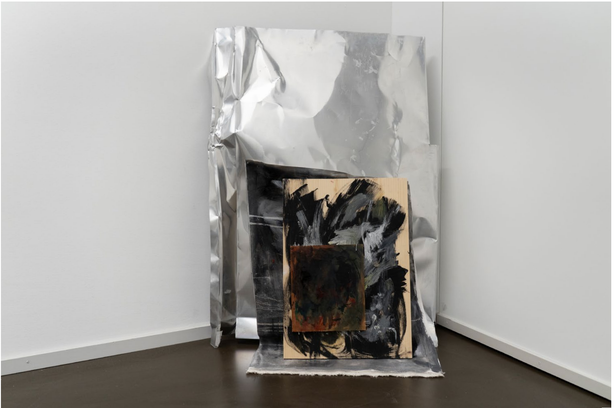
Untitled, 2023 Dimensions variable wood, staples, aluminum, canvas, oil, varnish, acrylic