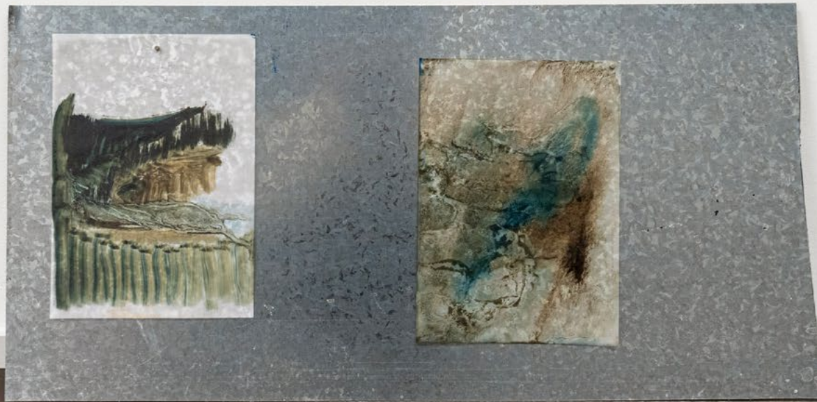
Untitled, 2023 41 x 81.5cm metal plate, transparent paper, oil, magnets