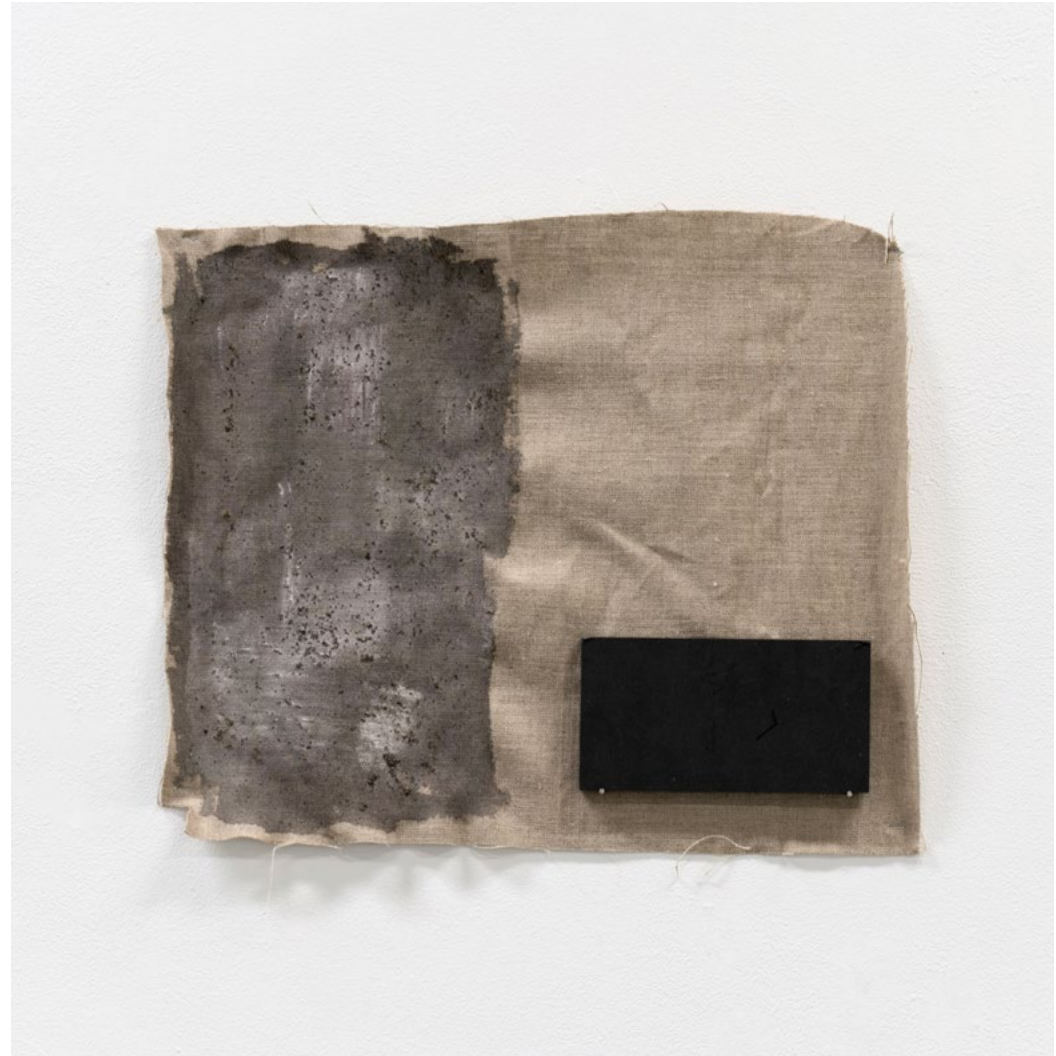
Untitled, 2022 42,7 x 52,2 cm primer, acrylic, wood, canvas