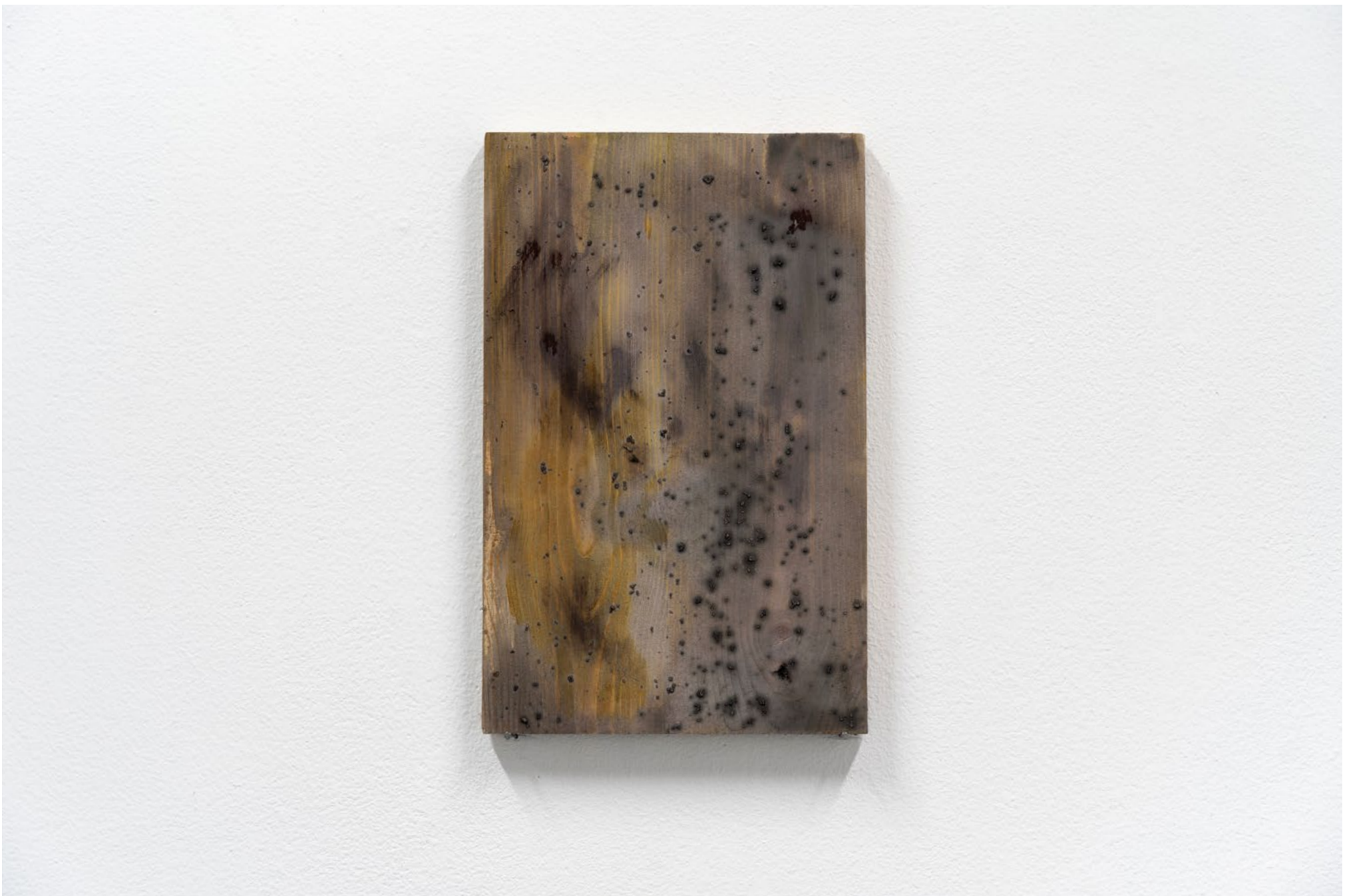
Deafening silence, 2022 30,4 x 19,5cm wood, povidone-iodine, primer, gelatin