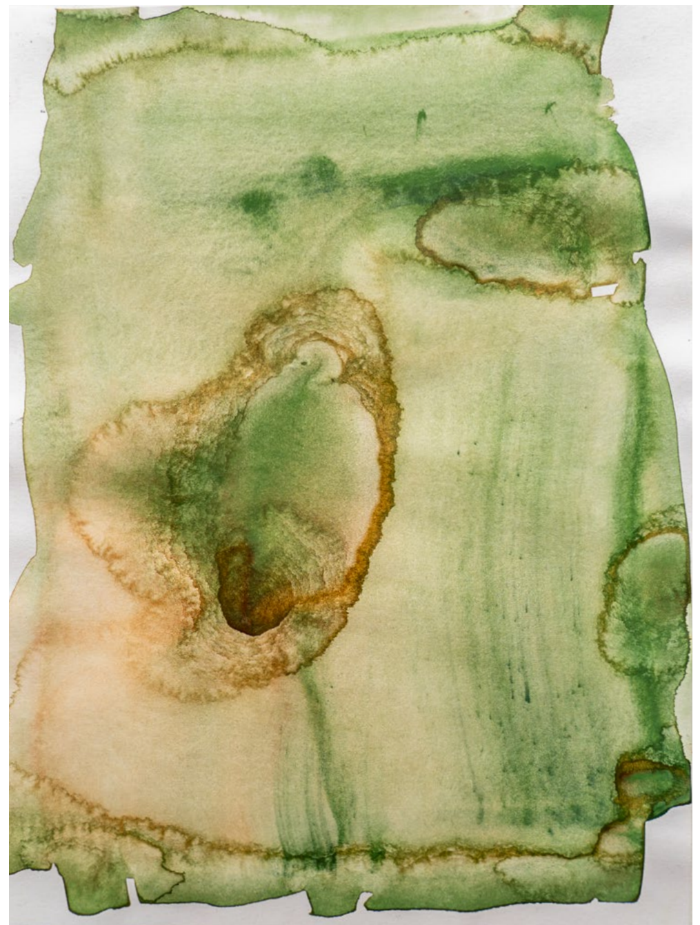
Untitled, 2021 20 x 14,6cm watercolor on paper