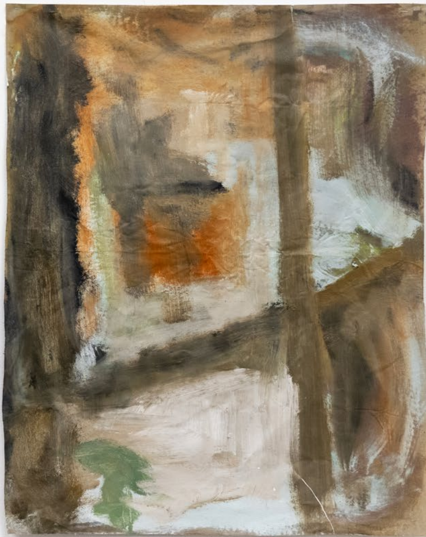
Untitled, 2023 85 x 66cm oil, acrylic, pigments on canvas