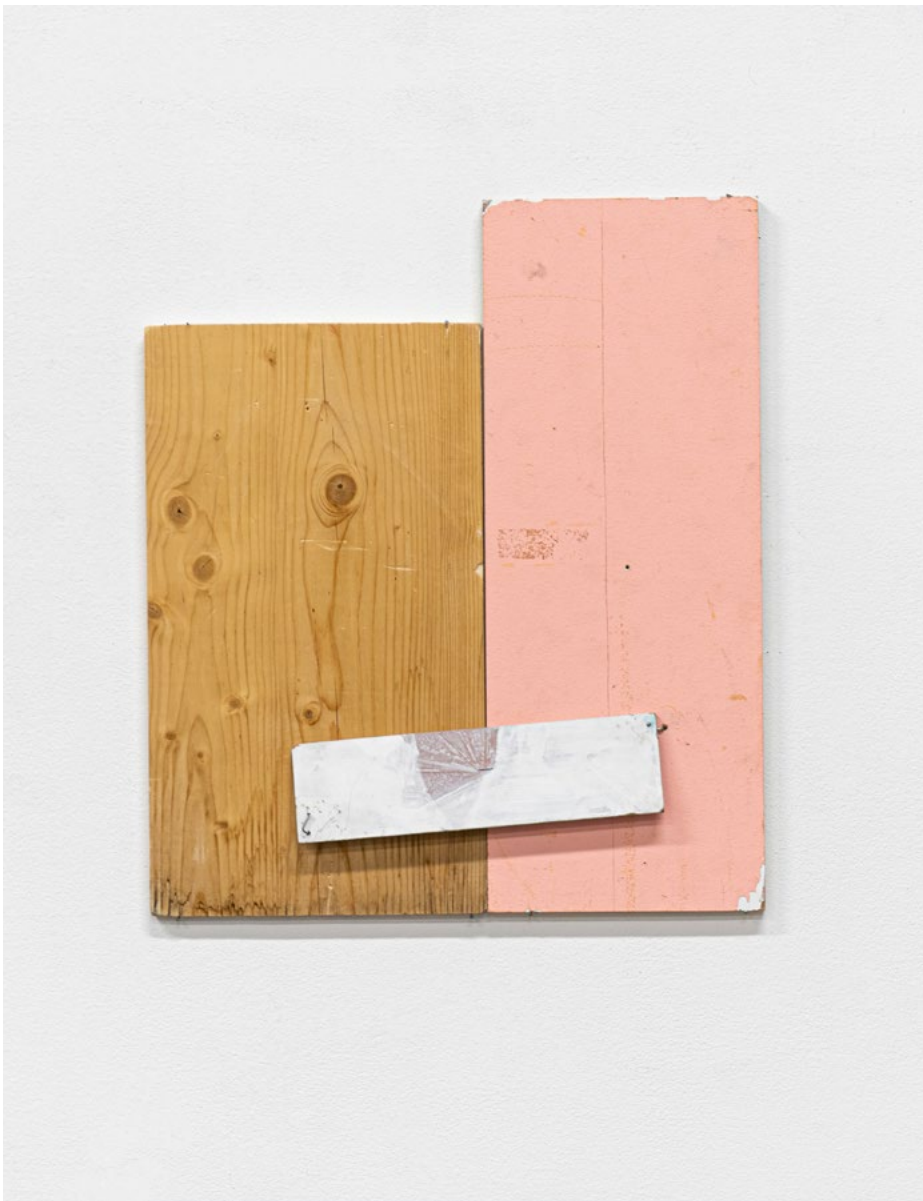
Untitled, 2022 58,5 x 50,5 cm wood, nails, acrylic