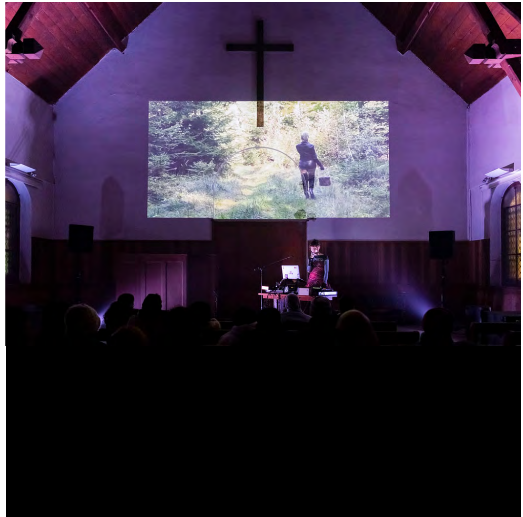
glimpse of a light , 2022, performance @ Les Urbaines, Chapelle de Chavannes, Renens