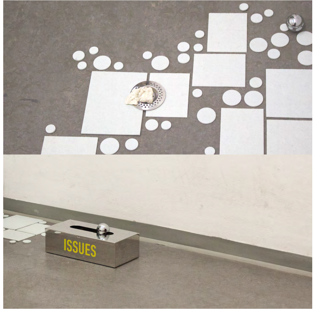
I'd wished they'd only given me the gummy bears, 2024, details @ RUF Wien