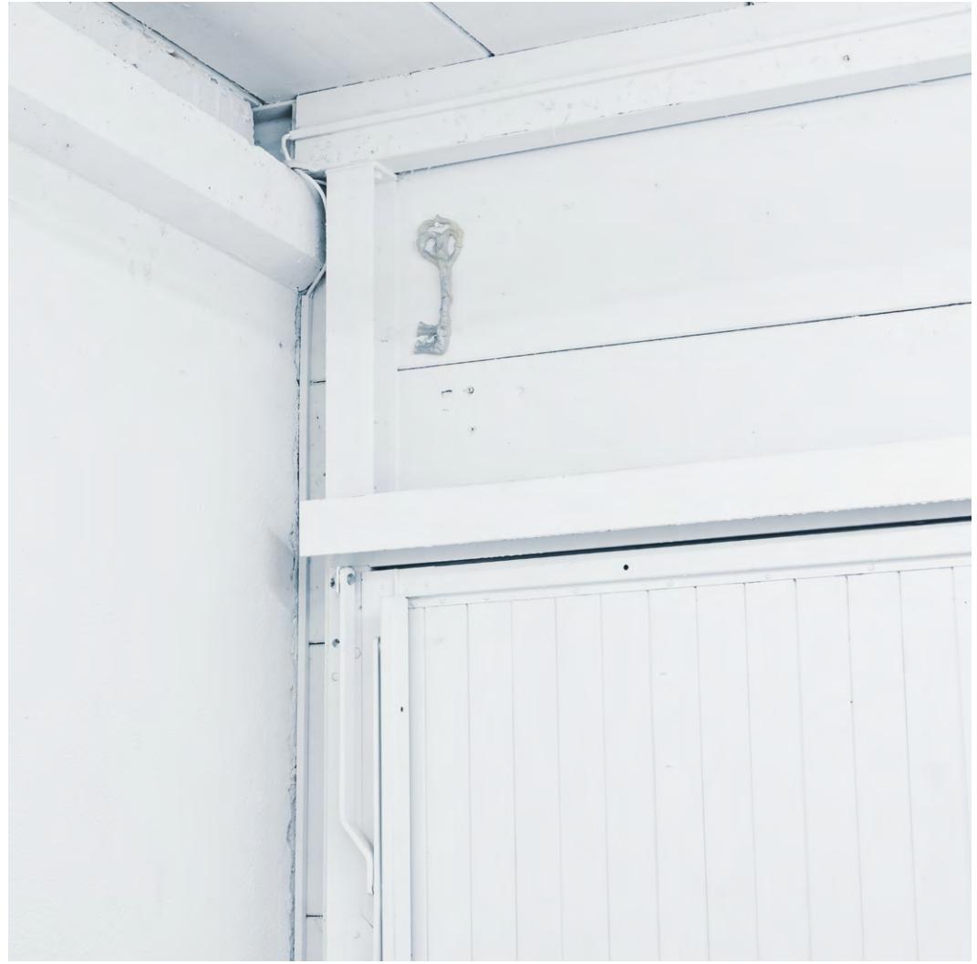
Farewells to u, i'm off to the secret pond, 2022 exhibition view of «Upon thee, the pits rises» duo show @ Mikro Zürich with Lou Sandmeier