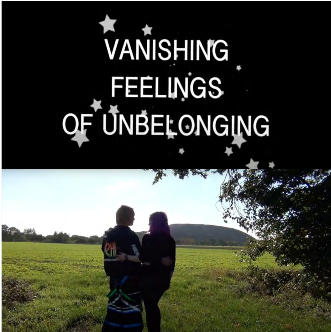
glimpse of a light , 2022, video installation, 10' (loop) stills