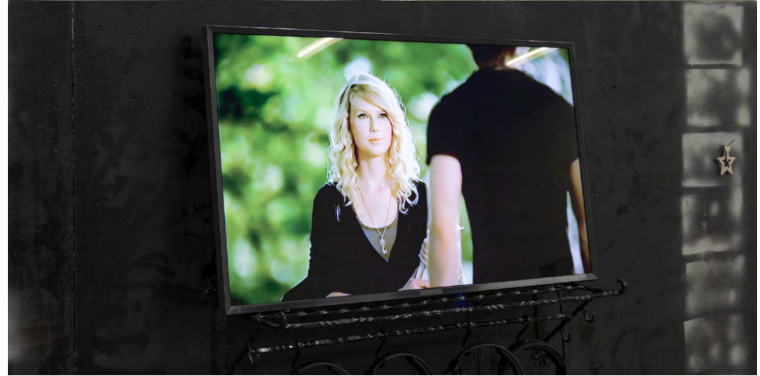
glimpse of a light , 2022, video installation, 10' (loop) exhibition view & details @ ZHdK Toni Areal