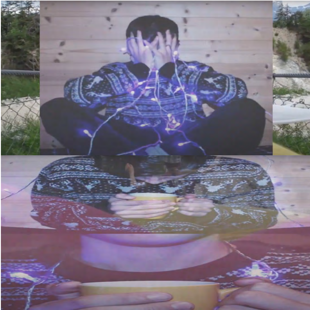
2012 ANGEL/DEATH MASHUP, 2022 stills