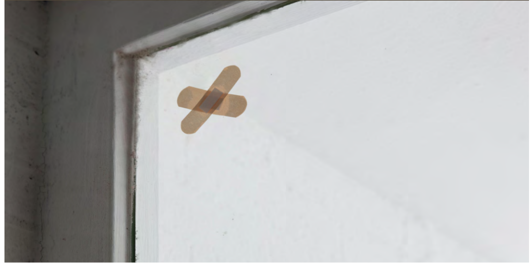
Clocked, but time is passing , 2023, details @ SPUTO Zürich