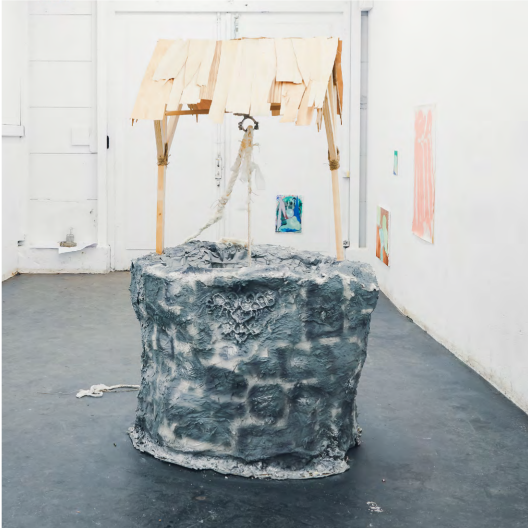
Farewells to u, i'm off to the secret pond , 2022, sculptures (plaster, wood, fabric, paper, clay) @ MIKRO Zürich