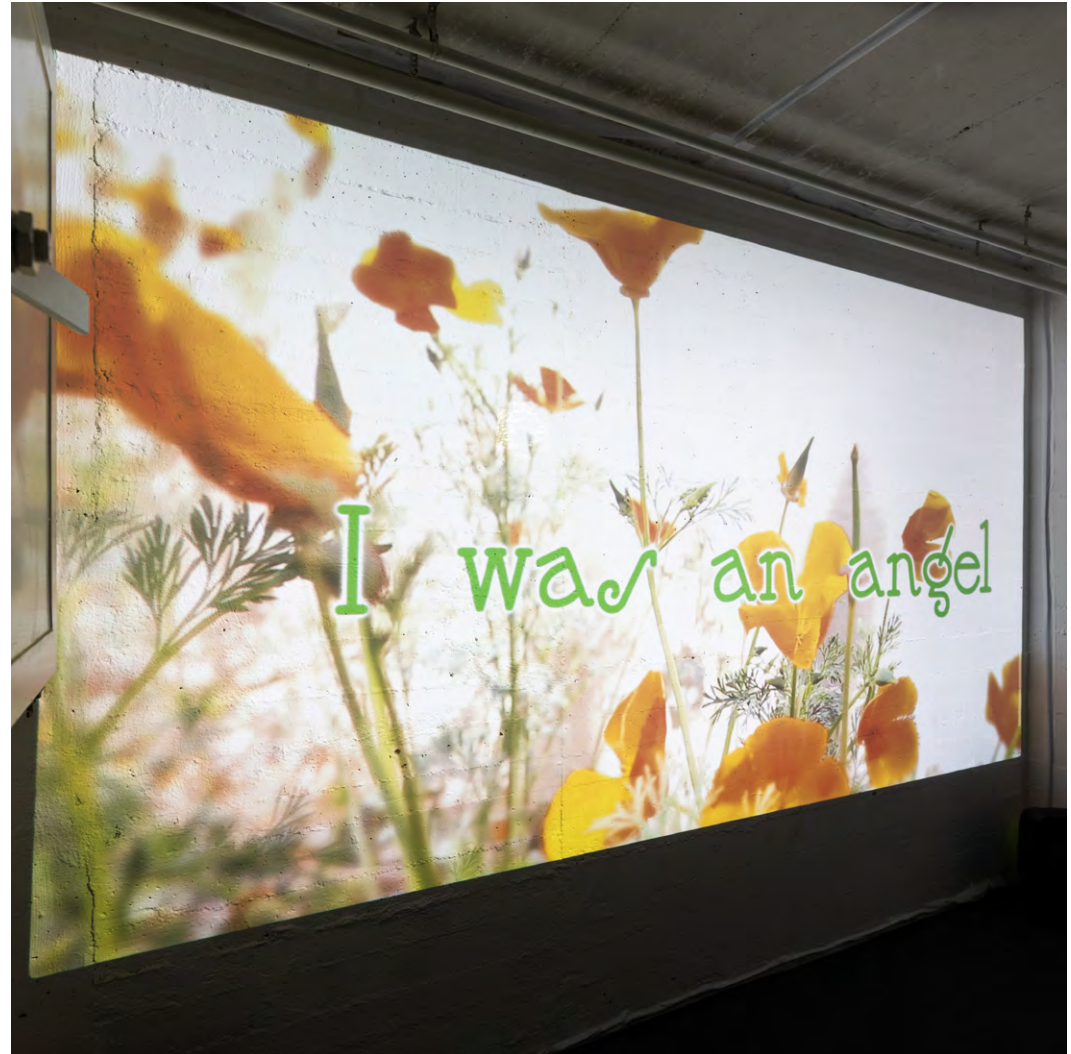
2012 ANGEL/DEATH MASHUP, 2022 exhibition view @ 4red eyes Zürich