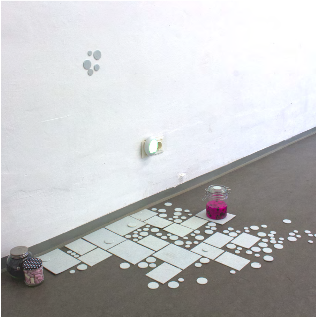
I'd wished they'd only given me the gummy bears , 2024, installation & performance (8') @ RUF Wien

I'd wished they'd only given me the gummy bears is a scene involving three T-shirts, a bathroom floor, three jars, and a lot of issues. The performer crosses the room, chewing gum until a slug of slime is created, which is then dropped into the sewage.