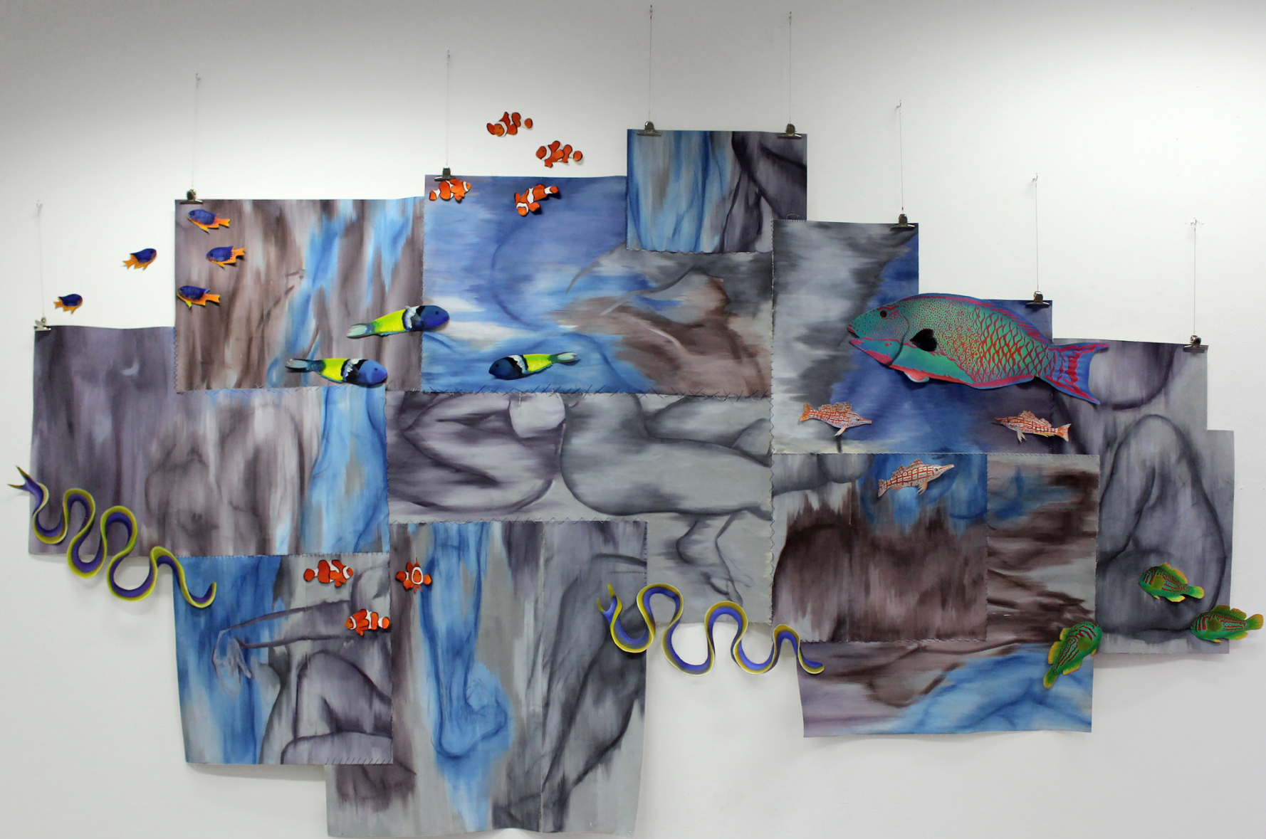
„My dad’s a woman.“, says Nemo. (Sexchanging fish as a symbol of fluidity and liberation. Deconstructing the gendered human body. Freeing trans bodies from binary expectations.) 2021 Soft pastels, oil on canvas, thread, 240 x 180cm