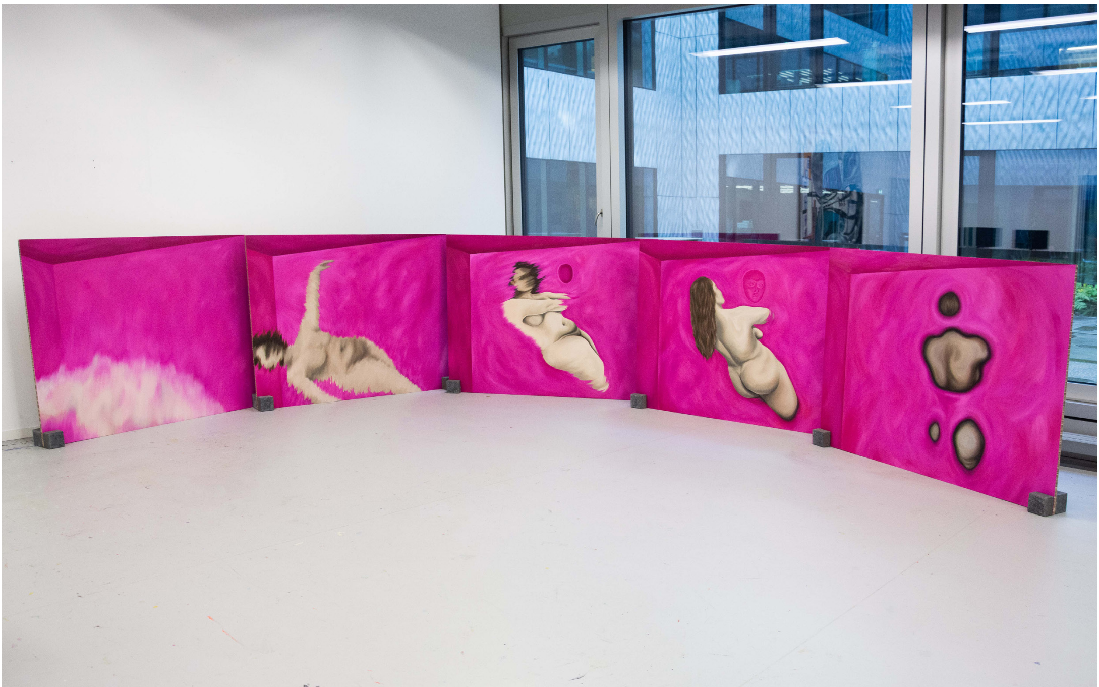
Spirited Away 2021