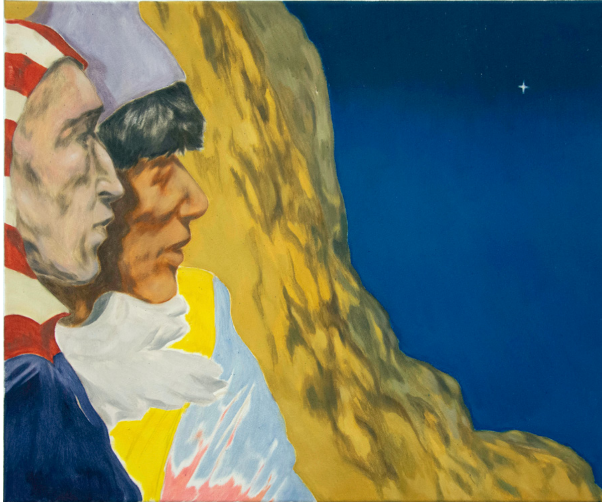
The End of the Night