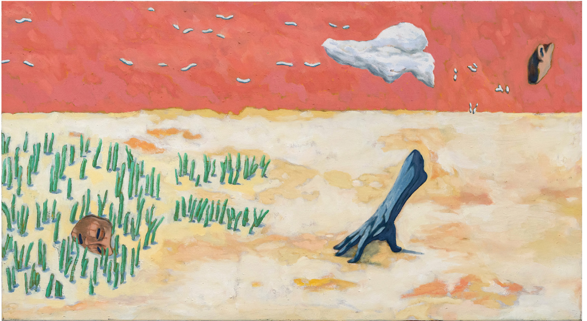
Fifteen Years in One Week - One Year in Fifteen Weeks