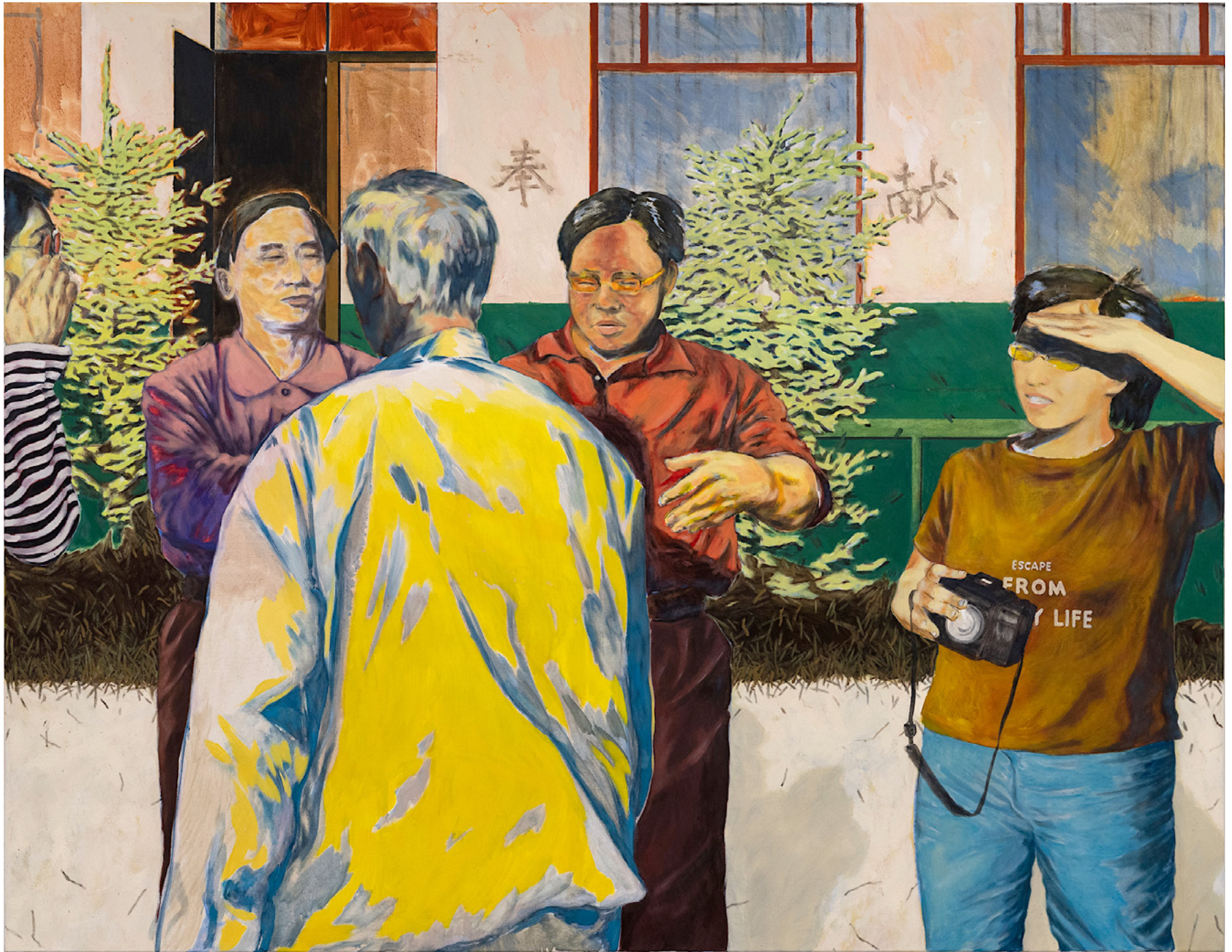
Wasn't it Real?