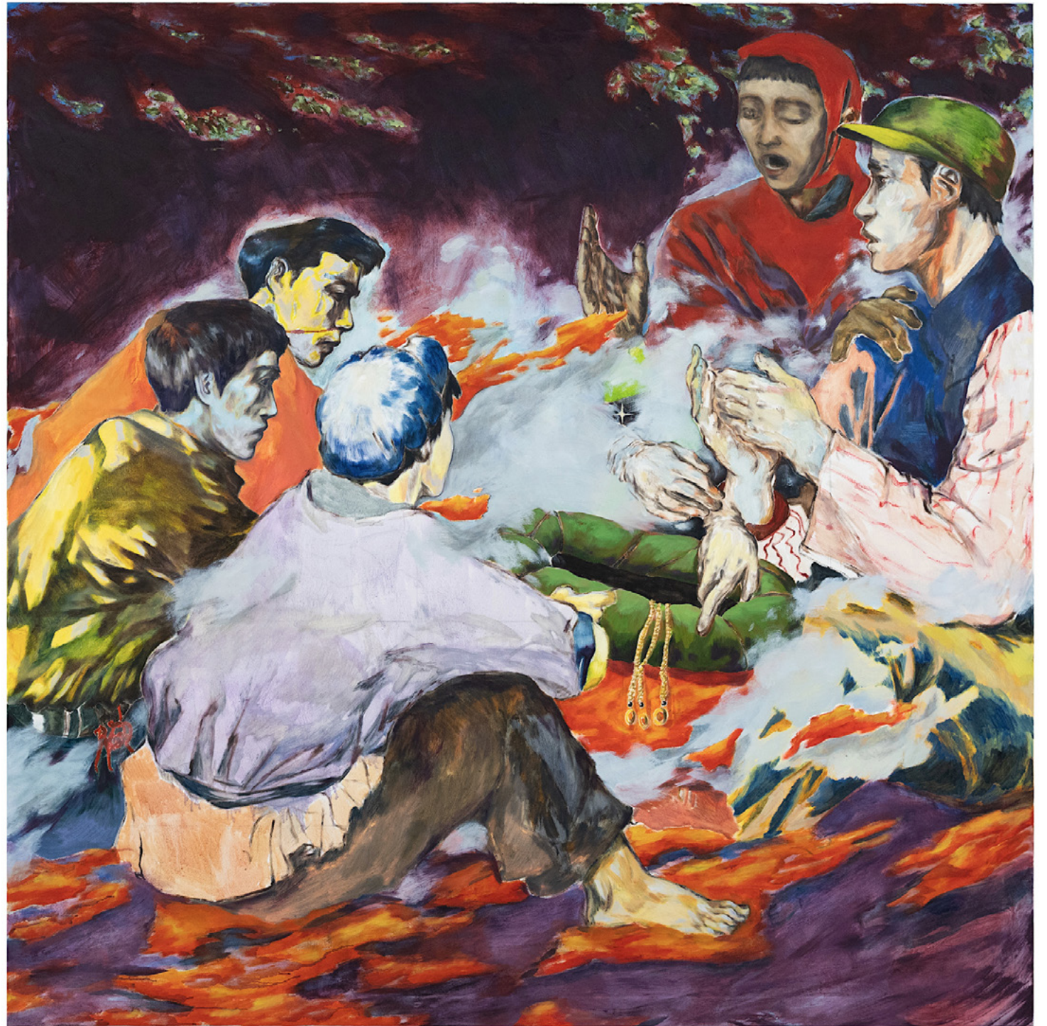
Hard to Tell You