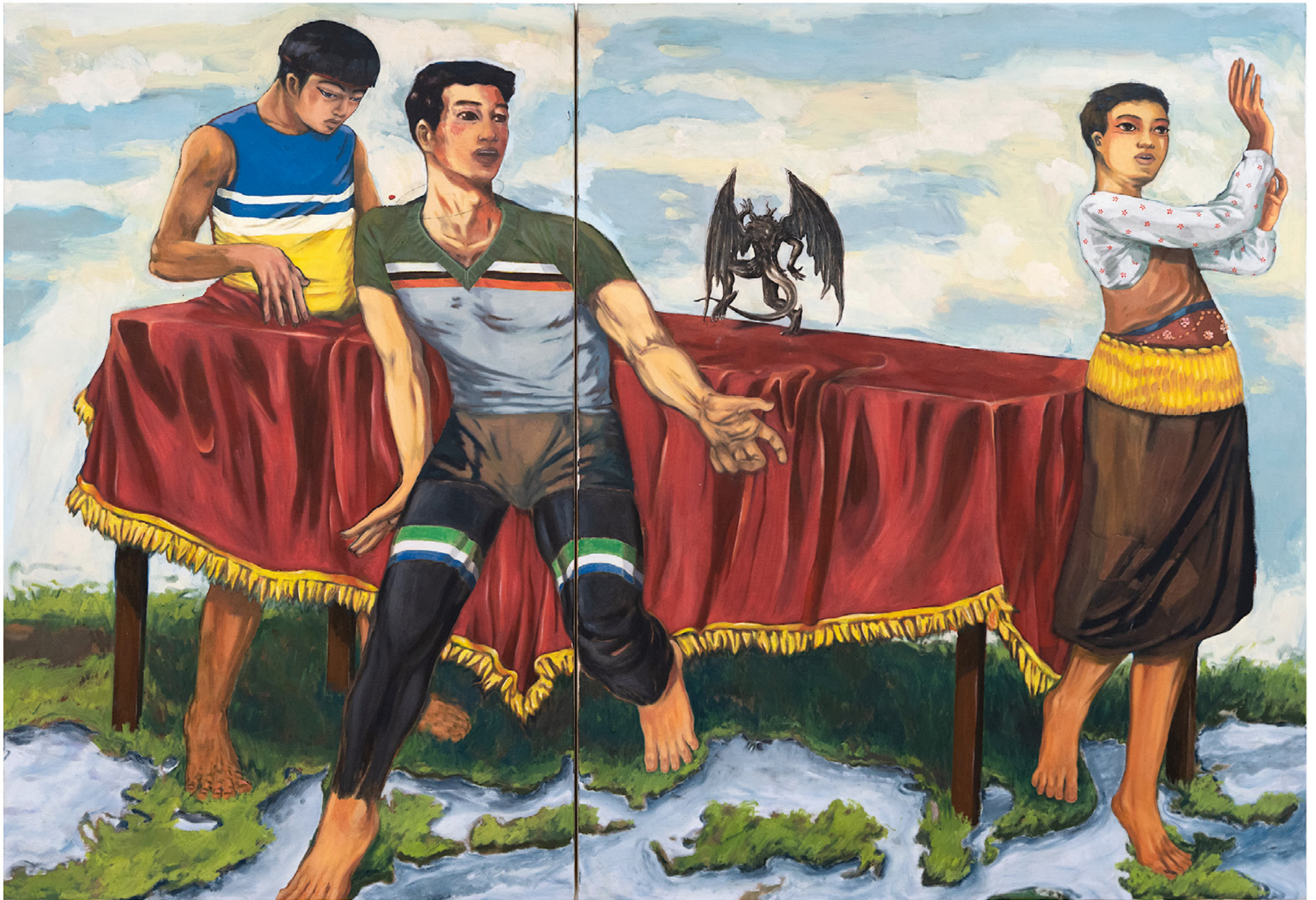
Untitled (Stage) Oil on cotton, 180 x 260 cm, 2022