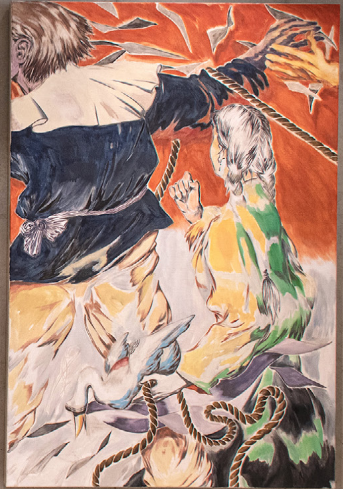
Black Magic (I & II) – Oil on linen, 130 x 95 cm (left), 140 x 95 cm (right)