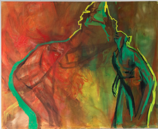
Ég þóttist nú vita þetta, 2023, Oil on canvas, 145 x 175 cm