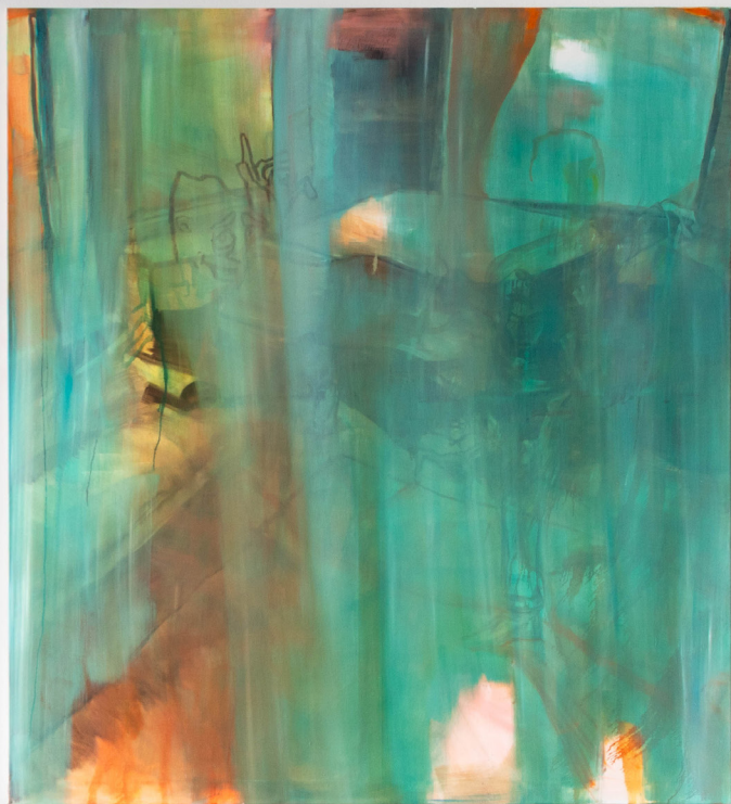
Gerðu það, fáðu þessa kippu af kóki , 2023, Oil on canvas, 200 x 180 cm