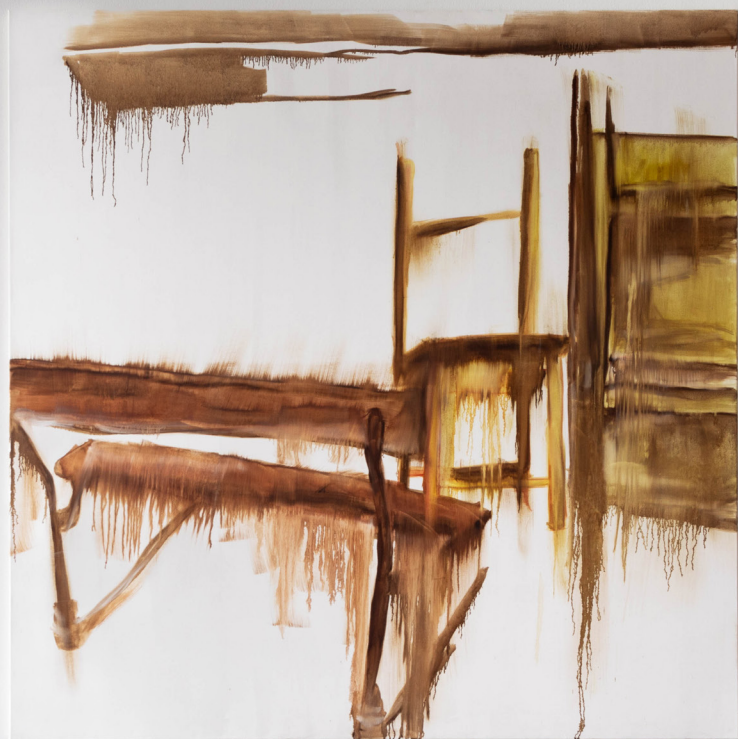
En hvar hann lenti, það er ég ekki svo viss um, Oil on canvas, 200 x 200 cm