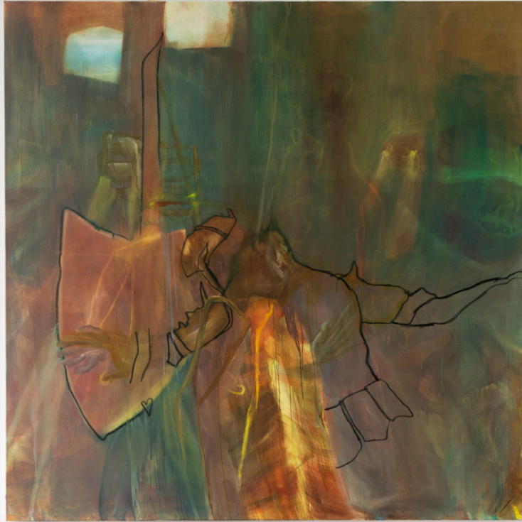
Keflavíkurvegur , Oil on canvas, 200 x 200 cm