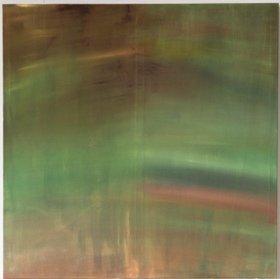
Er það ekki það sem það heitir , 2023, Oil on canvas, 150 x 150 cm