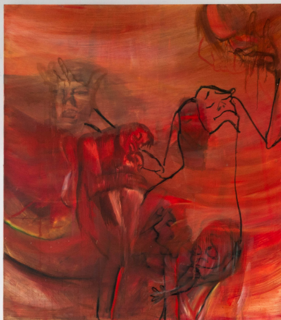
Nú temur hann Graðhesta niðri í Fák, 2023, Oil on canvas, 170 x 145 cm