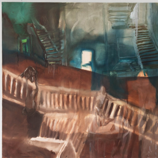
Þú getur rétt ímyndað þér hvað rassinn á þeim í Grindavík hefur hrist, 2023, Oil on canvas, 150 x 150 cm