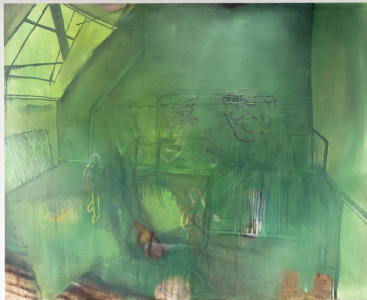
Gefðu drengnum péning , 2024, Oil on canvas, 170 x 190 cm