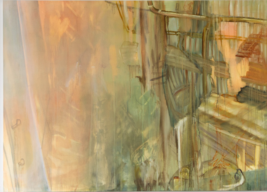
Svolftíð þéttar bakvið eyrun , 2024, Oil on canvas, 180 x 250 cm