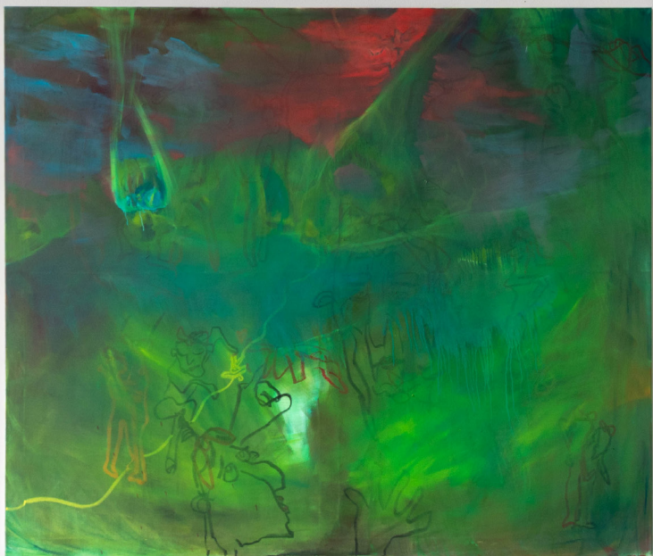
Loka Pandóruboxinu , 2023, Oil on canvas, 170 x 190 cm