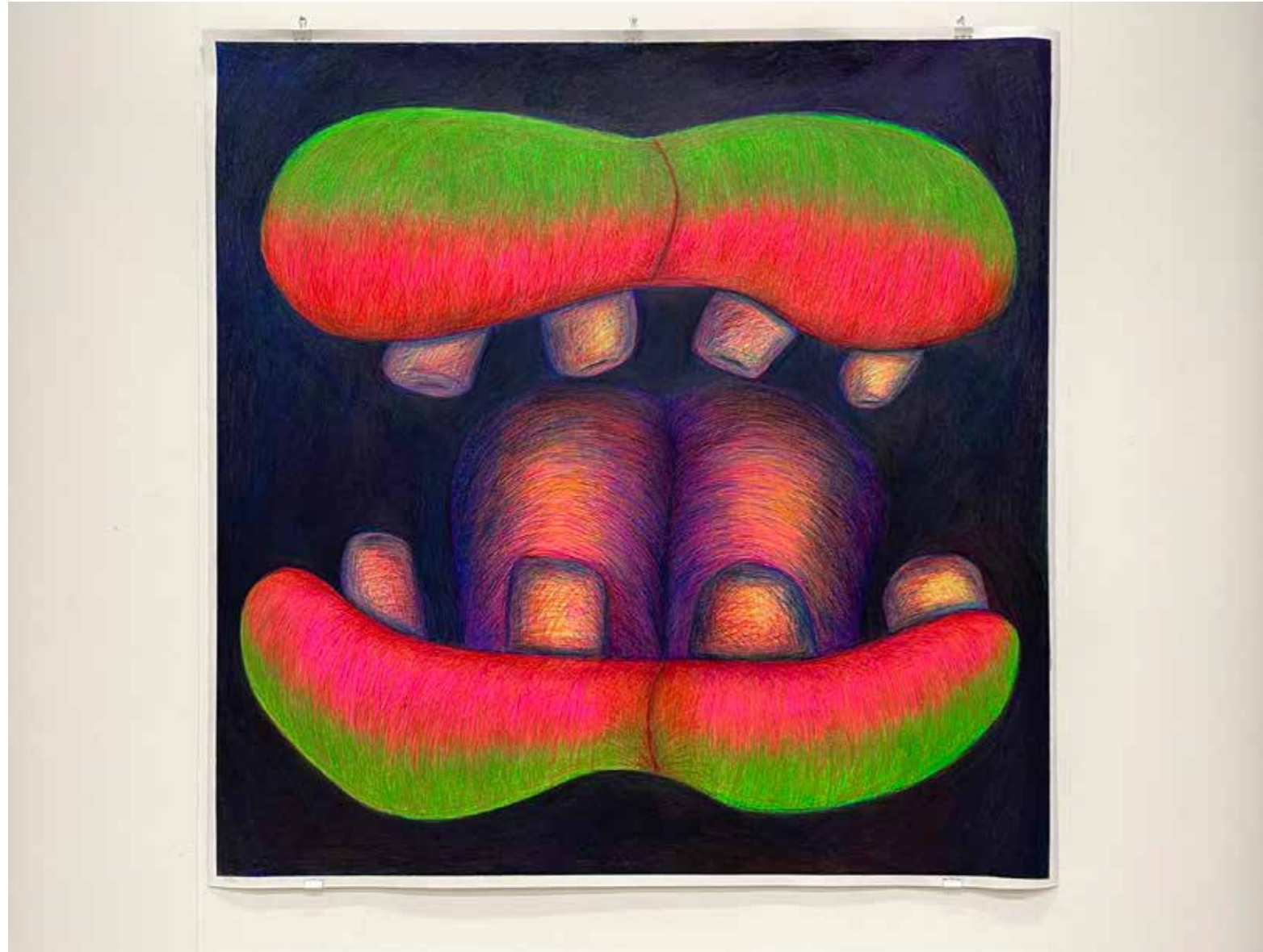
The Inflation Desire, 2022 Color pencil on paper 196 x 196 cm