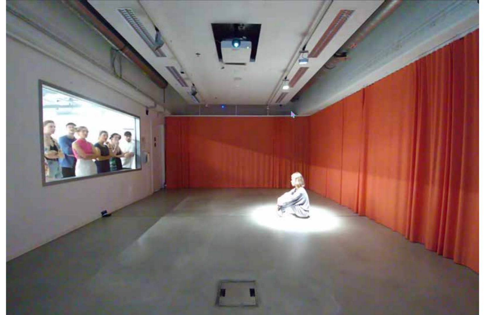
Screenshot of Zoom recording during live performance