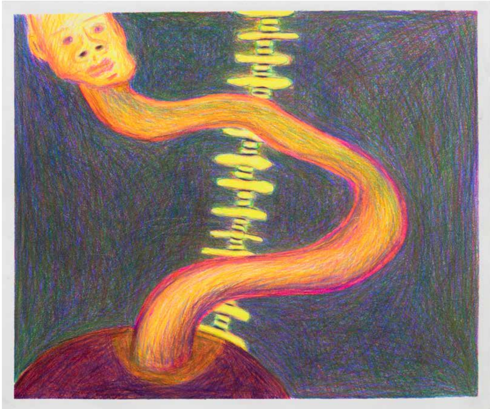
A Distant Planet, 2022 Color pencil on paper 96 x 80 cm