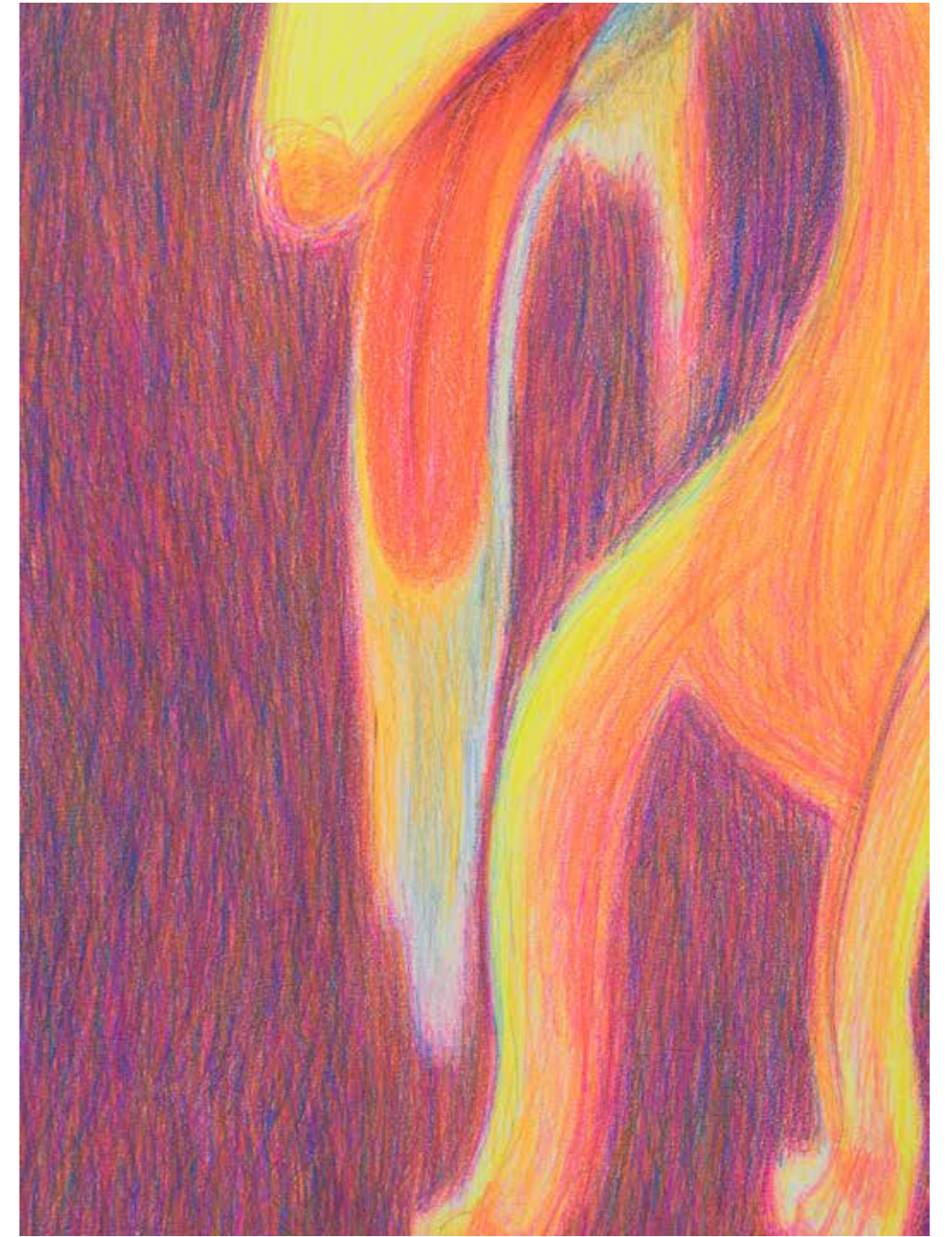
Love's In The Air, 2022 Color pencil on paper 196 x 150 cm Details