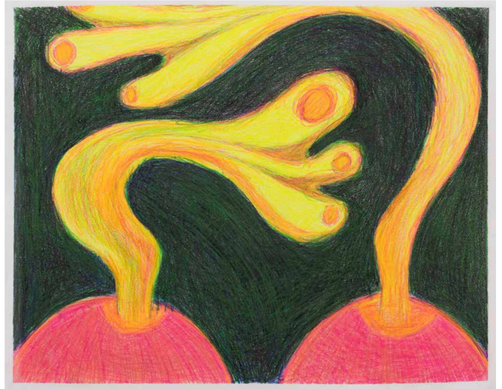
Daughter of A Distant Planet, 2022 Color pencil on paper 100 x 80 cm