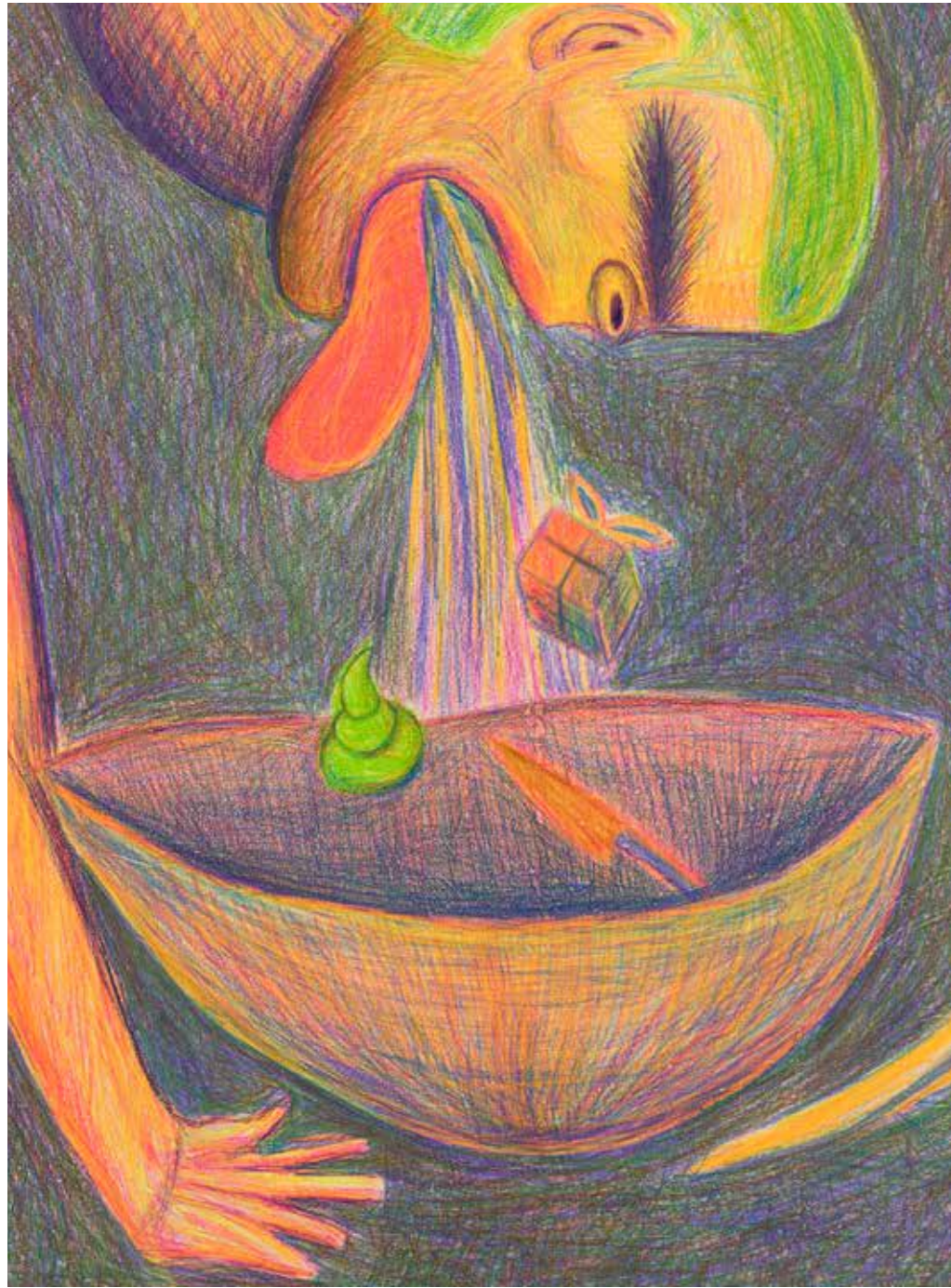
Handstand, 2022 Color pencil on paper 254 x 196 cm Details