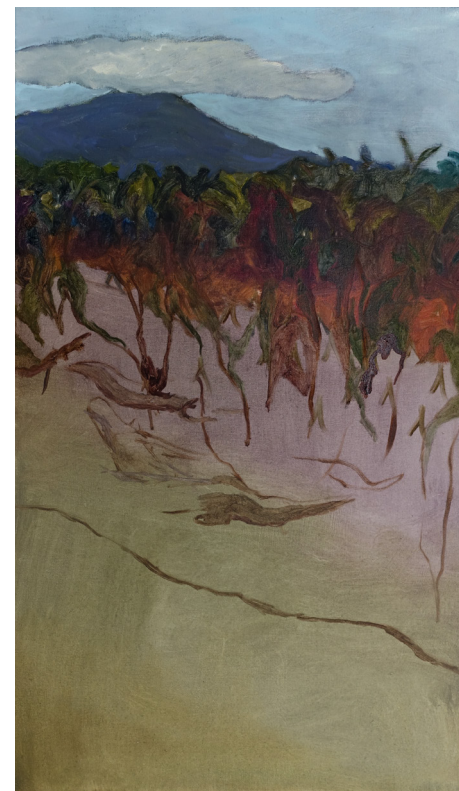
« Marsupials and singing Birds », oil on cotton, 4 pannels; 30x60cm, 35x60cm, 60x60cm, 35x60cm, 2024

Made for the exhibition Space Invasion , which asked about main challenges for today. This painting takes its origin in a tourist boat trip through the Daintree river I made some time ago in Australia.