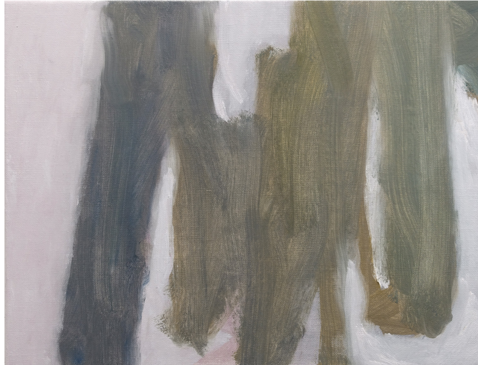
In the series I have a desire and it's like moving with the river , oil on canvas, 35x45 cm, 2024