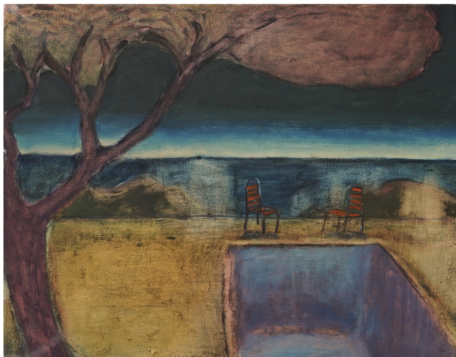
Empty Pools , oil on linen, 40x30 cm, 2023

The abandonment of private property. Traces of modernist and exotic construction of home. We will climb over the fences by night. watch the sunrise.