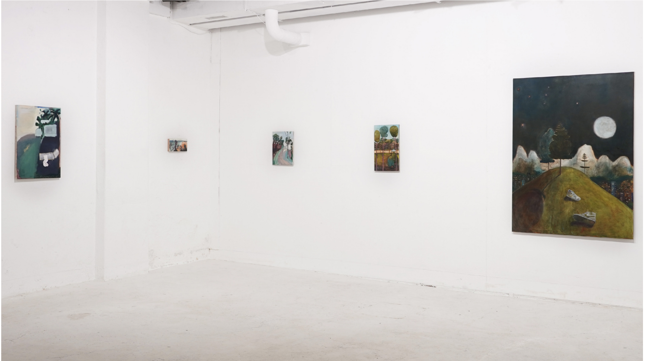
LOCI , Exhibition at Flüelastrasse 31 (FOMO), 2023

This exhibition is composed by ten paintings depicting places, based on imagination or memory. They create a dialogue with landscape painting and with the exhibition space which was underground and would no longer exist after the show by demolition for new constructions. The room was activated through color and «windows» as potential fictions.