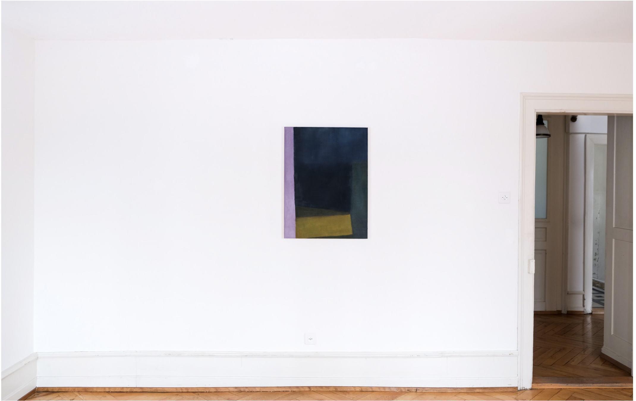
Separated by nothing more , oil on cotton, 60x80cm, 2024