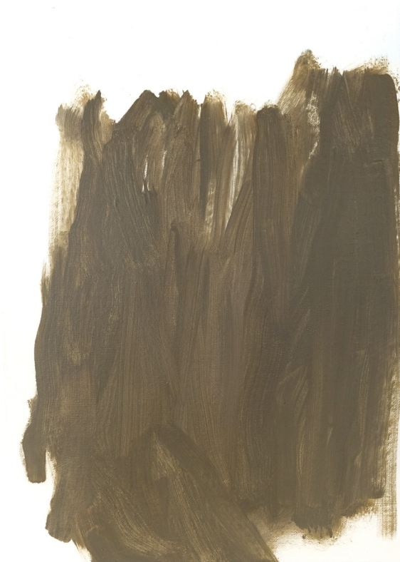
In the series I have a desire and it's like moving with the river , oil on canvas, 36x50 cm, 2024