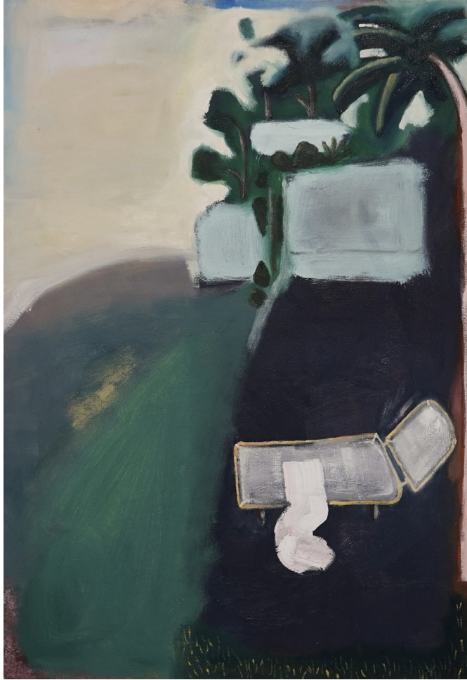
We were modern , oil on linen, 50x70cm, 2023