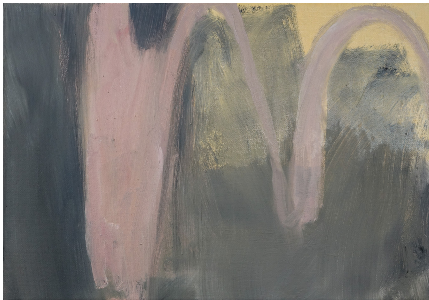
Deux nuits , oil on canvas, 50x36 cm, 2024