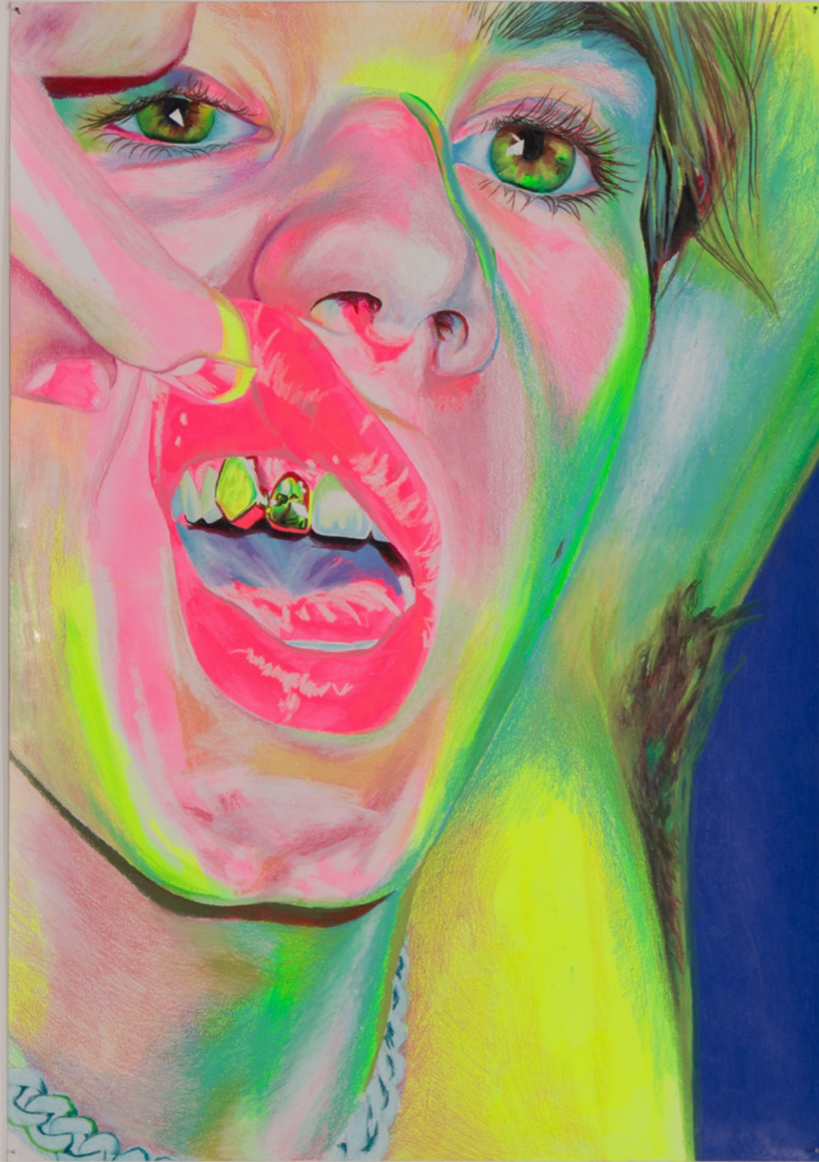
Gleam , 2022, wax crayons, 120 x 90 cm