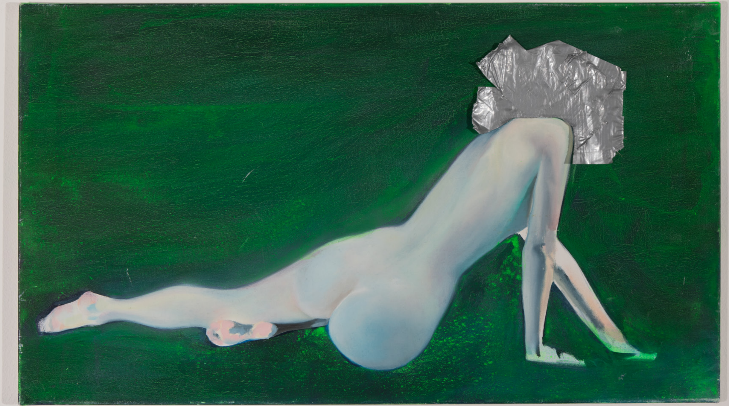
Oscillate, 2020, oil on canvas, 120 x 90 cm