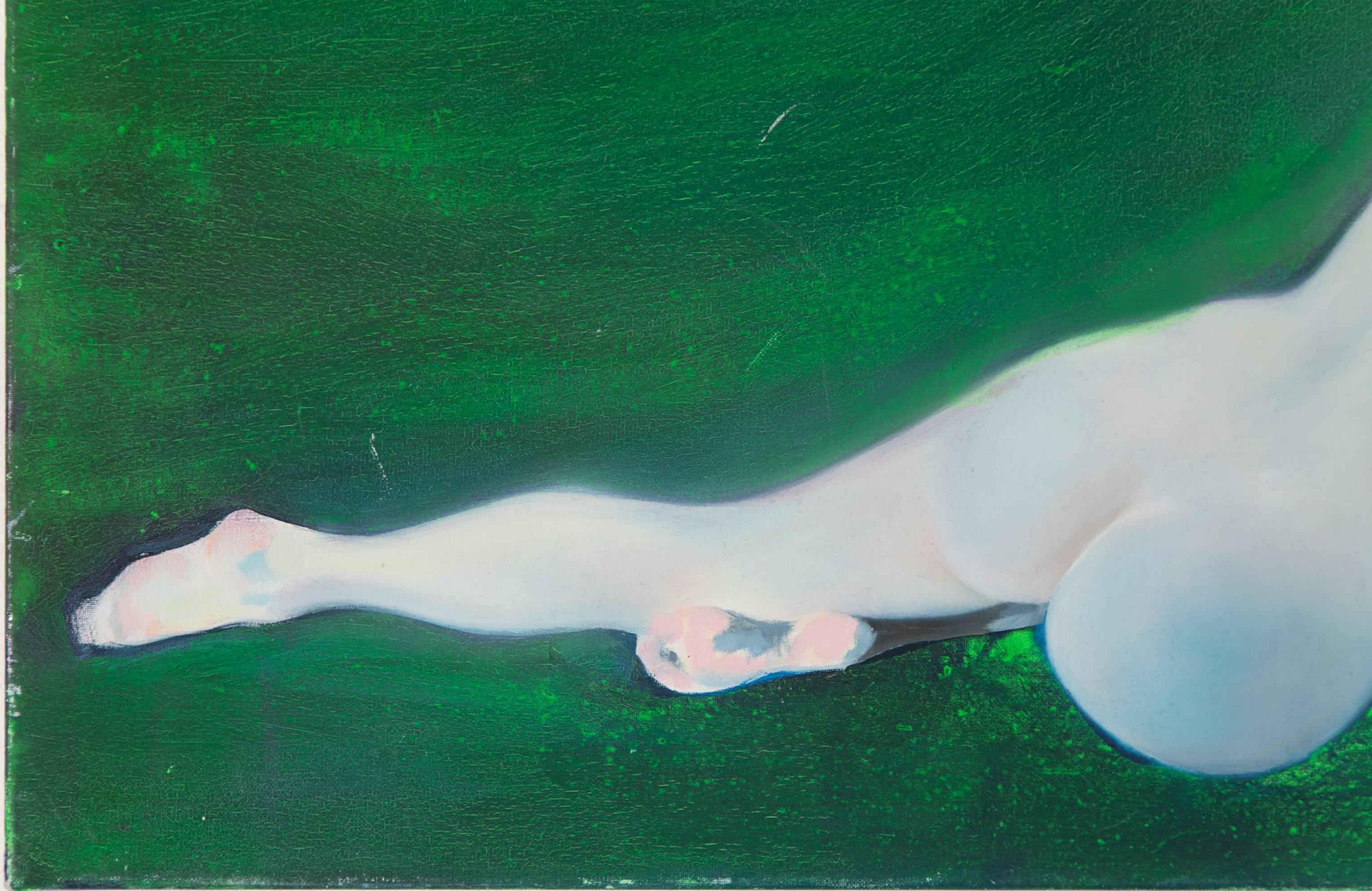
Oscillate , 2020, Close-Up