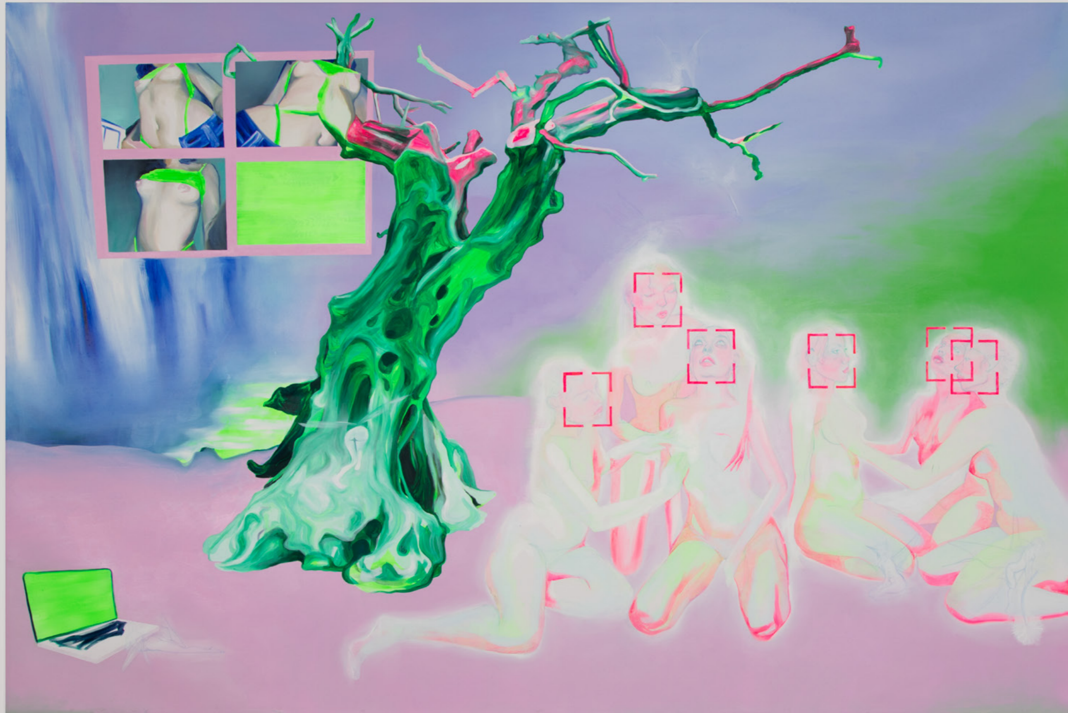
Tree with Landscape , 2023, oil on canvas, 300 x 200 cm