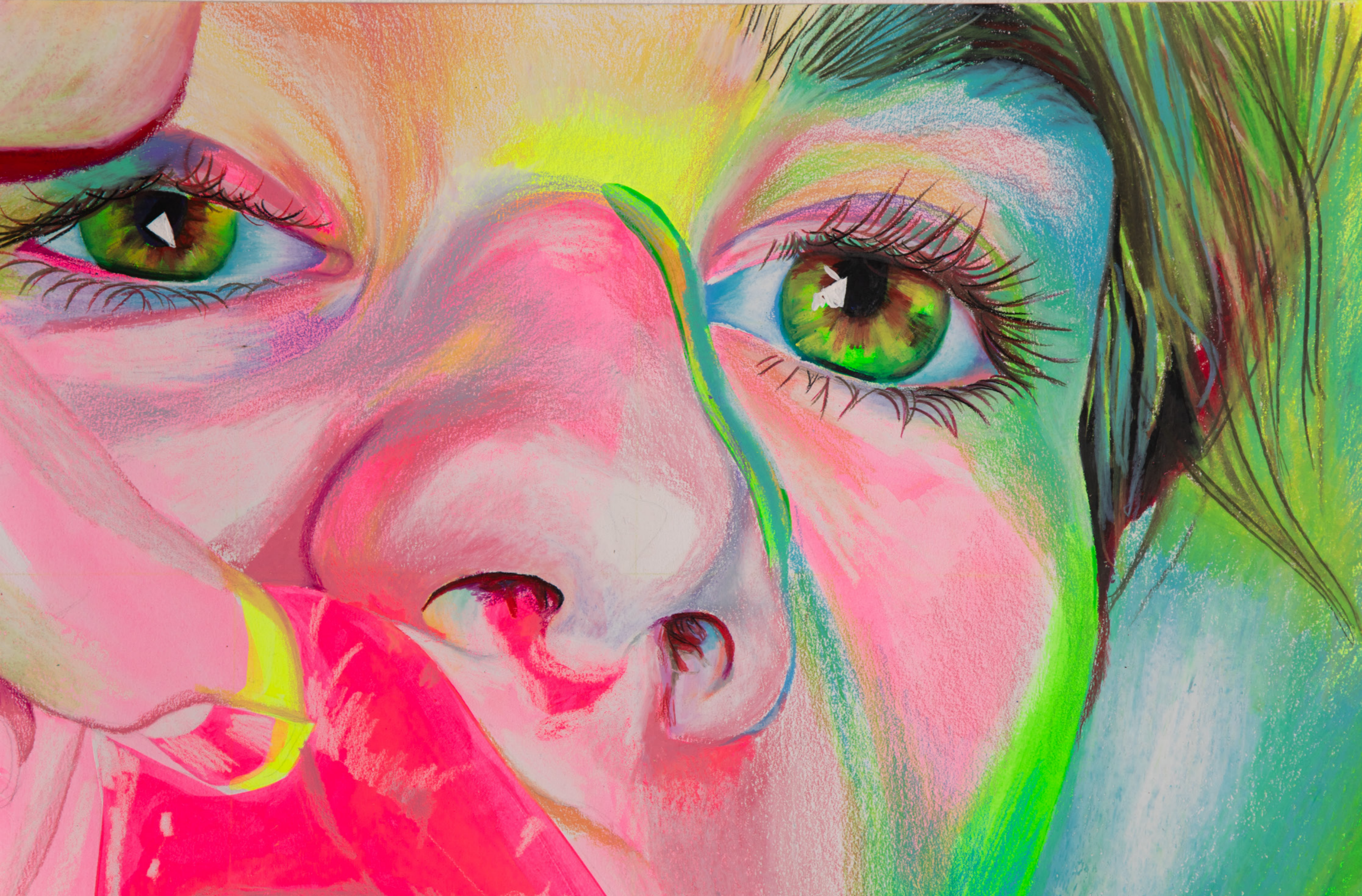
Gleam , 2022, Close-Up