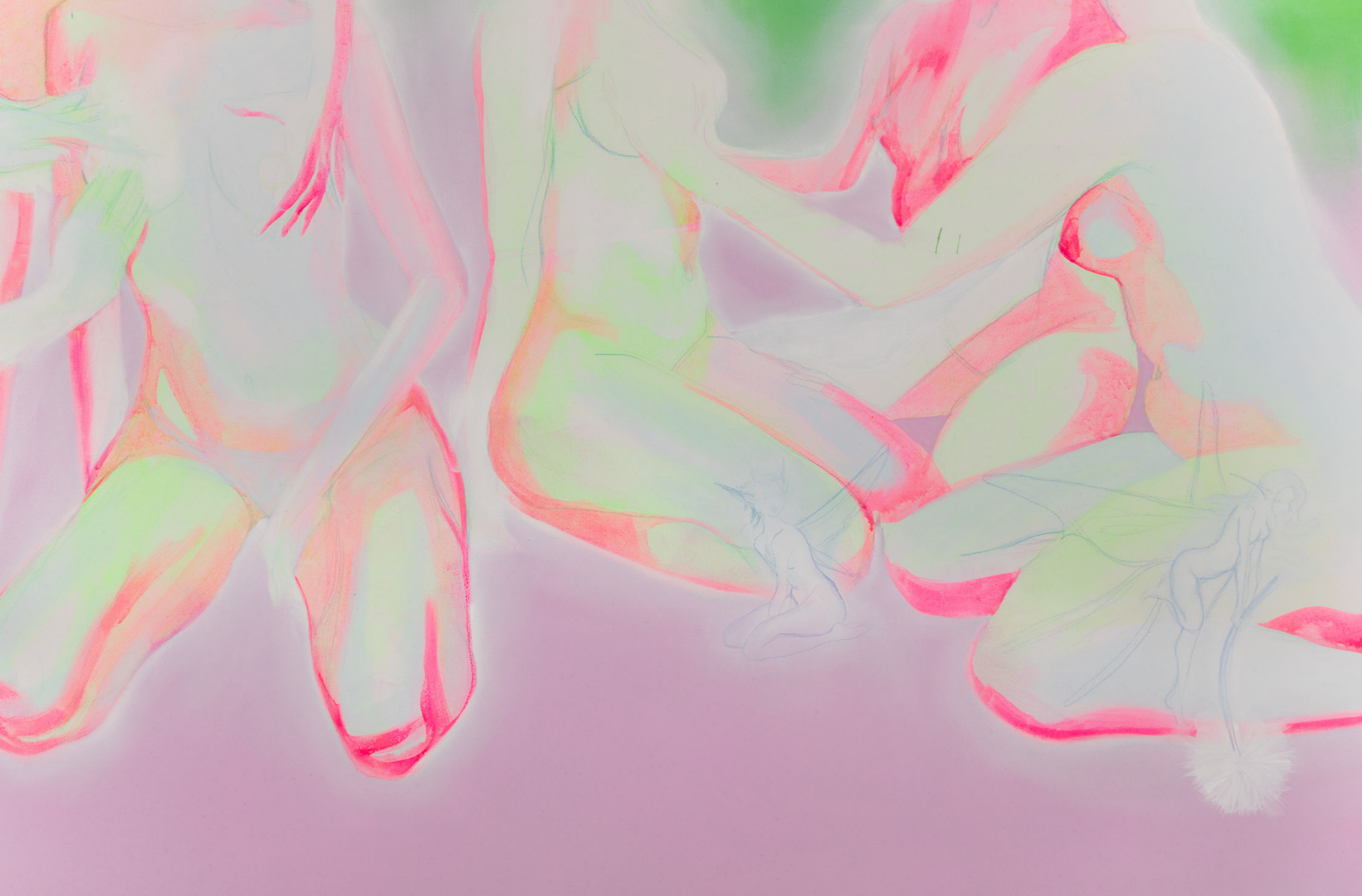
Tree with Landscape, 2023, Close-Up