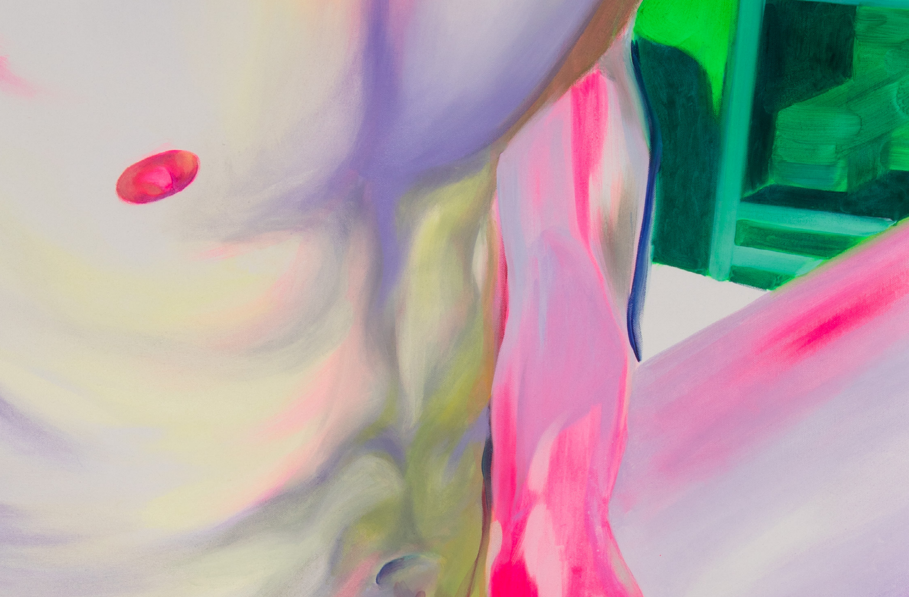
I love our stupid little conversations, 2022, Close-Up