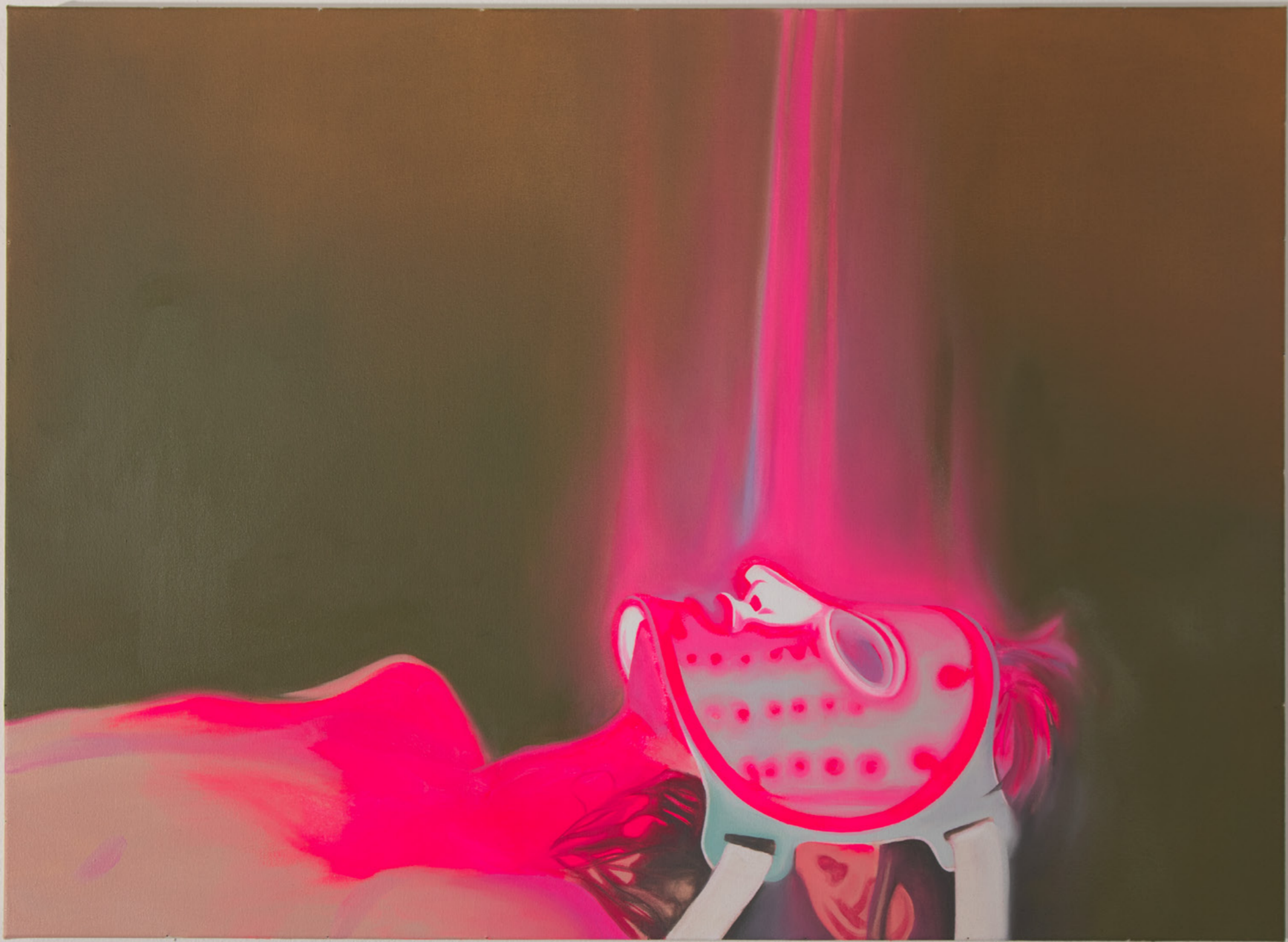
Leaving myself softer , 2024, oil on canvas, 100 x 70 cm