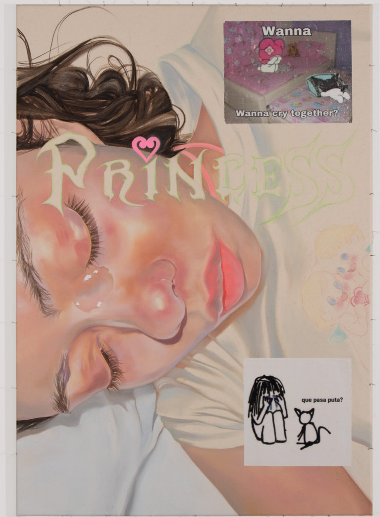
I know ur mistakes and u know mine , 2024, oil on canvas, photo-transfer glue, colored pencils 70 x 100 cm