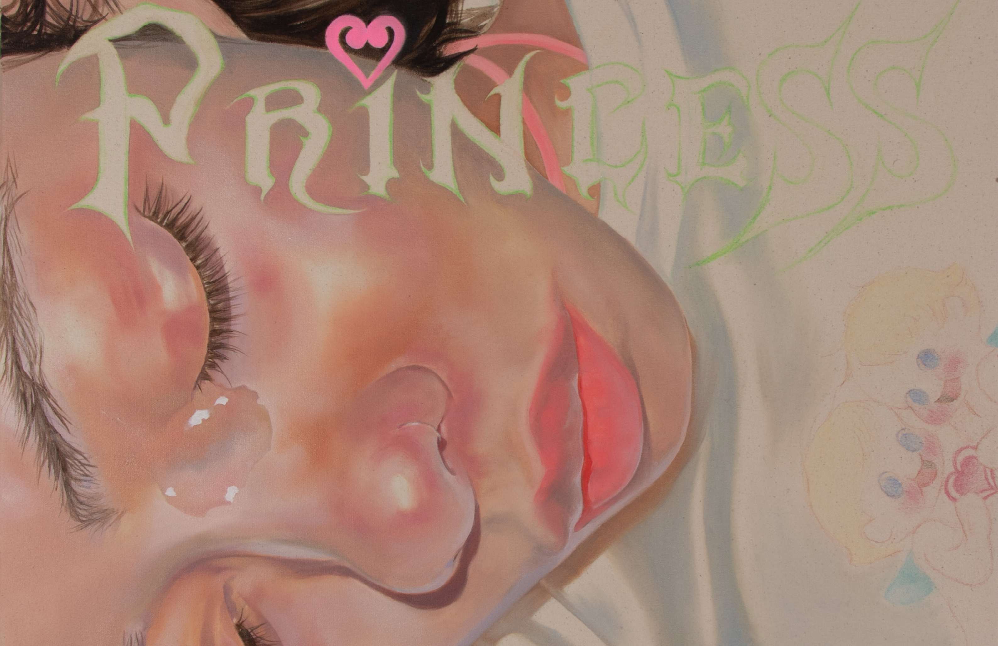
I know ur mistakes and u know mine, 2024, Close-Up