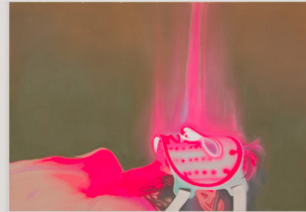
I know ur mistakes and u know mine, 2024, oil on canvas, photo-transfer glue, colored pencils 70 x 100 cm