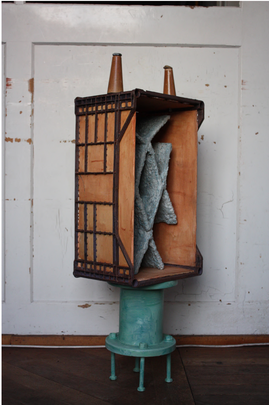
Untitled 2019 Plastic crate, nails, broken furniture, wood, cement, papier-mâché, stones, water-based paint. 95 x 36 x 24 cm