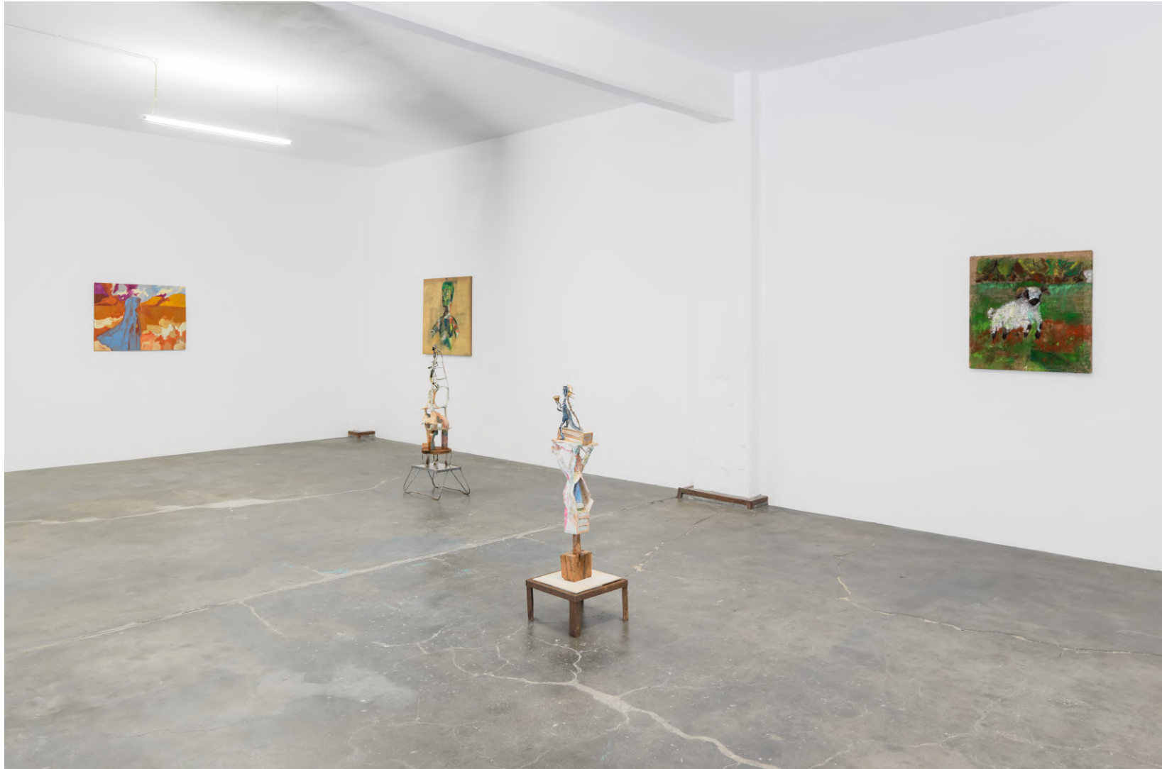
Exhibition view, Gli Ultimi Artisti , Armada, 2018