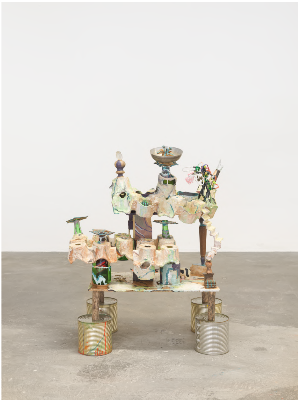
Al pascolo, 2018 Used toys, planting containers, wood, broken glass, metal scraps, papier- mâché, plaster, water-based paint. 80 x 70 x 50 cm