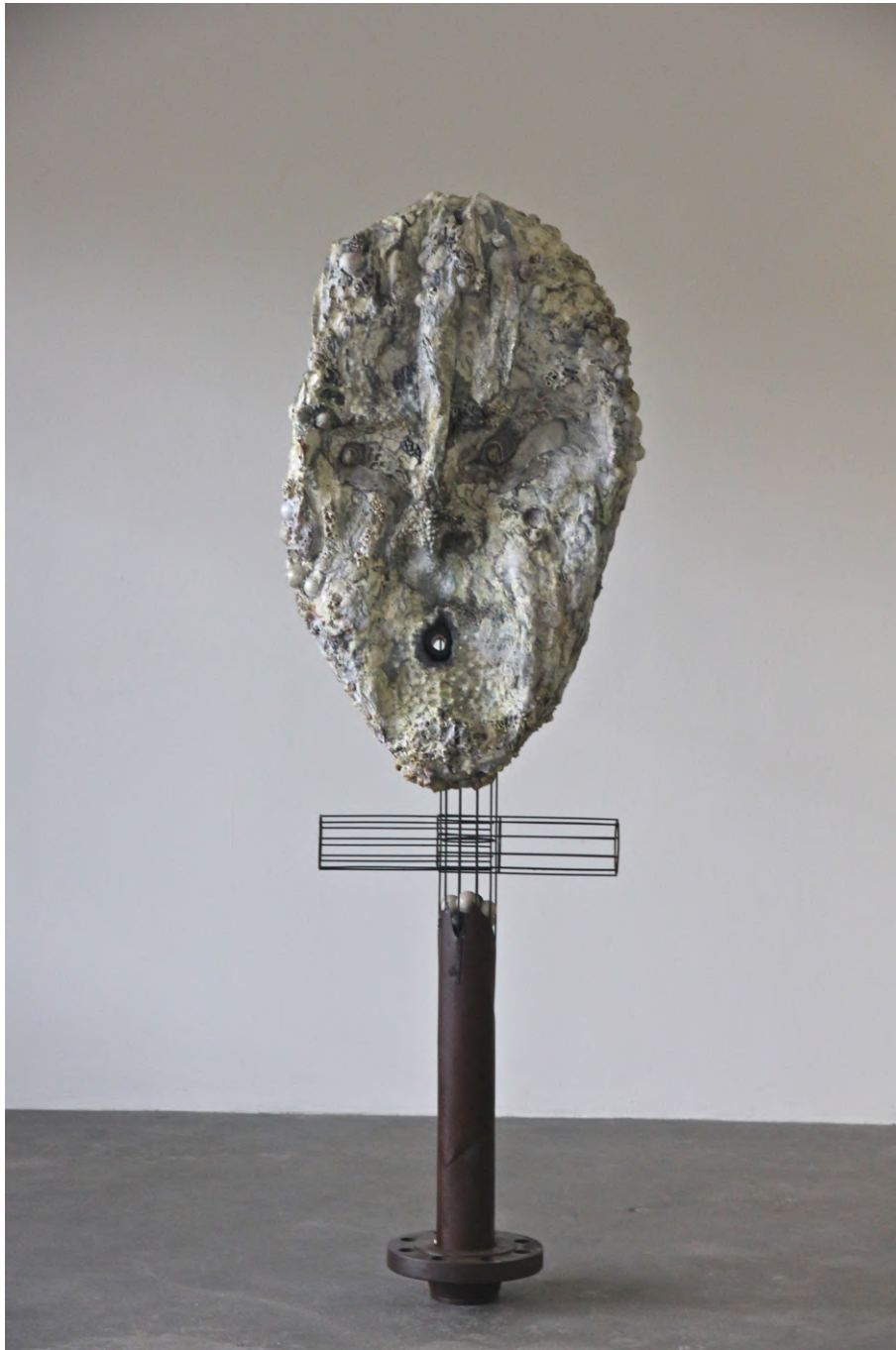
Hermit Moon 2017 Egg shells, barnacles, pine cones, chestnut shells, stones, plaster, papier- mâché, metal scraps, water-based paint. 184 x 60 x 27 cm