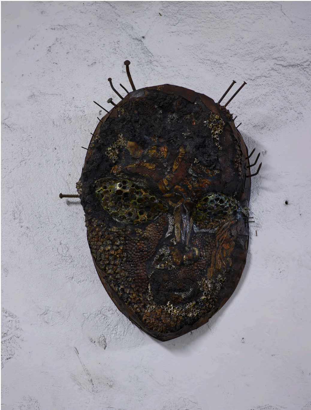
High Priestess, 2016 Fruit skin, pine cones, barnacles, metal scraps, plastic wrap, nails, papier- mâché, water-based paint. 83 x 60 x 18cm