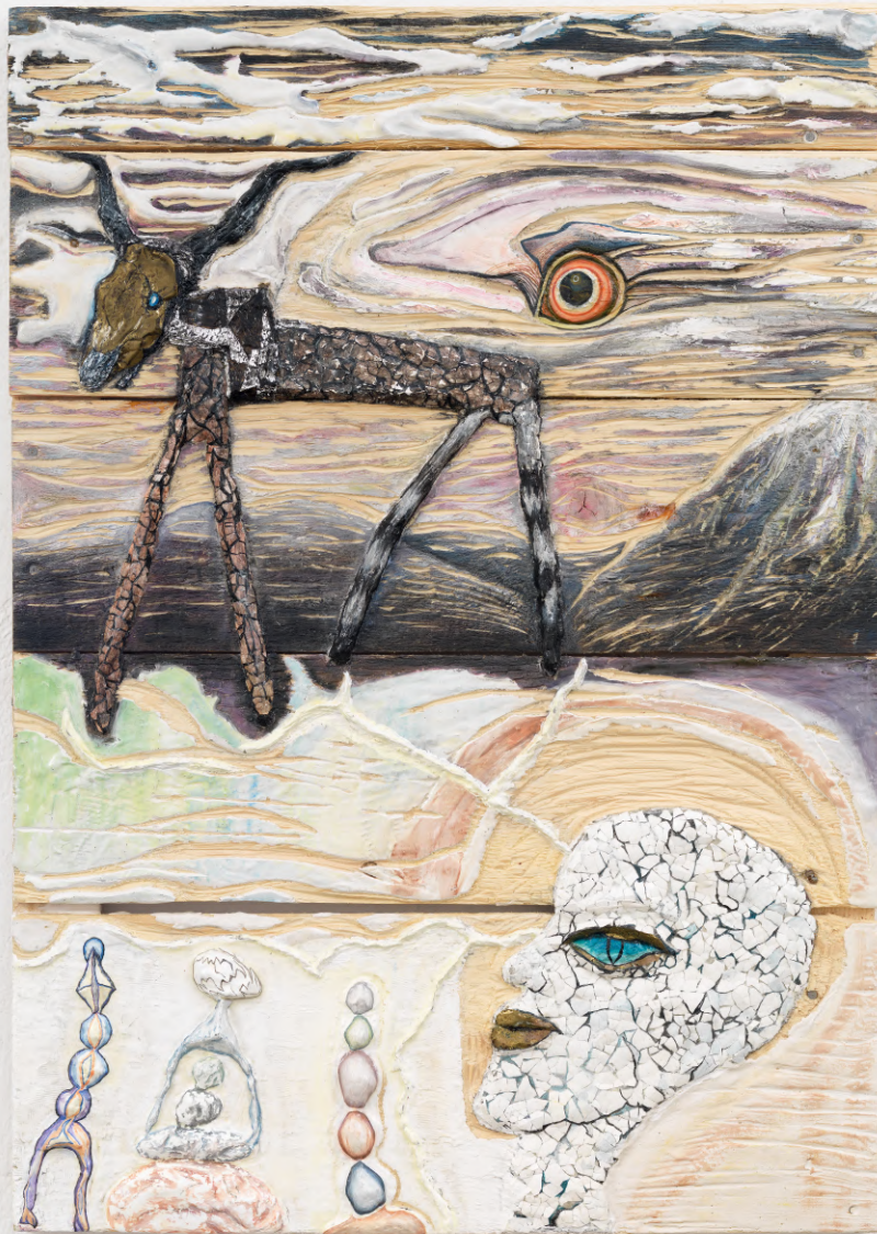
Il confidente della natura 2018 Wood, metal scraps, egg shells, papier- mâché, plaster, water-based paint. 60 x 46 x 6 cm