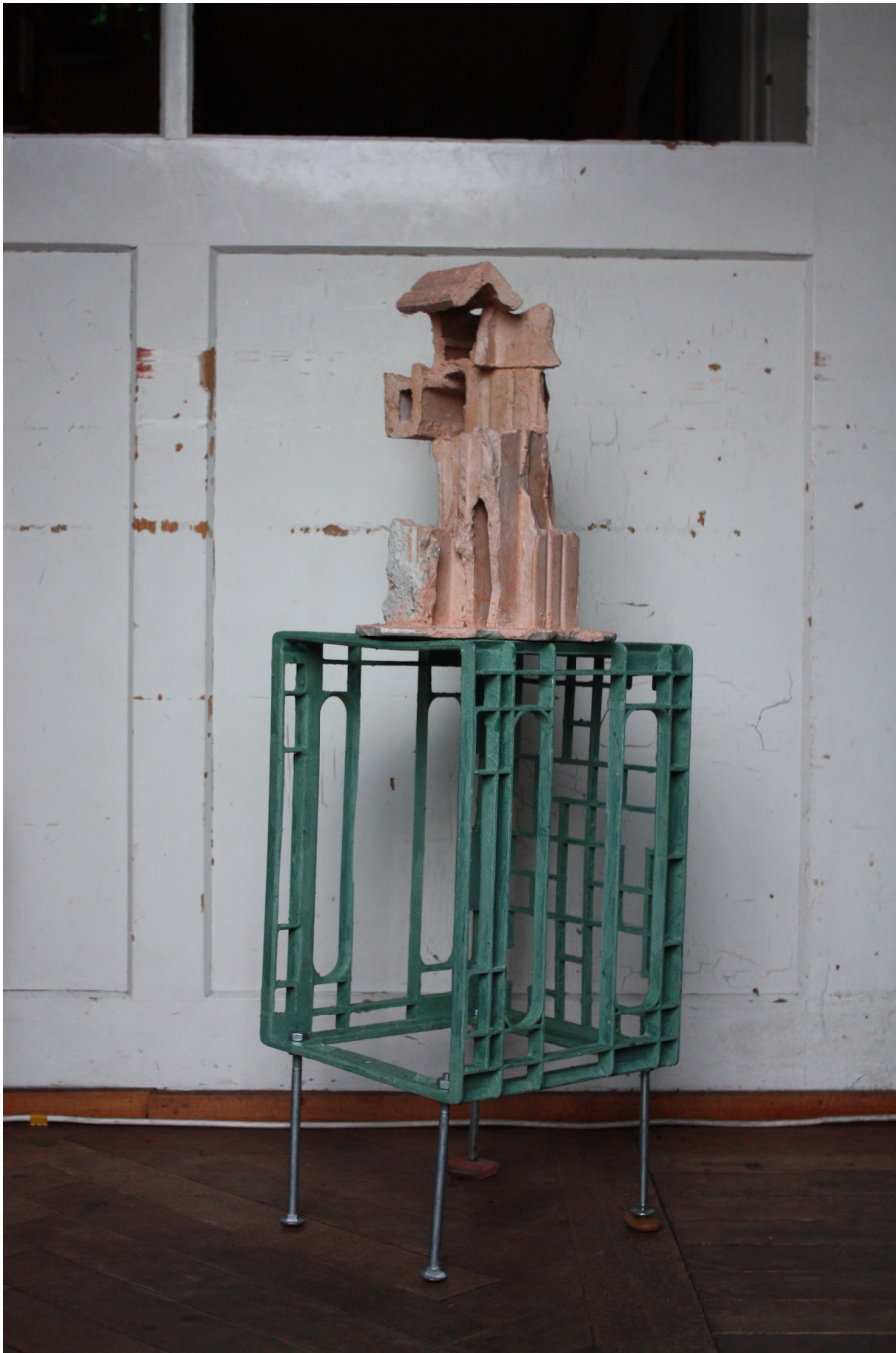
Untitled 2019 Plastic crate, nails, broken bricks, ceramic tile, stones, water-based paint. 110 x 37 x 35 cm