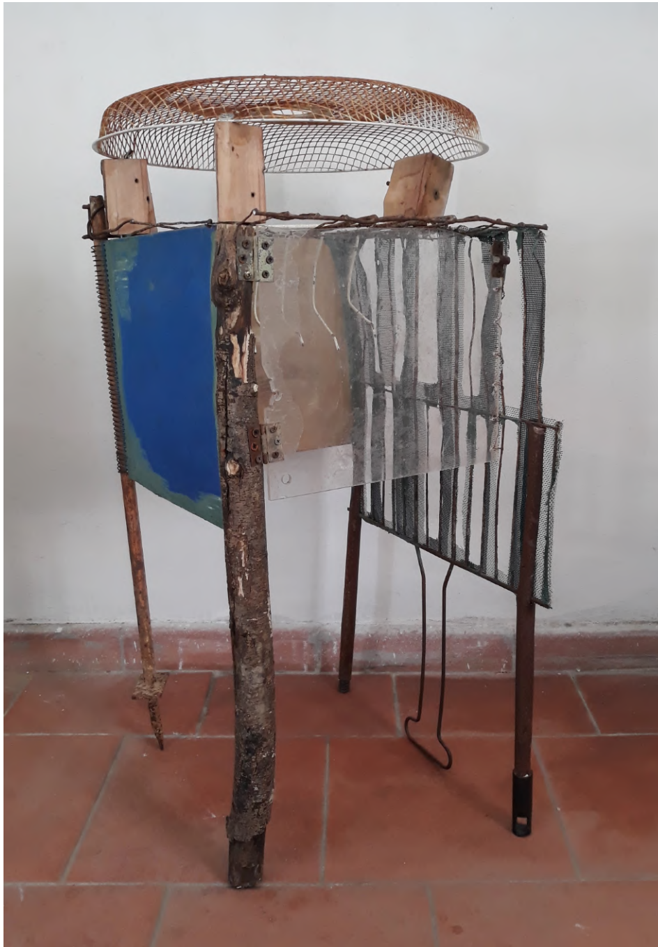
Untitled 2020 Metal fan guard, grills, cloth, book cover, wood, plexiglass, metal scraps, wire, plaster, water-based paint. 85 x 42 x 44 cm