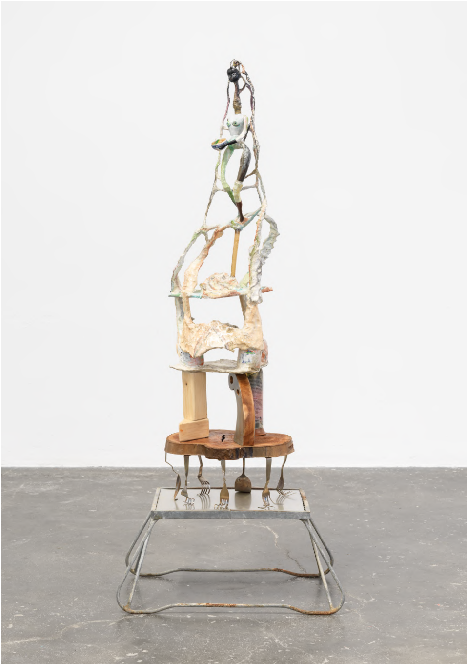
Santa Maremma 2018 Used toys, candle, broken furniture, broken glass, forks, spoons, metal scraps, plaster, papier-mâché, water- based paint. 120 x 40 x 26 cm