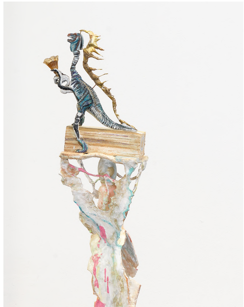
Left to right, details, Santa Maremma , Frustone , 2018