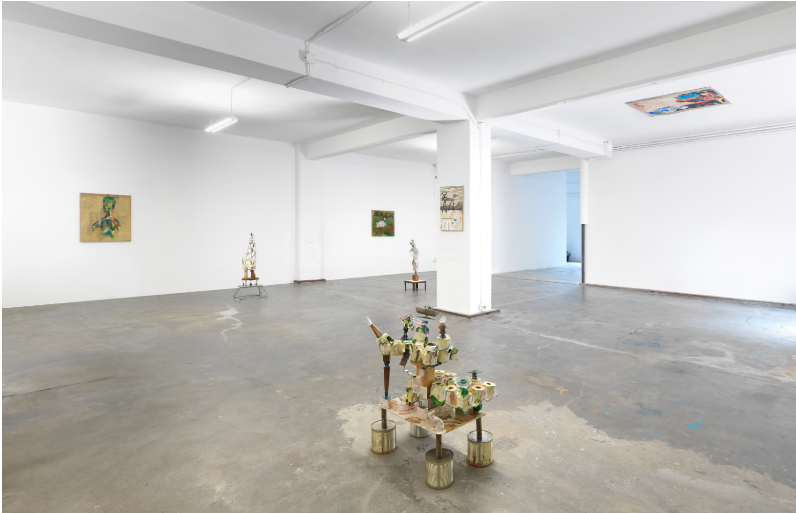
Exhibition view, Gli Ultimi Artisti , Armada, 2018