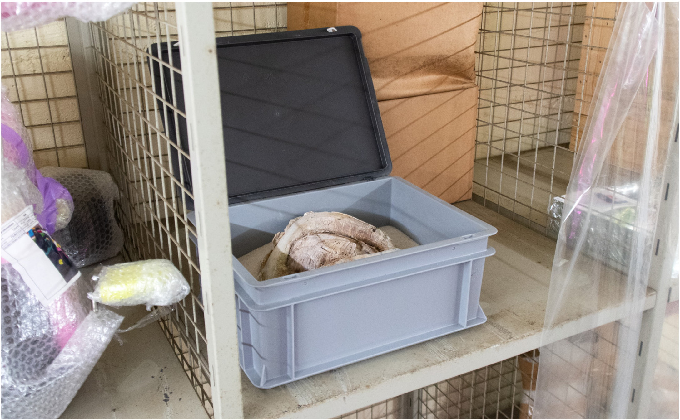
guardian of stories , 2023 watercolor on plaster, quartz sand, rako box 40 × 30 × 20 cm installation view, aux abris , civil protection shelter, Lausanne