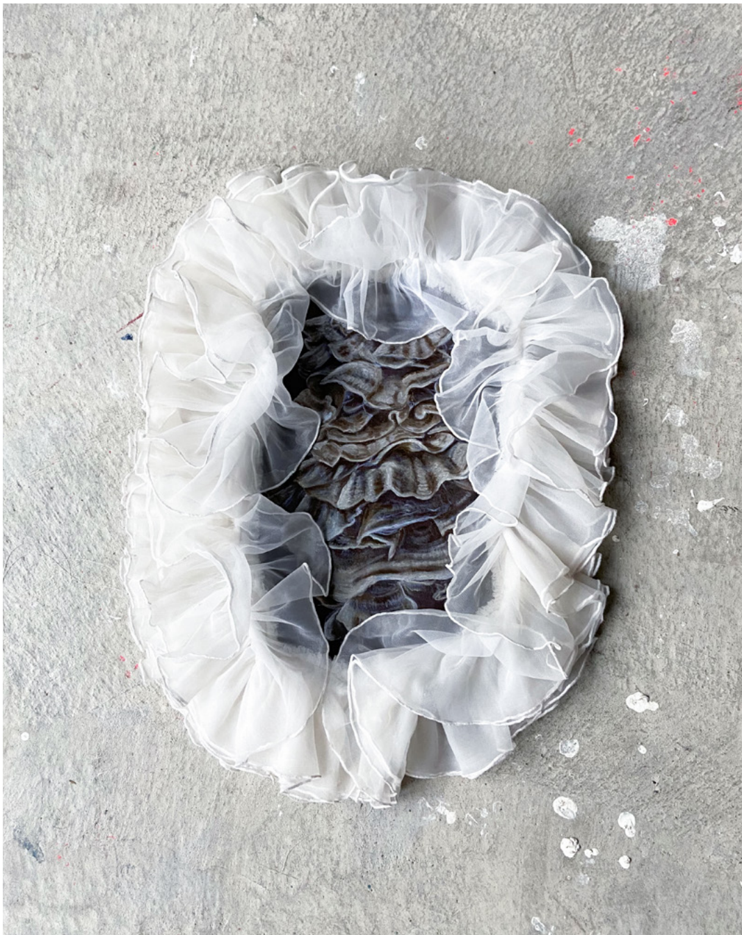
Wandler 50 × 35 × 7 cm, 70 × 10 cm detail view