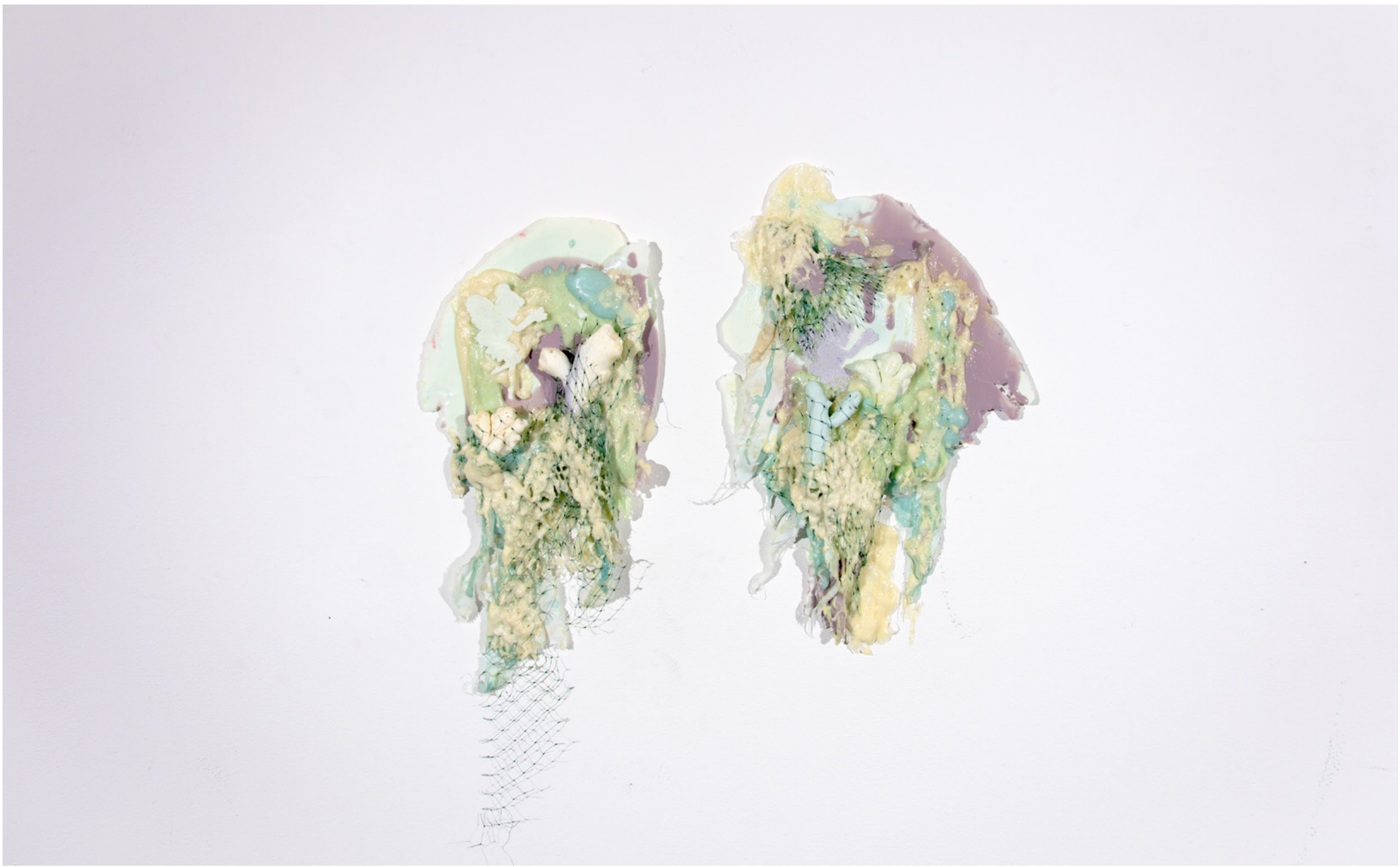
gates to faerie , 2020 polyurethane, pu foam, net 60 × 55 × 5 cm studio view