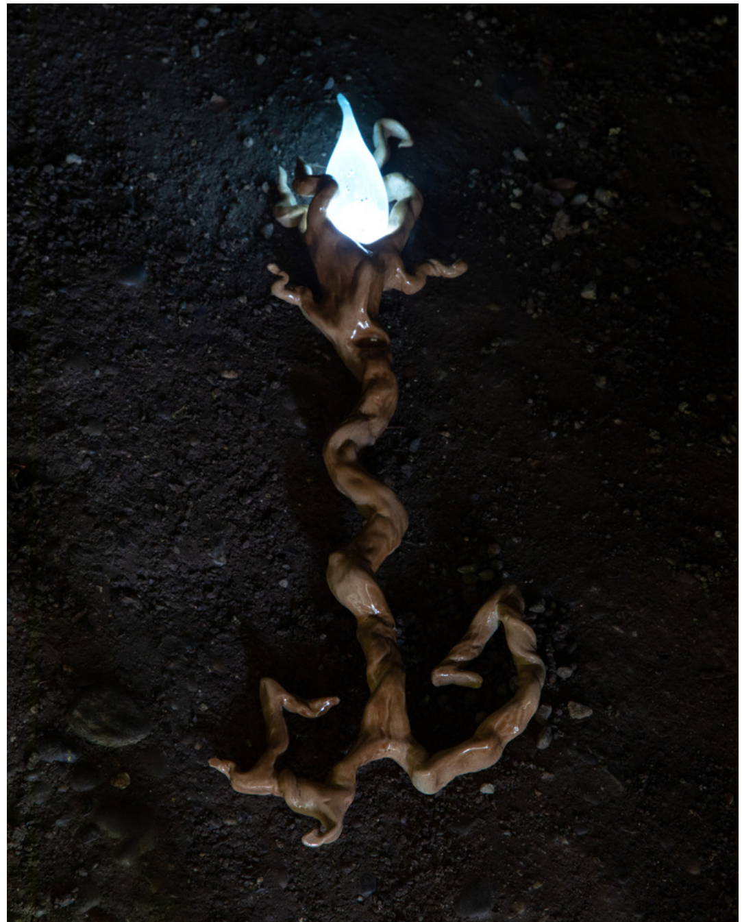
under the spell , 2022 glazed ceramic, resin, LED light 40 × 12 × 5 cm

installation view, photos by Paulo Wirz, dragon's lair , Küssnacht, Zurich