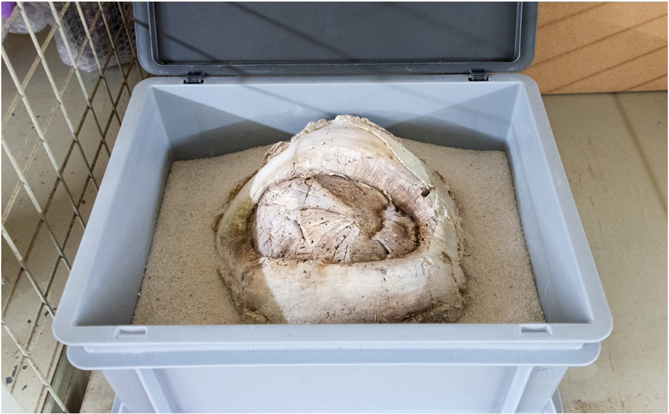
guardian of stories detail view