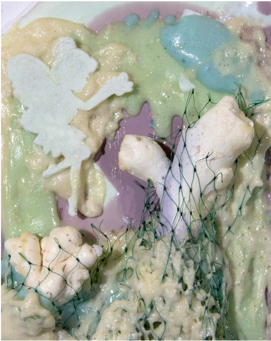
gates to faerie detail view