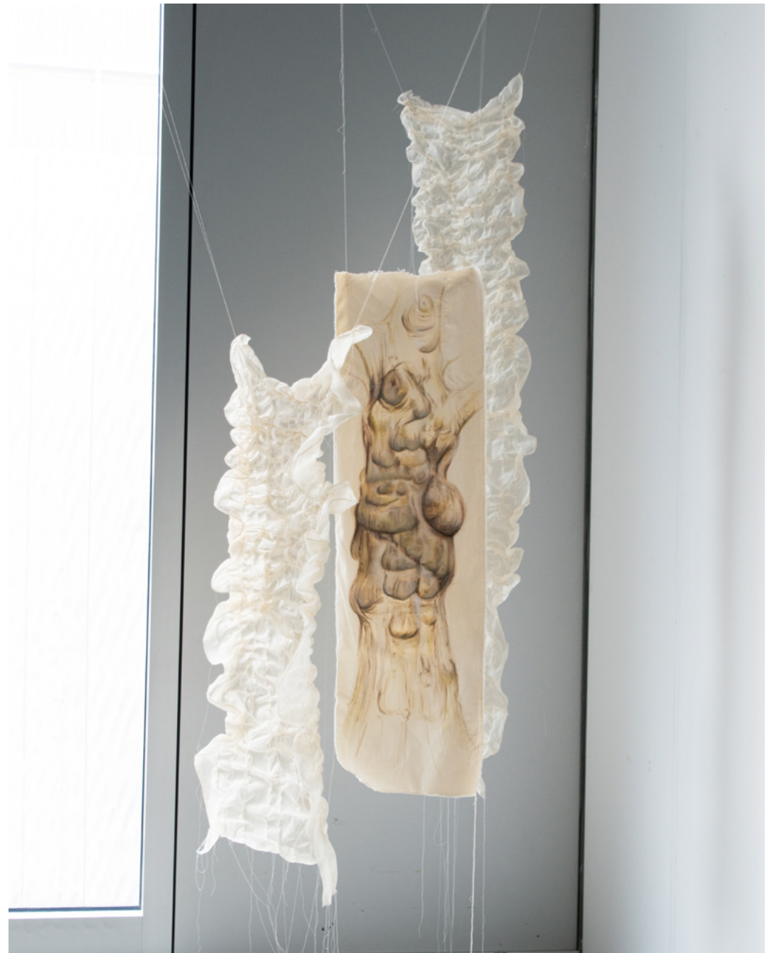
Wandler 100 × 30 × 20 cm, 120 × 40 cm detail view