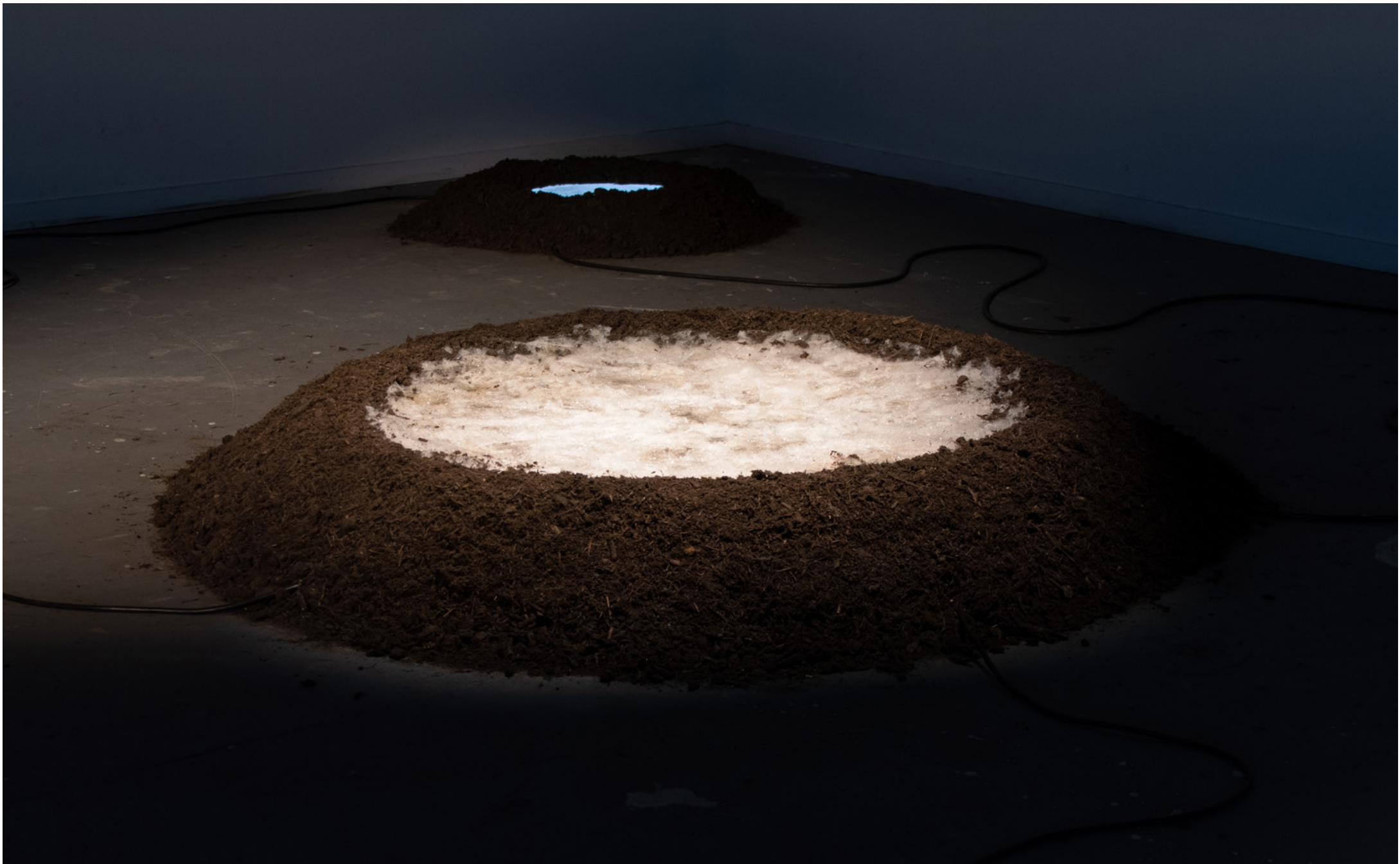
hyfae detail view