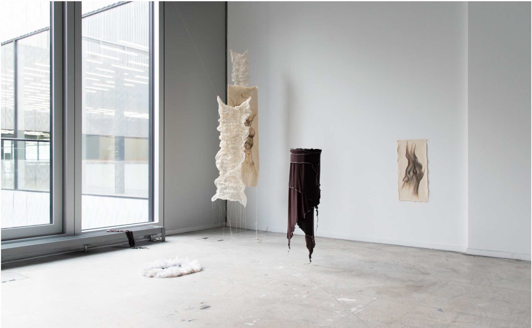
Wandler , 2021 oil on textile various dimensions installation view, Semesterausstellung , Zurich University of the Arts, Zurich