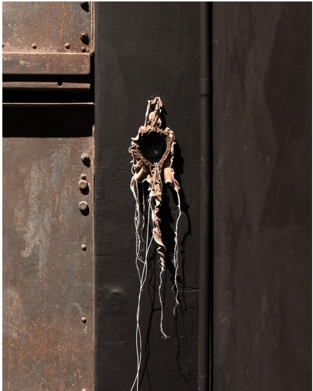
thresholds , 2022 textile, speaker, audio (4'48" loop) 35 × 10 × 2 cm, click here to listen installation view, the hidden corner of my neurons , 93, Basel