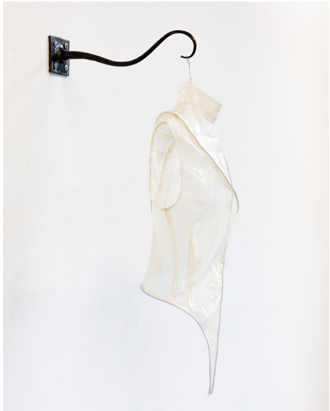
chrysalis , 2023 textile, resin, wire, glazed ceramic 90 × 30 × 40 cm installation view, photos by Oliver Kümmerli, it makes the spider kiss the fly , Zurich University of the Arts, Zurich