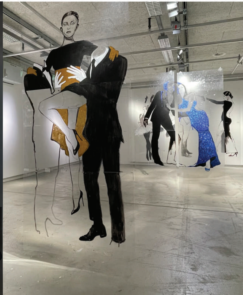
BATTLEFIELD painting 2021 200 × 1350 acrylic, glitter on plexy glass