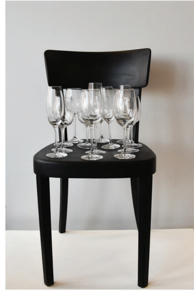
COMA BLACK installation 2023 life-size wooden chair, glass, ink