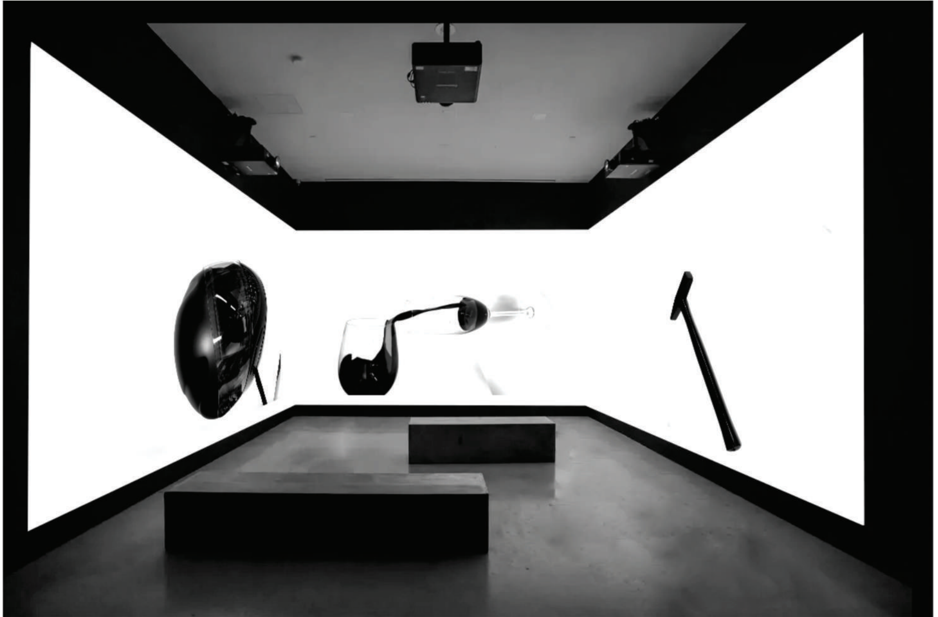
NEON NOIR video installation 2023 3 channel video