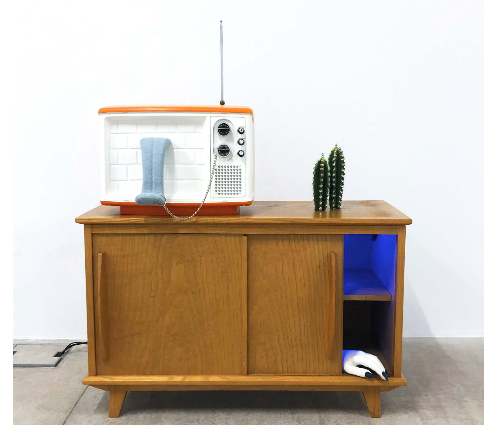
Untitled (studio portable II) , 2021, wood, celullar concrete, jeans, found television, LED, furniture, plastic cactus, metal plug, chains, satin glove, installation view from the exhibition : Kunst(Zeug)Haus - Rapperswill-Jona