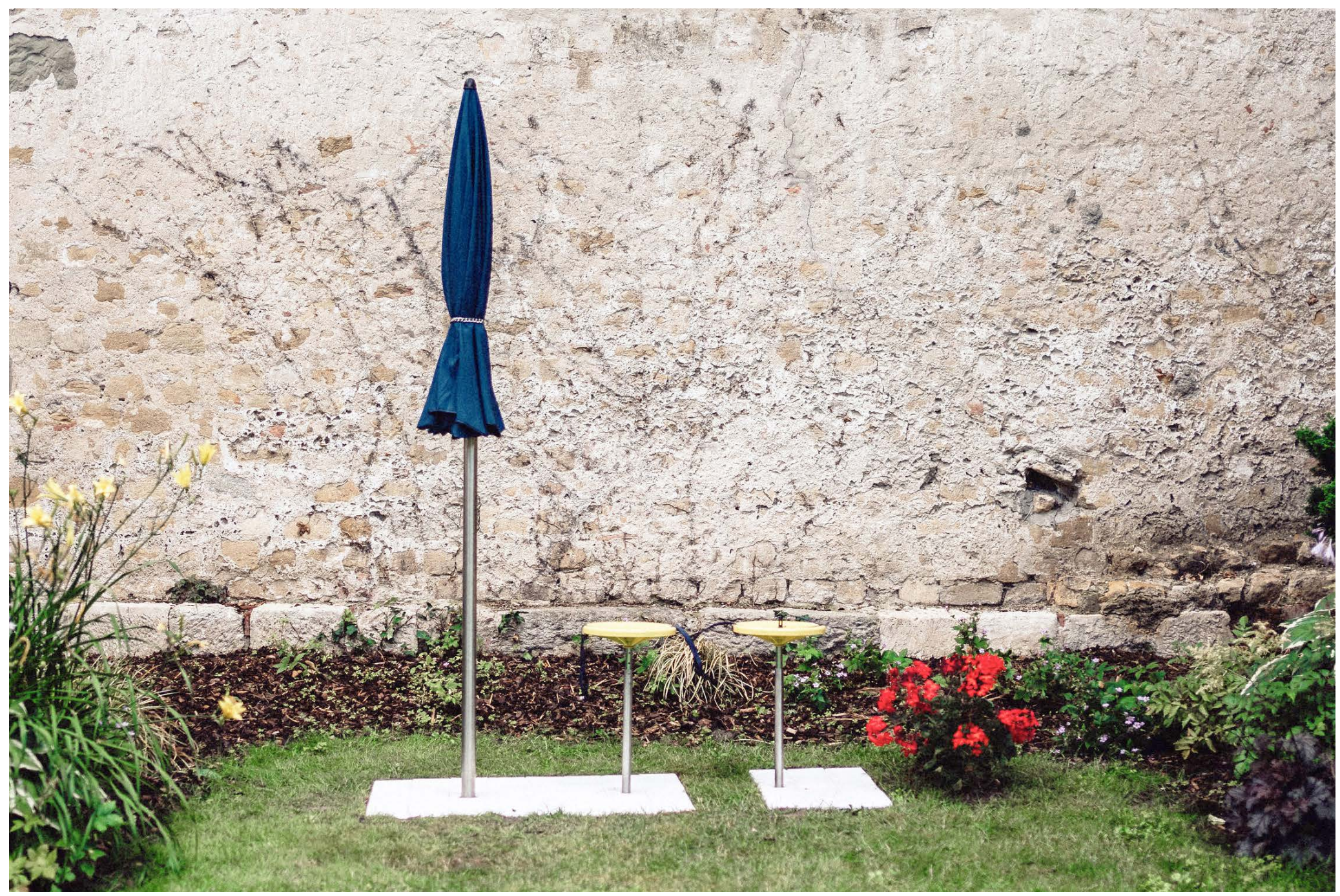
Temps Morts, 2022, celullar concrete, botte-cul, steel, leather, chains, lock, metal rivet, 140x50x60, installation view from the exhibition : Double vie - Avenches