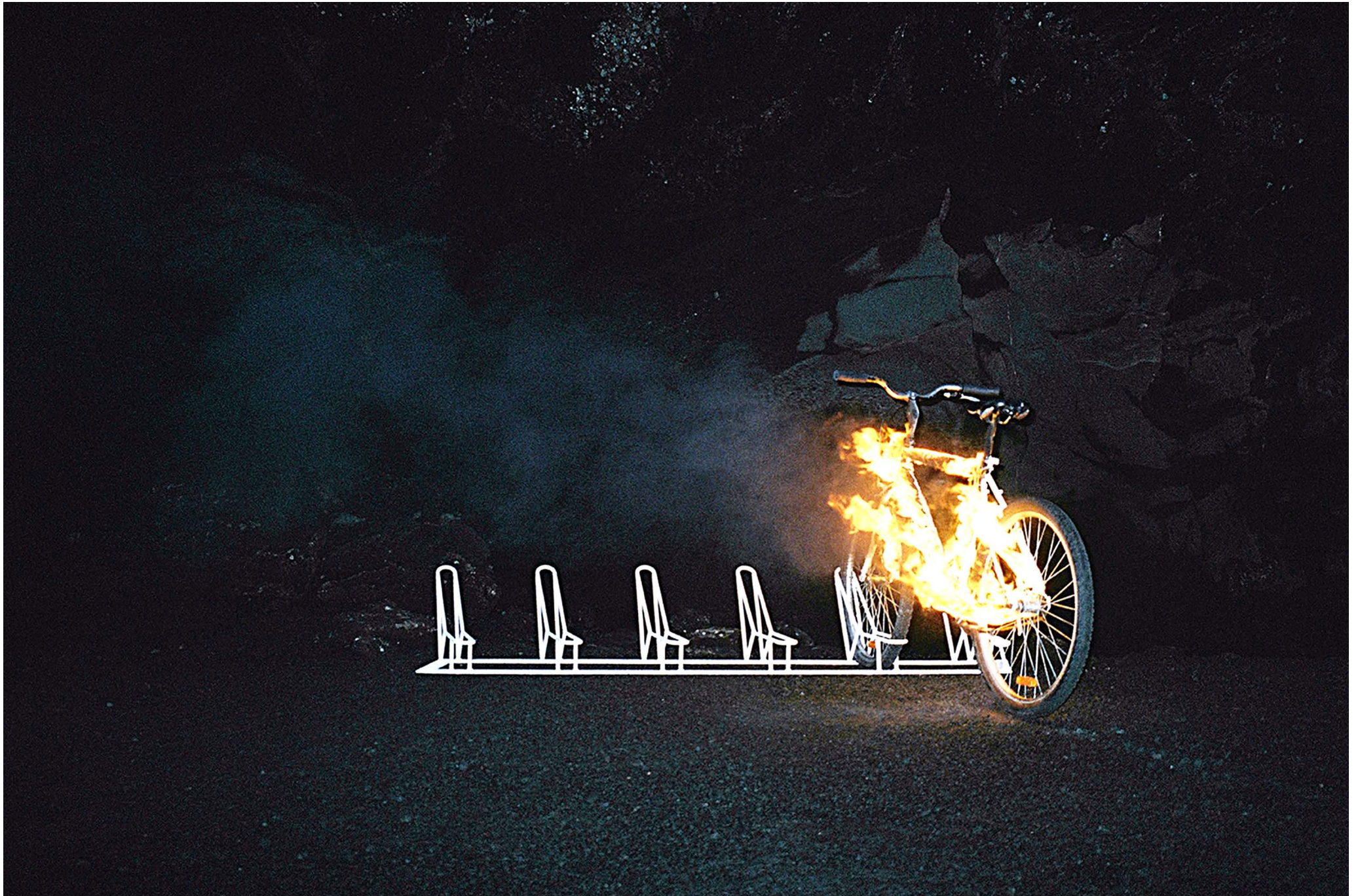
Please, help yourself. 2019, found objects, installation view from the exhibition/performance : Vesturbær Biennale - Reykjavik, https://vimeo.com/378556165