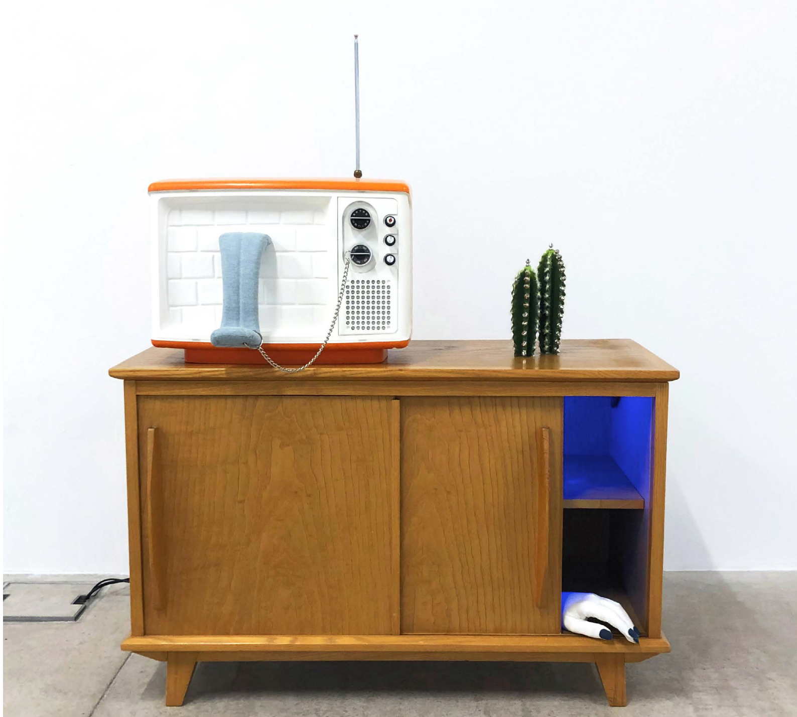
Untitled (studio portable II) , 2021, wood, cellular concrete, jeans, found television, LED, furniture, plastic cactus, metal plug, chains, satin glove, installation view from the exhibition : Kunst(Zeug)Haus - Rapperswill-Jona