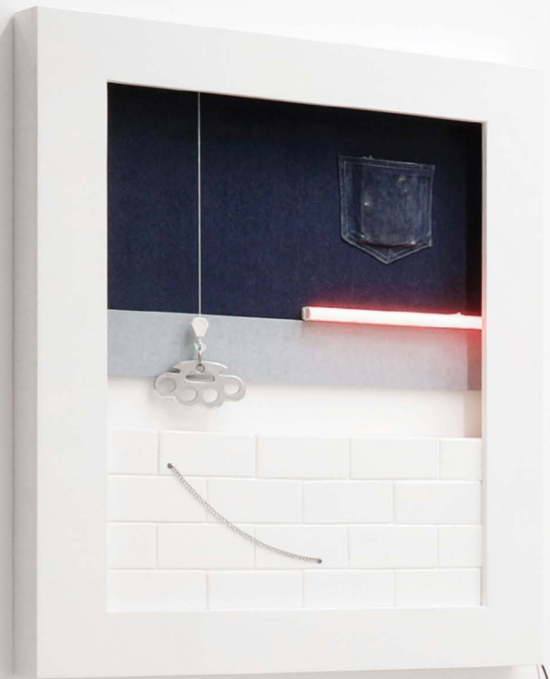
Under my thumbs , 2021, wood, celullar concrete, jeans, LED, DIY american fist, t-shirt, chains, metal plug, found objects, 100x80x10, installation view from the exhibition : Gallery Fabienne Levy - Lausanne