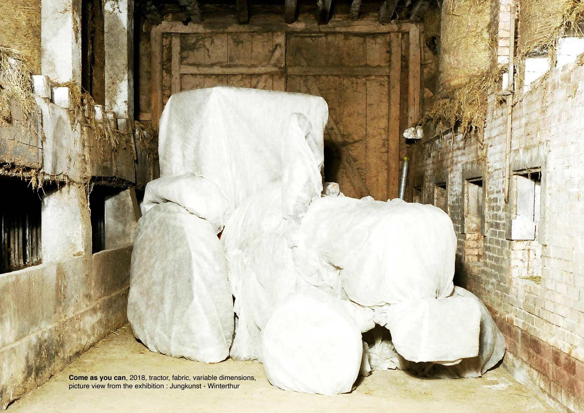
Come as you can , 2018, tractor, fabric, variable dimensions, picture view from the exhibition : Jungkunst - Winterthur