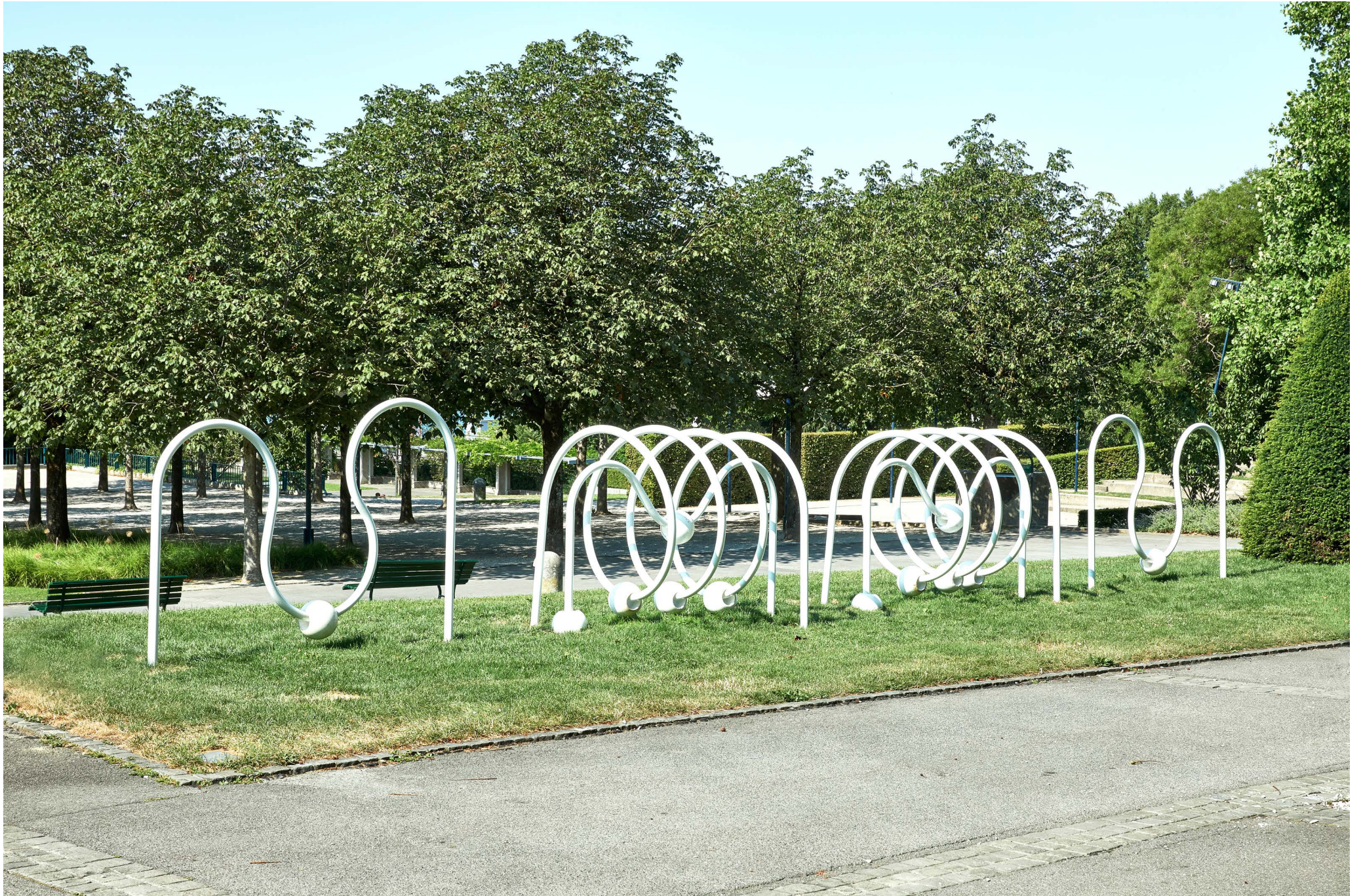
Douze mois par an , 2019, steel, wood, 2k painting, concrete, 8500x185x145, installation view from the exhibition : Visarte prize - Lausanne