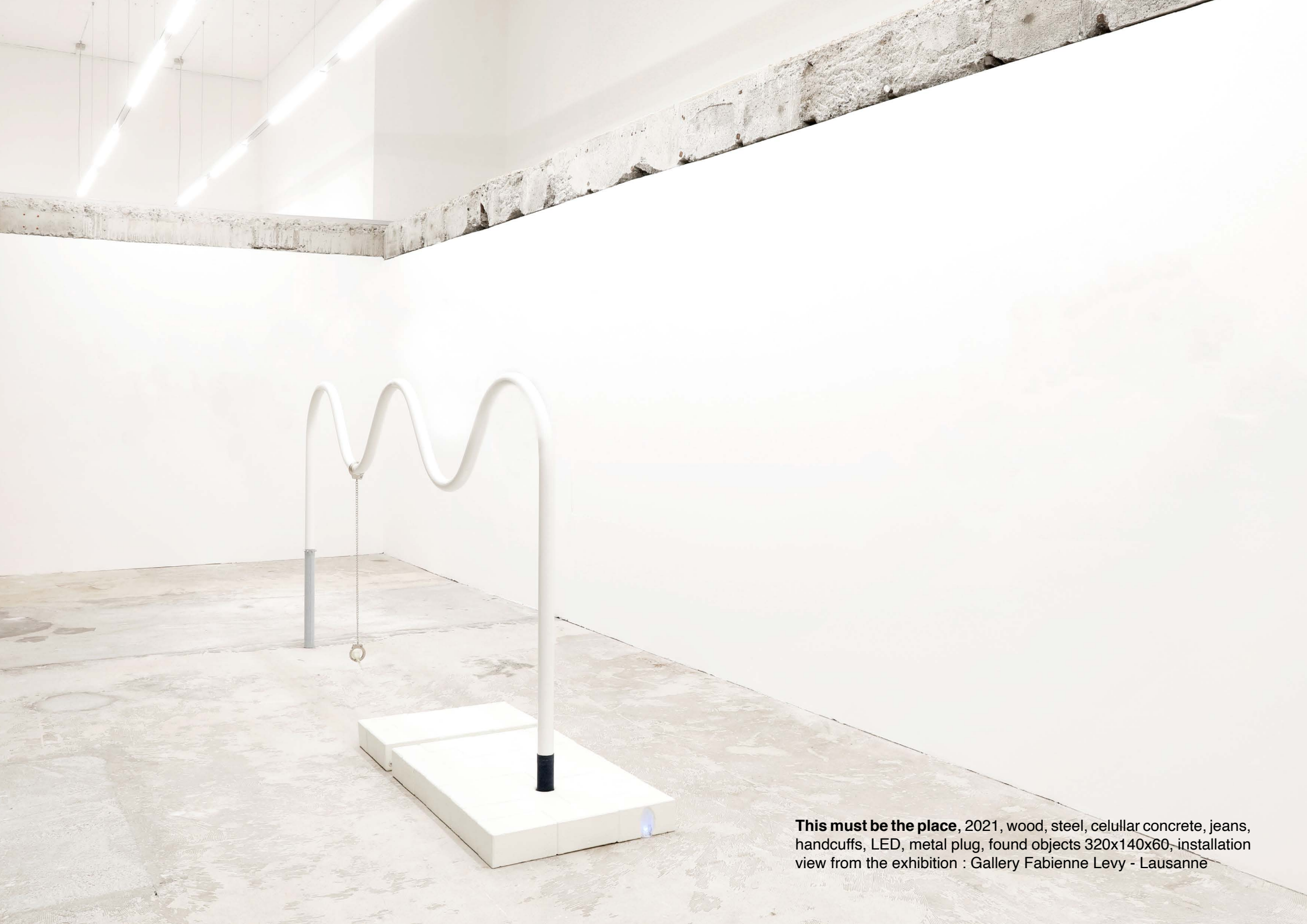
This must be the place , 2021, wood, steel, cellular concrete, jeans, handcuffs, LED, metal plug, found objects 320x140x60, installation view from the exhibition : Gallery Fabienne Levy - Lausanne