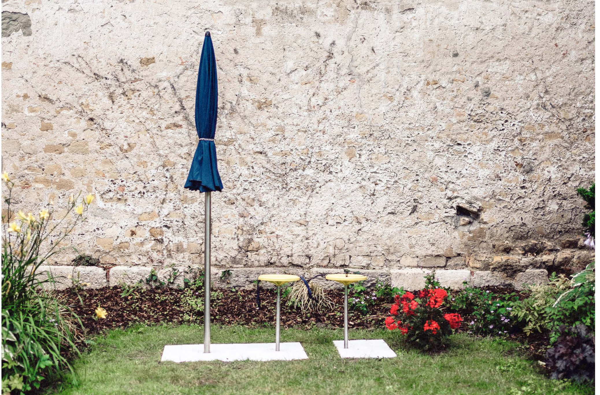
Temps Morts , 2022, cellular concrete, botte-cul, steel, leather, chains, lock, metal rivet, 140x50x60, installation view from the exhibition : Double vie - Avenches