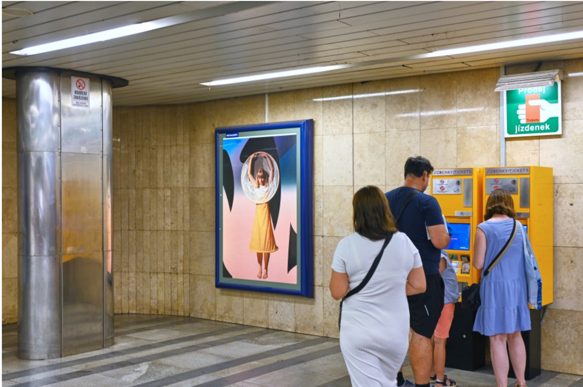
The Next Stop? exhibition, Můstek metro station, Prague, 2022