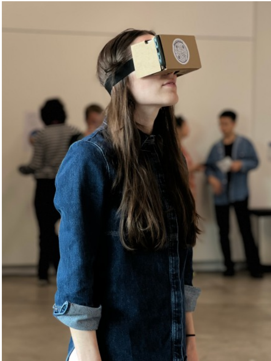
ACT Performance Festival Zurich 2023 Toni Areal, Zurich