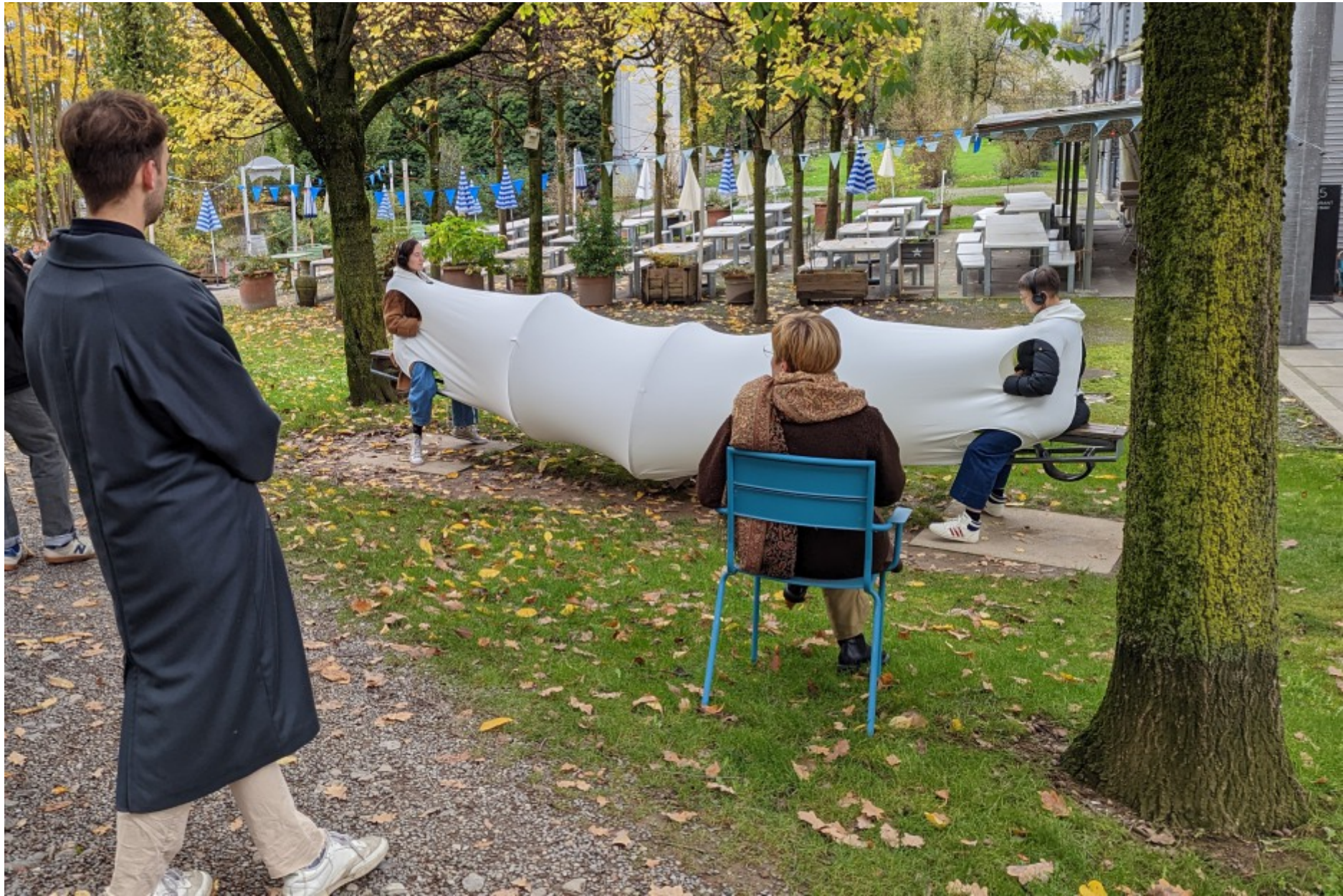
near Hardturmsteg, Zurich (2022)