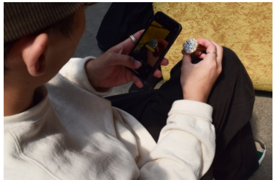
ACT Performance Festival Biel (2022)