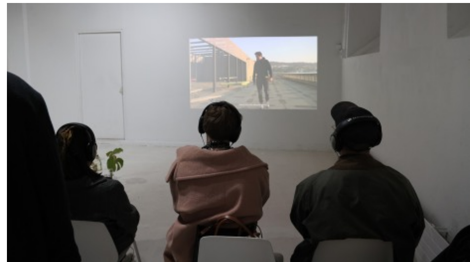
Shifting Coordinates exhibition (2023) Offspace Flüelastrasse, Zurich