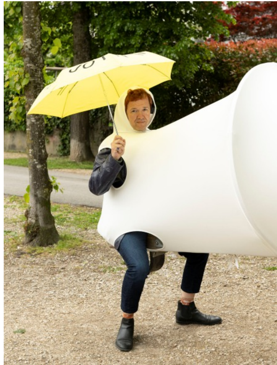
ACT Performance Festival Biel (2022)