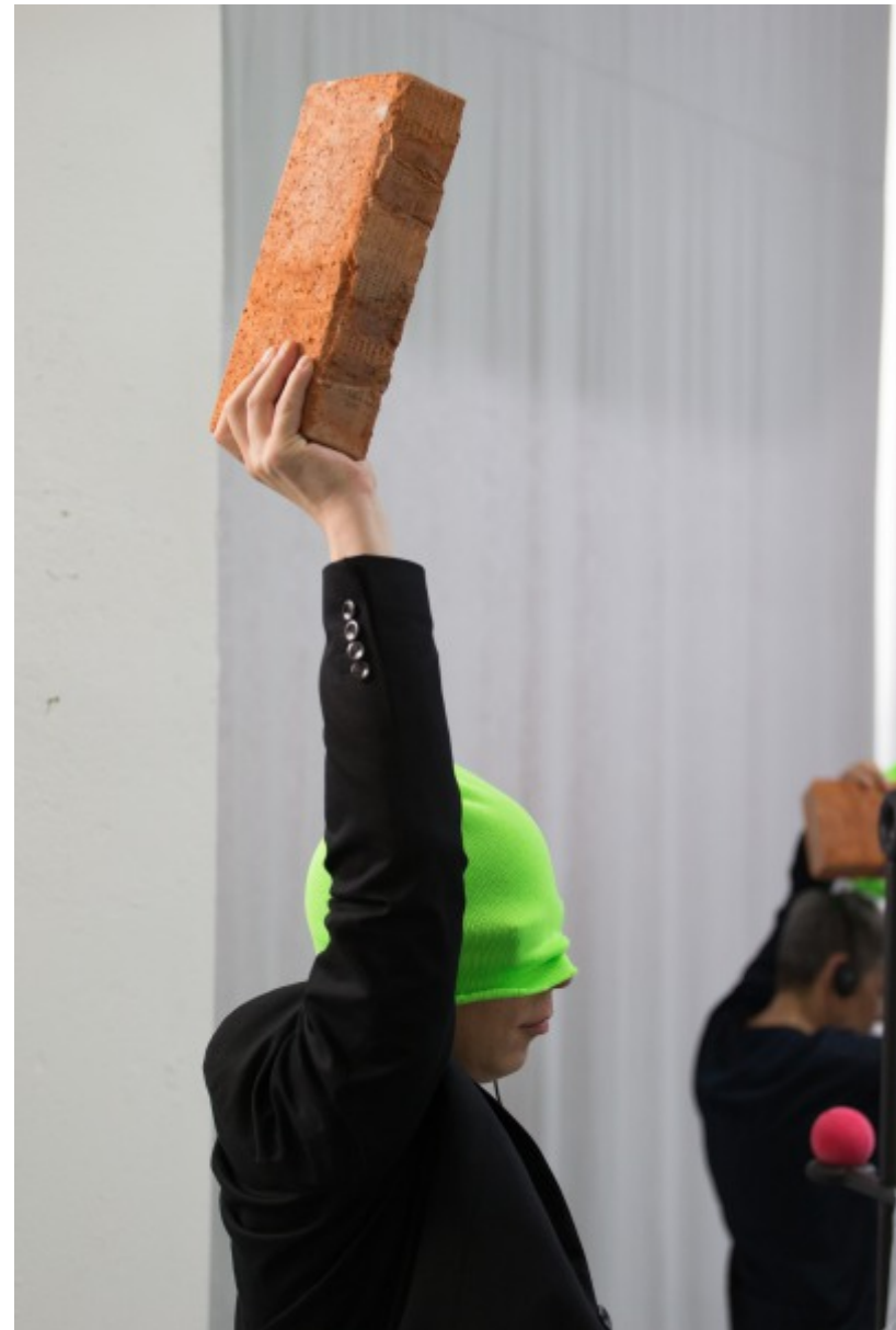
Another Place exhibition (2018), Academy of Fine Arts in Prague