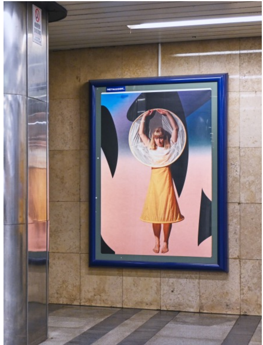
The Next Stop? exhibition (2022) Můstek metro station, Prague