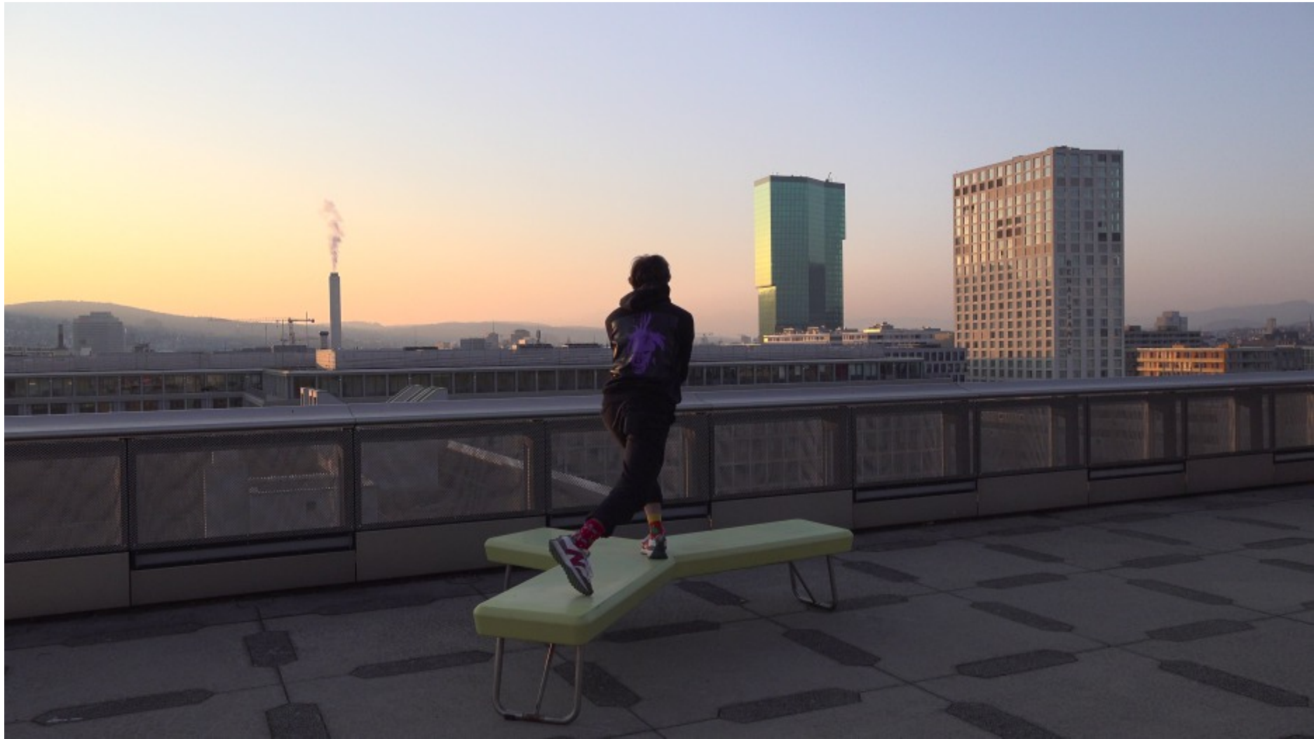
screenshot from the video