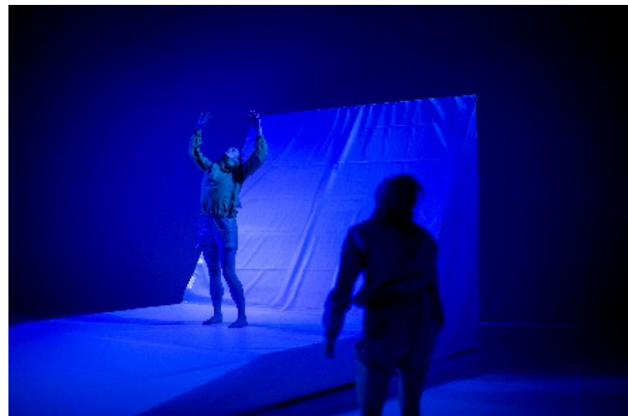
premiere in Ponec theater, Prague (2020)