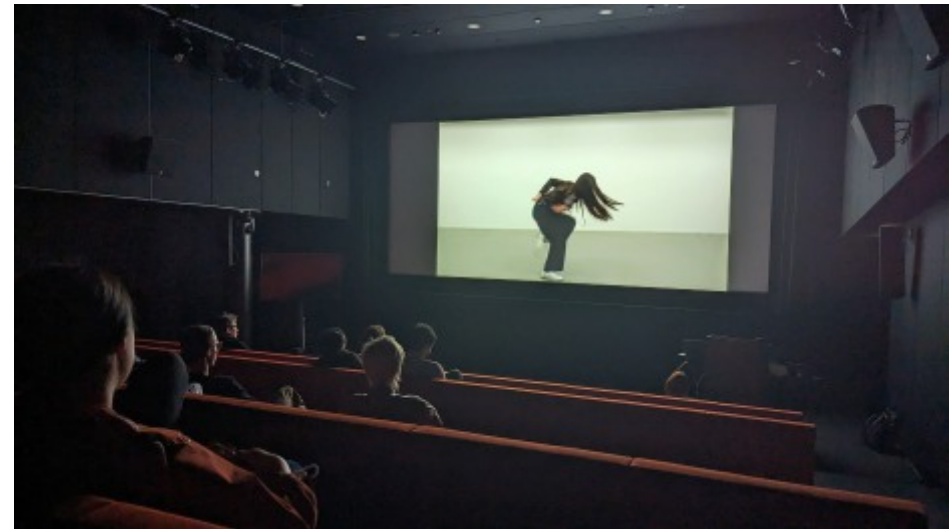
Kino Toni, Zurich (2023)