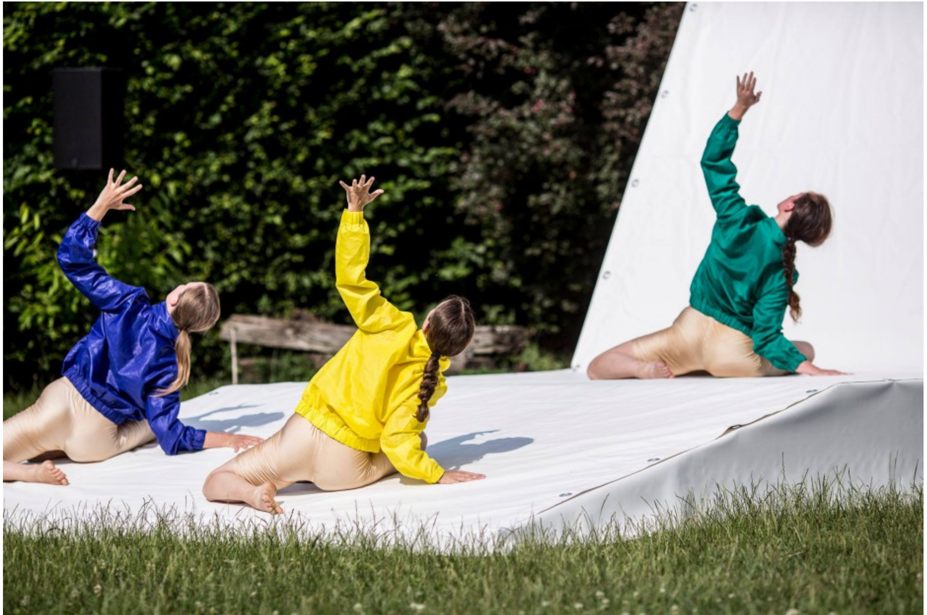
Prague City Gallery - Troja Chateau, Prague (2021)