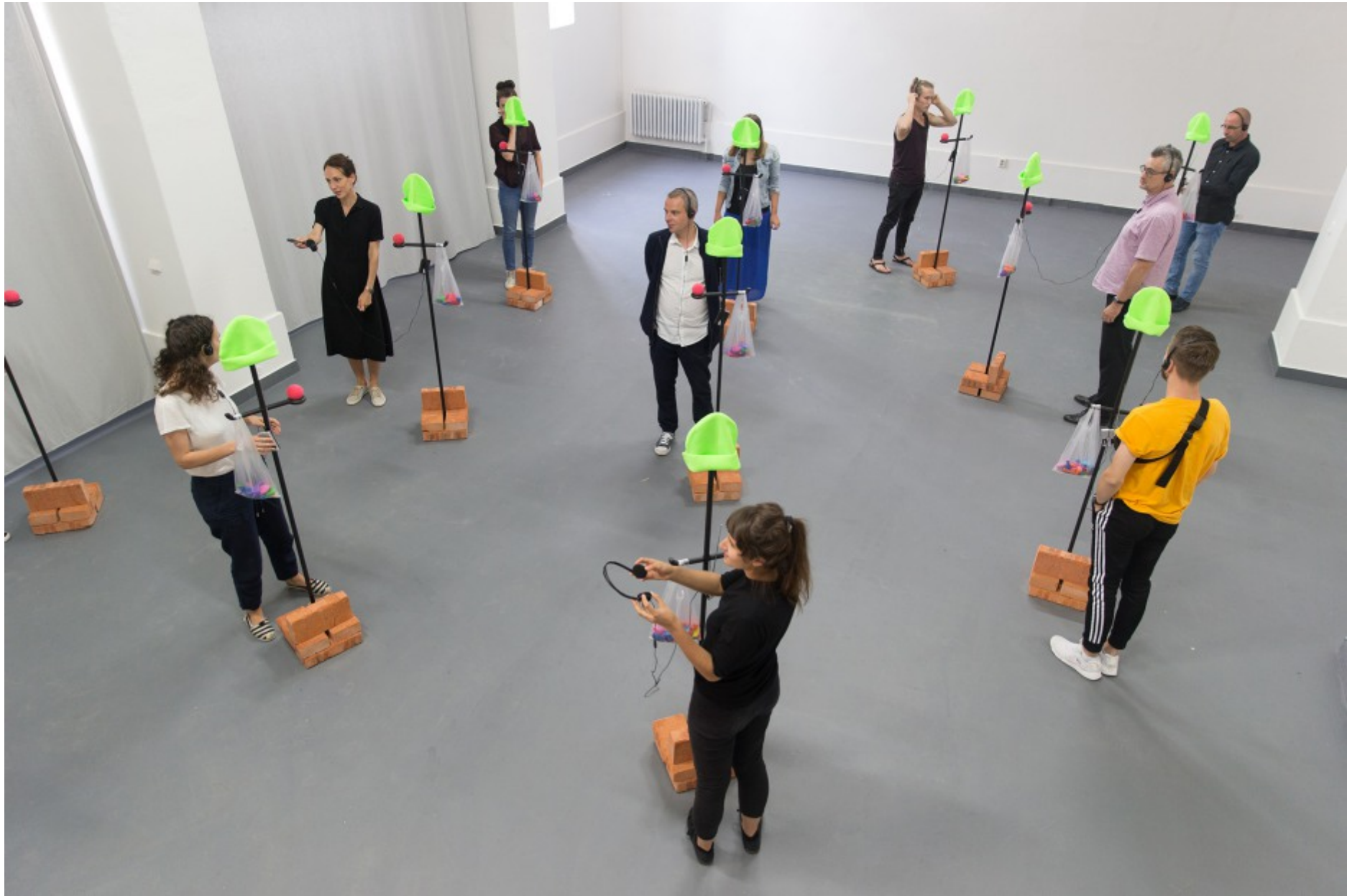
Another Place exhibition (2018), Academy of Fine Arts in Prague