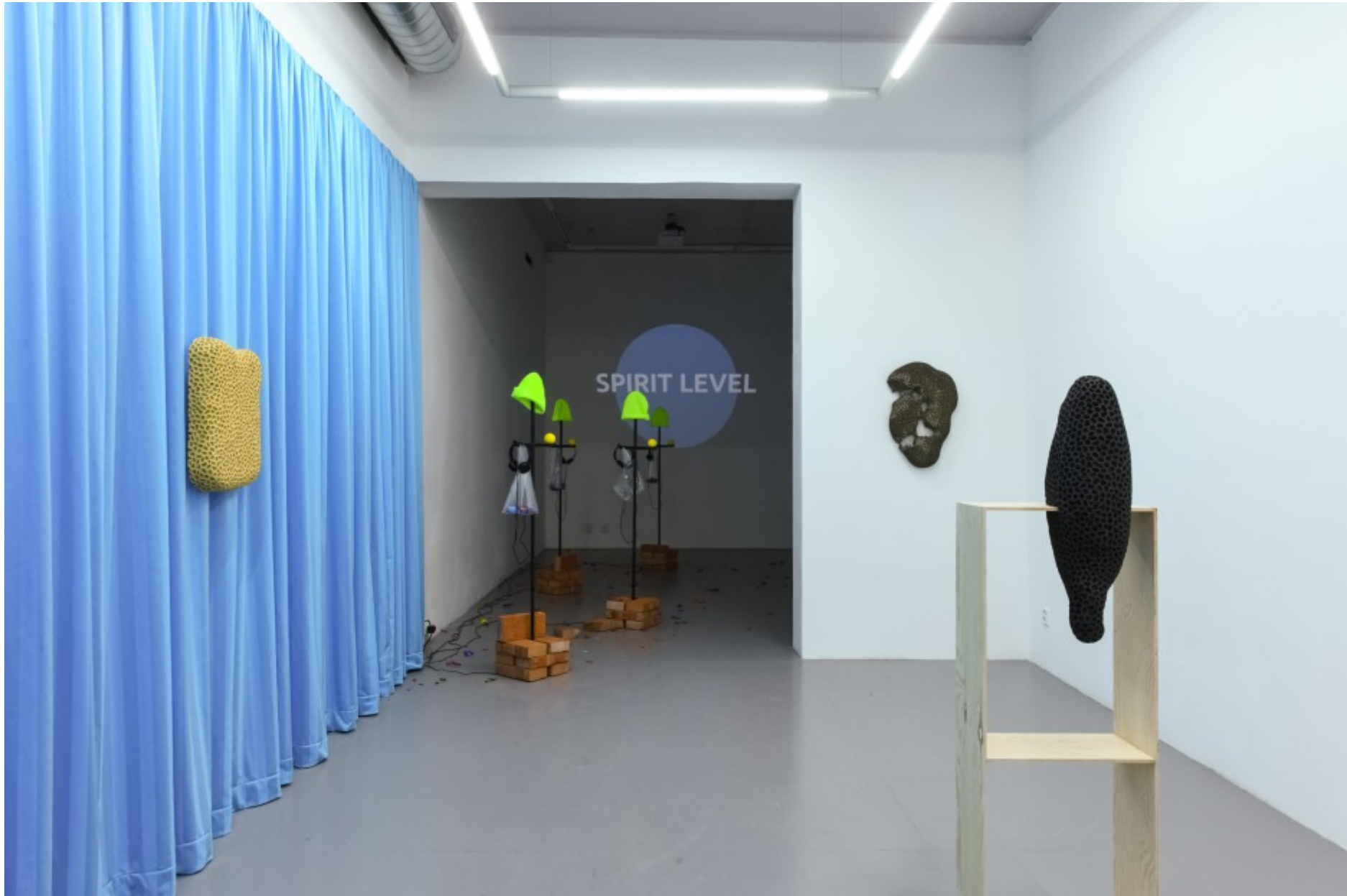
Prag_Kassel: Hybrid Inconvenience exhibition (2018), NoD Gallery, Prague