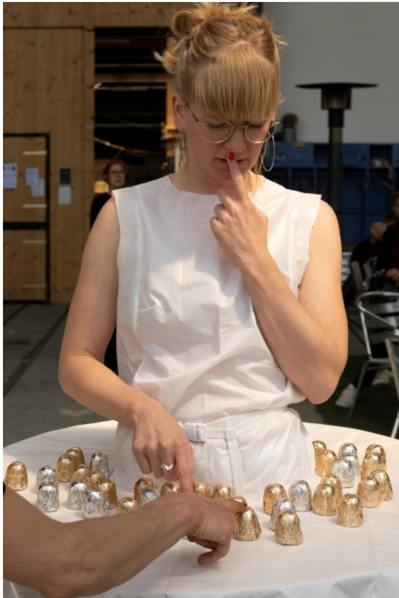
ACT Performance Festival Biel (2022)