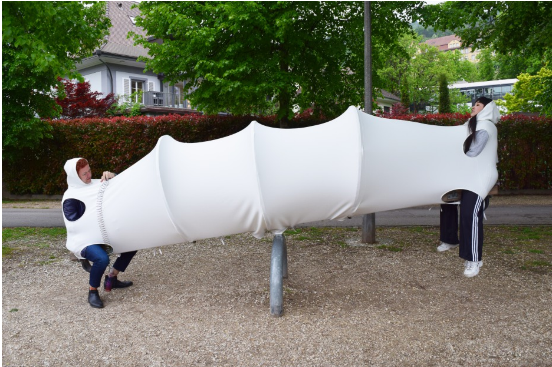
ACT Performance Festival Biel (2022)